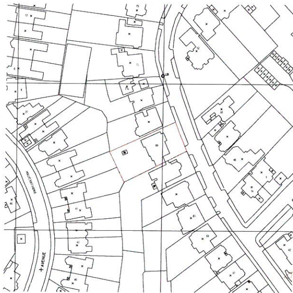
Site Location Plan Scale 1:1250