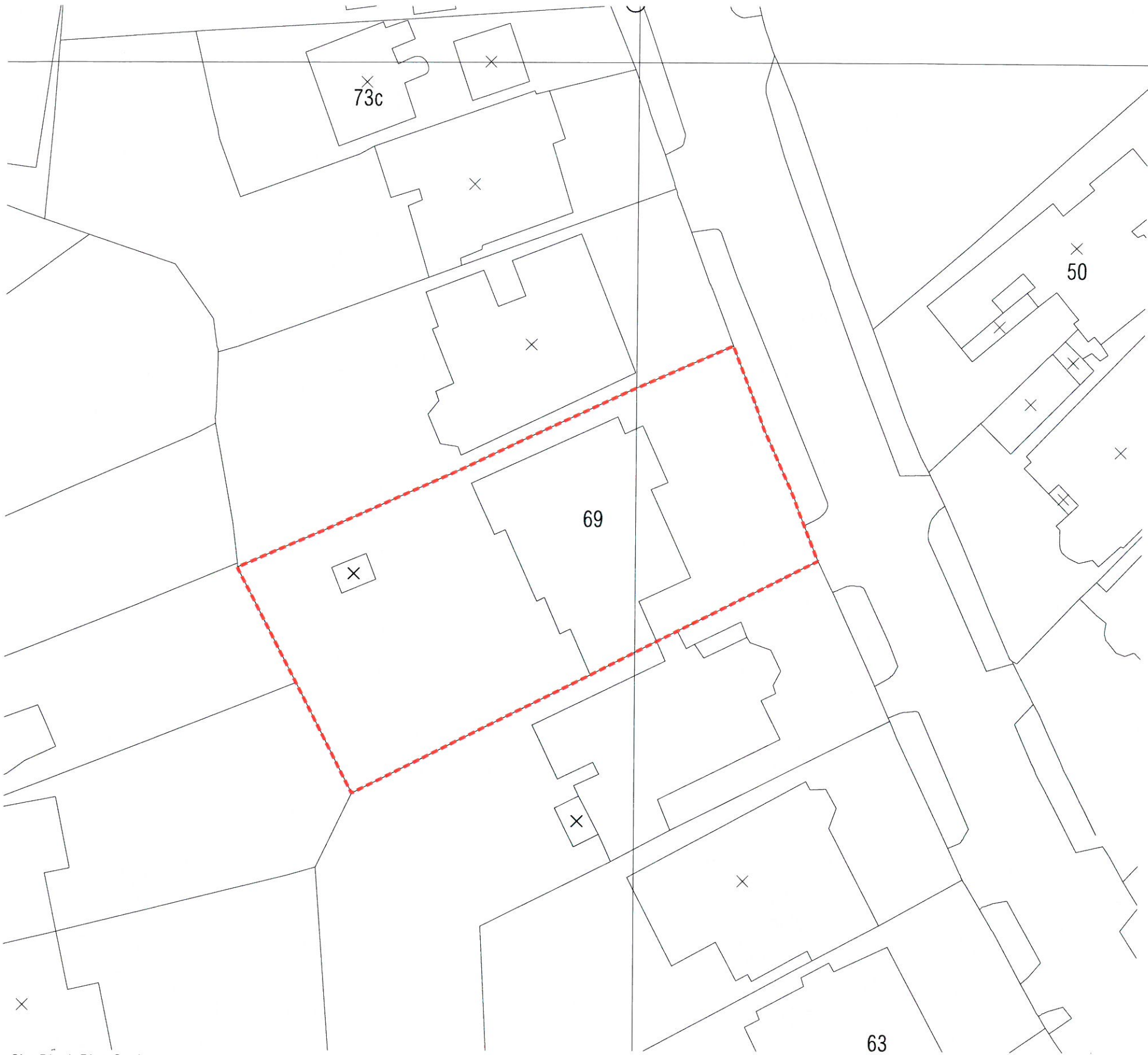
Site Block Plan Scale 1:200

Notes: Survey information provided by Mark Newman Surveys. All dimensions to be checked on site prior to manufacture. All materials to be recycled where possible.