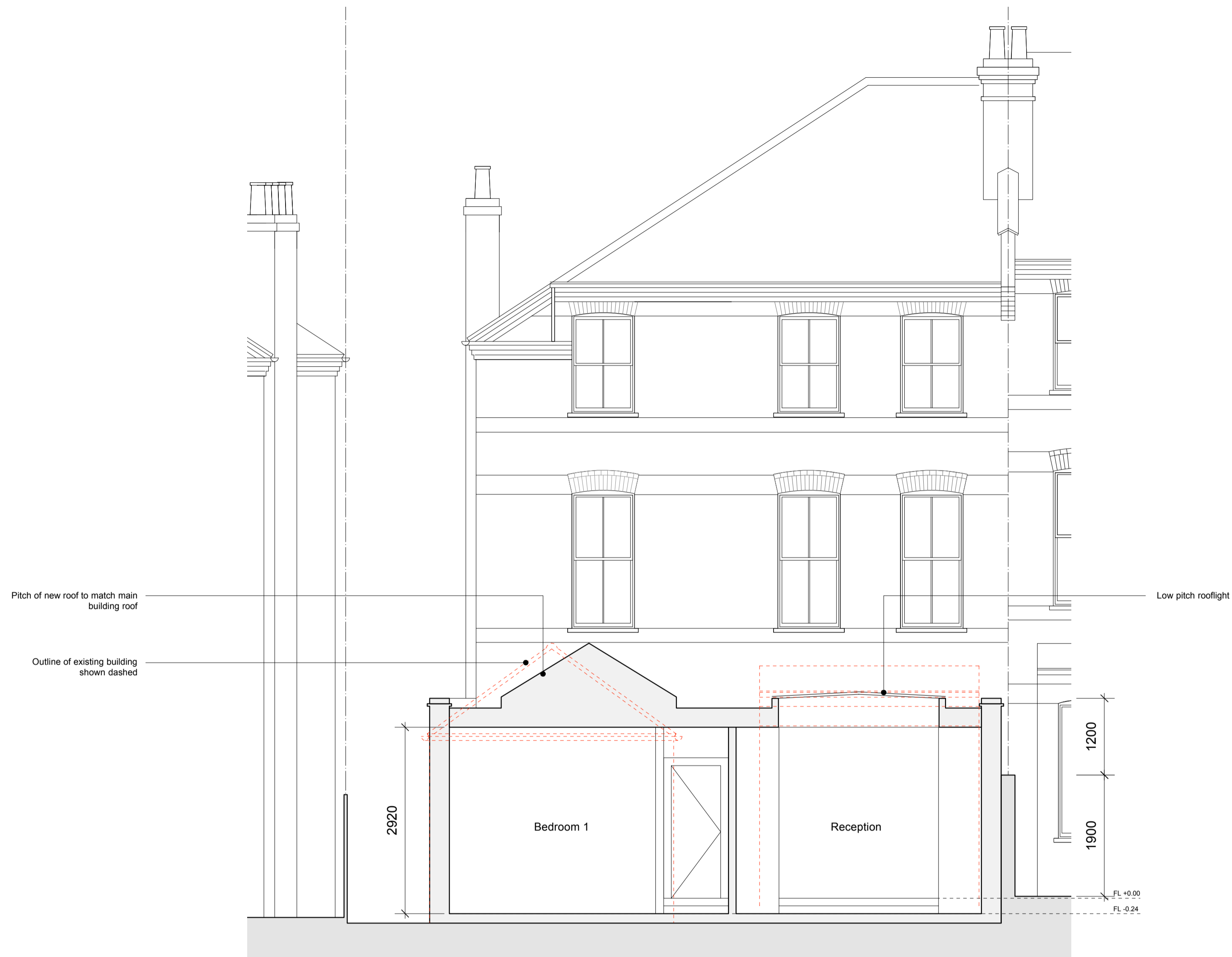
Proposed Section B-B