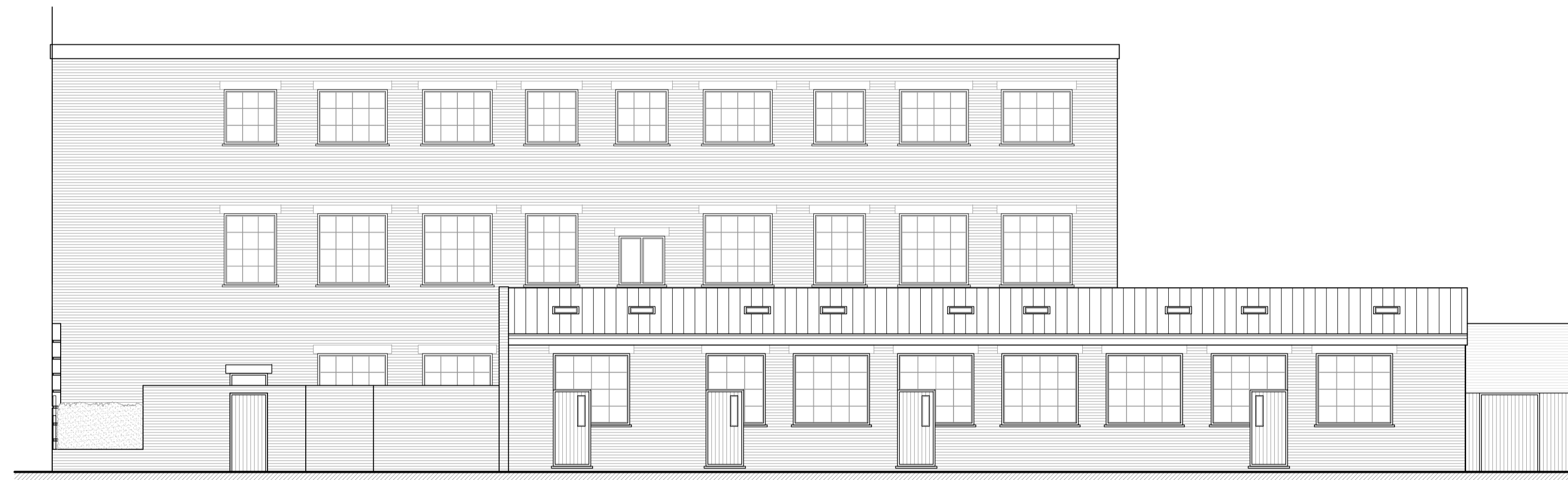
PROPOSED SIDE ELEVATION (NORTH)