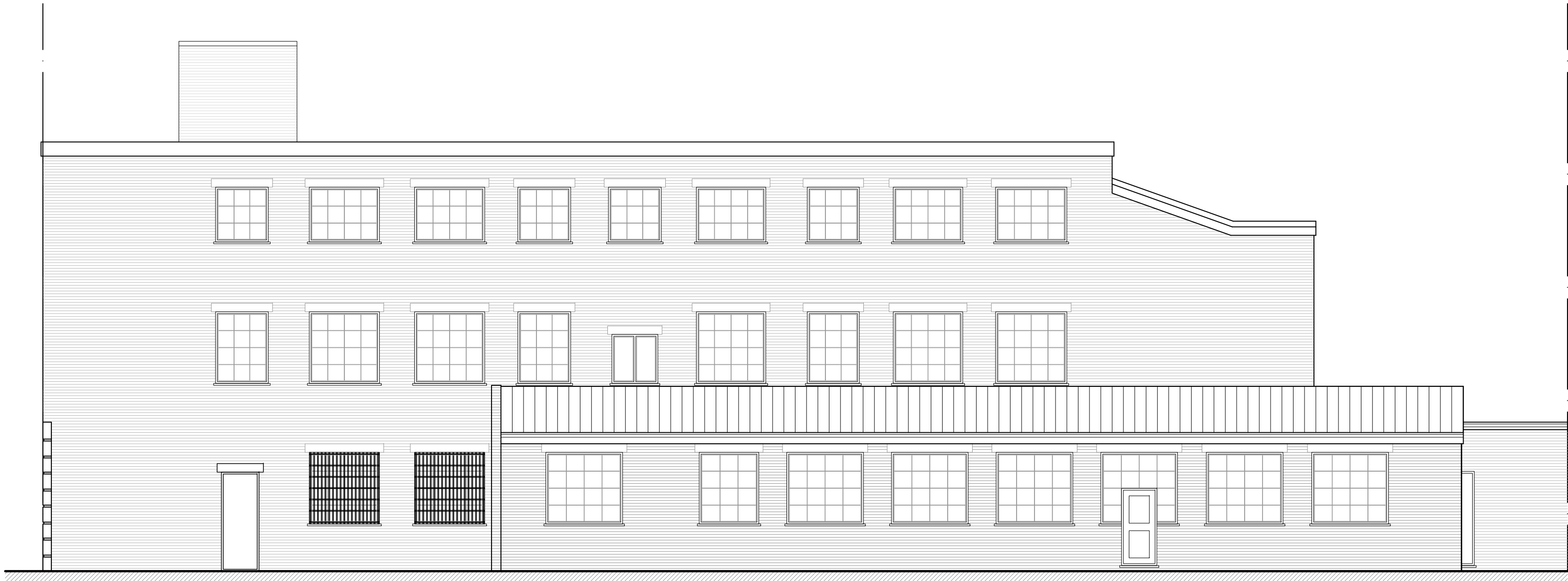
EXISTING SIDE ELEVATION (NORTH)