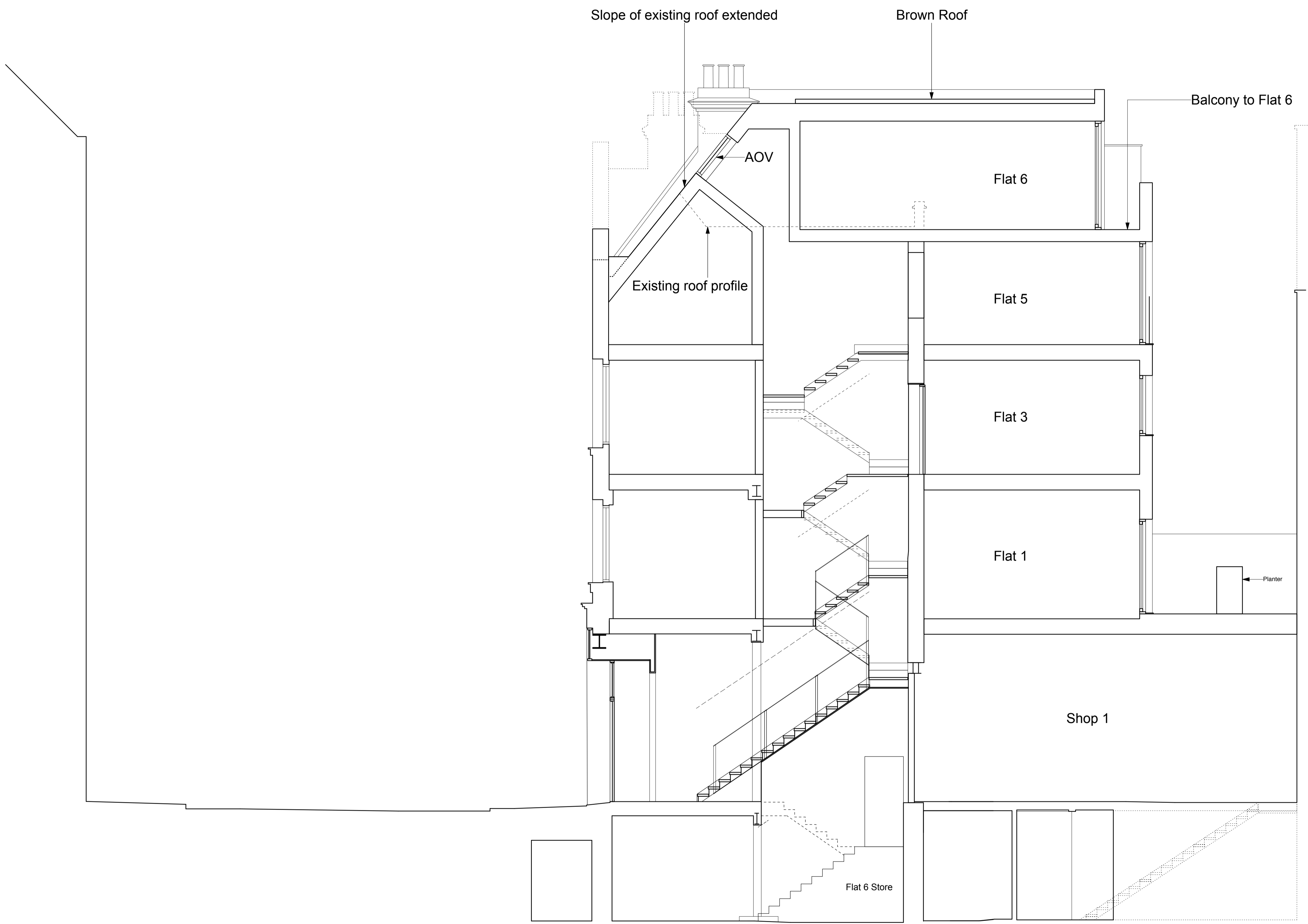
01/P214 Proposed Section AA