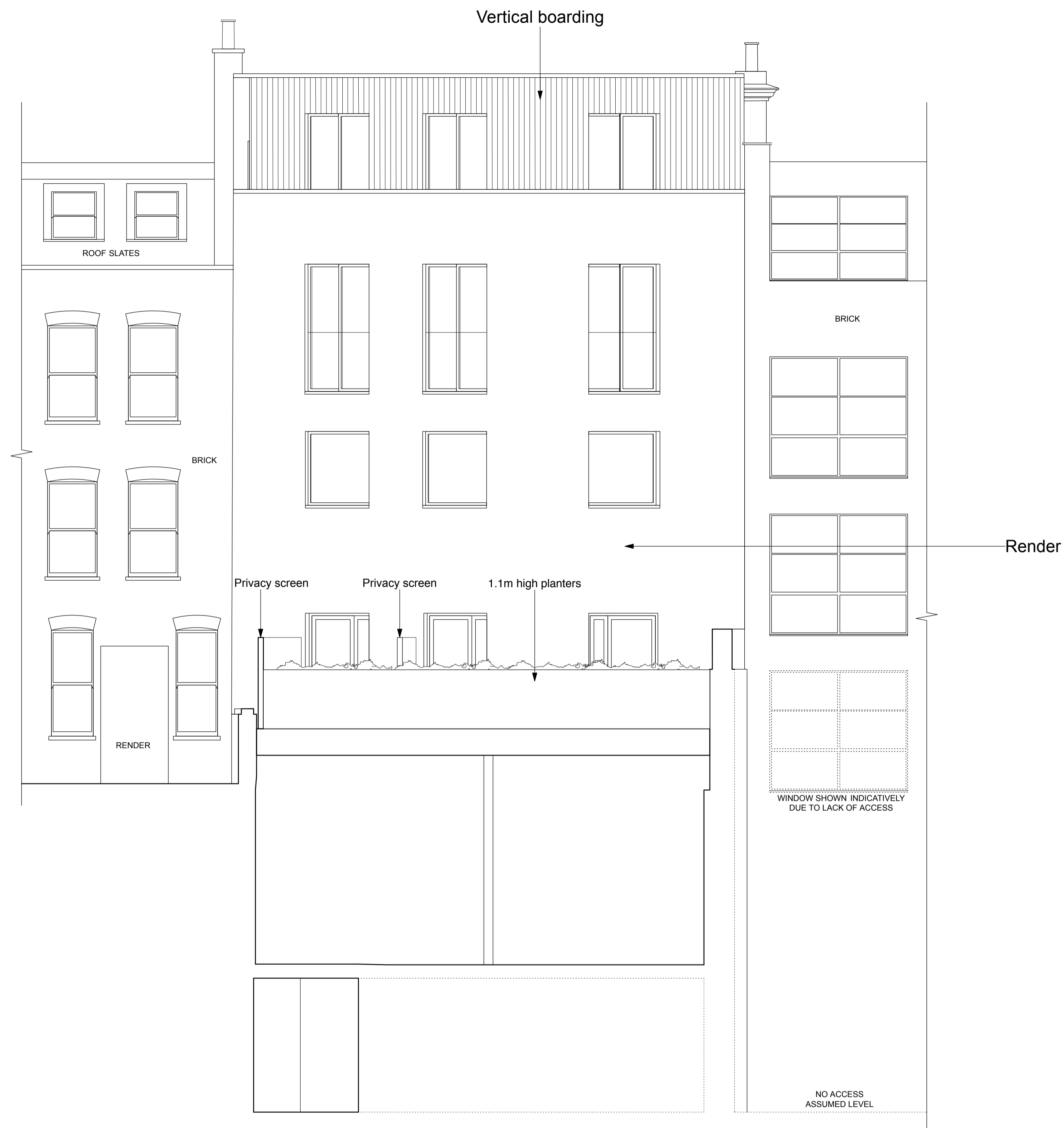
01/P213 Proposed Rear Elevation