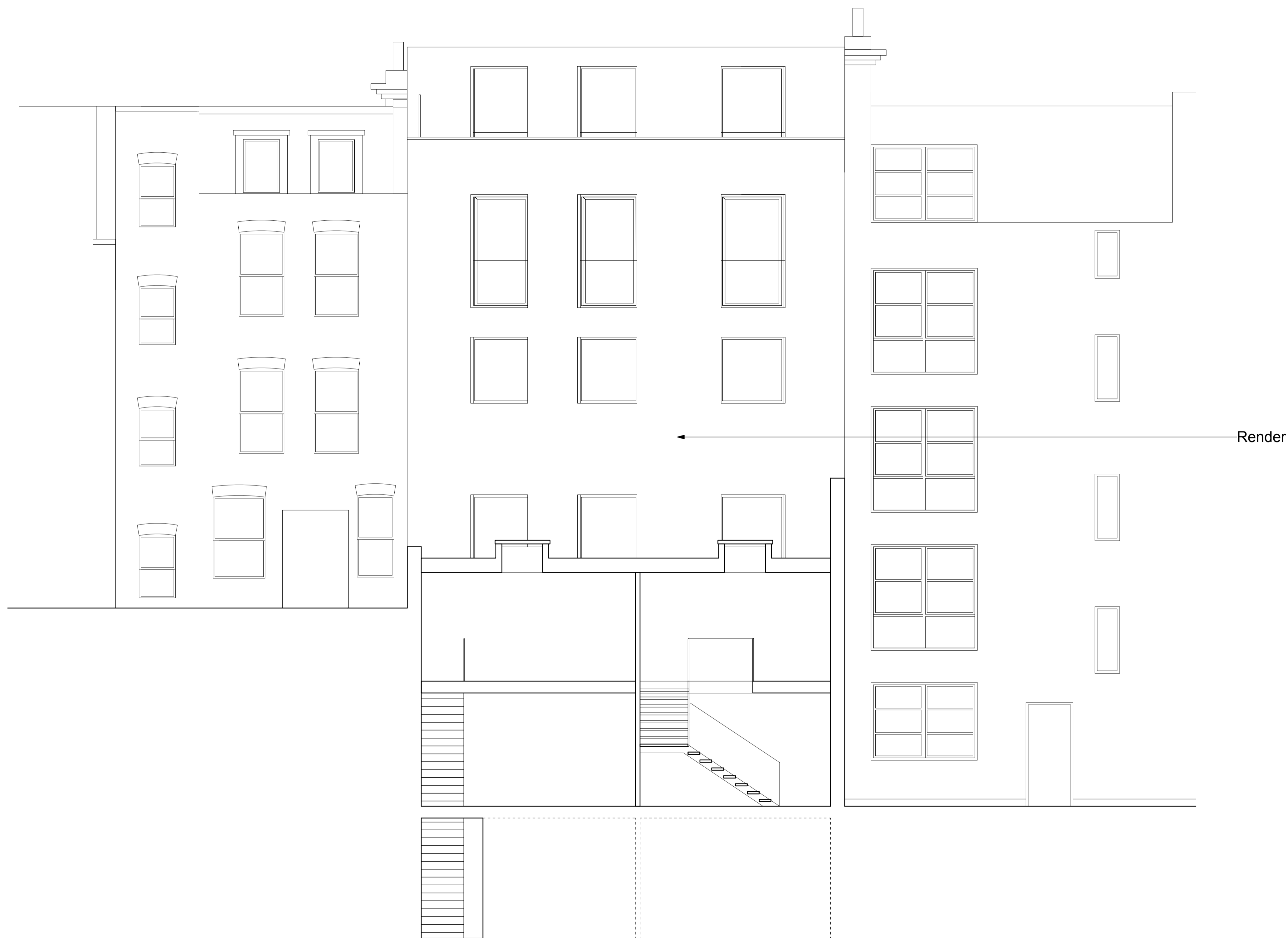
01/P213 Proposed Rear Elevation