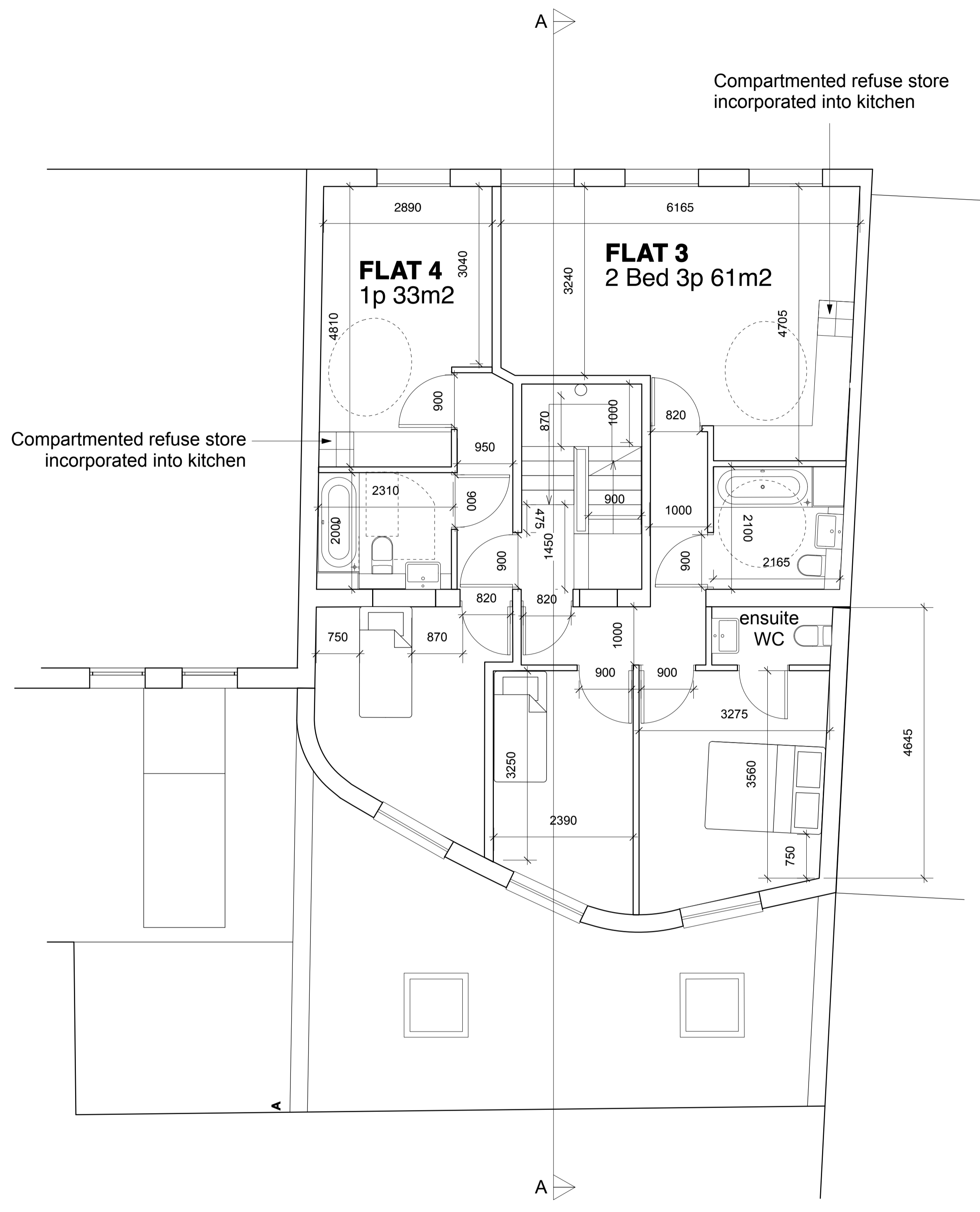
02/P209 Proposed Second Floor Plan