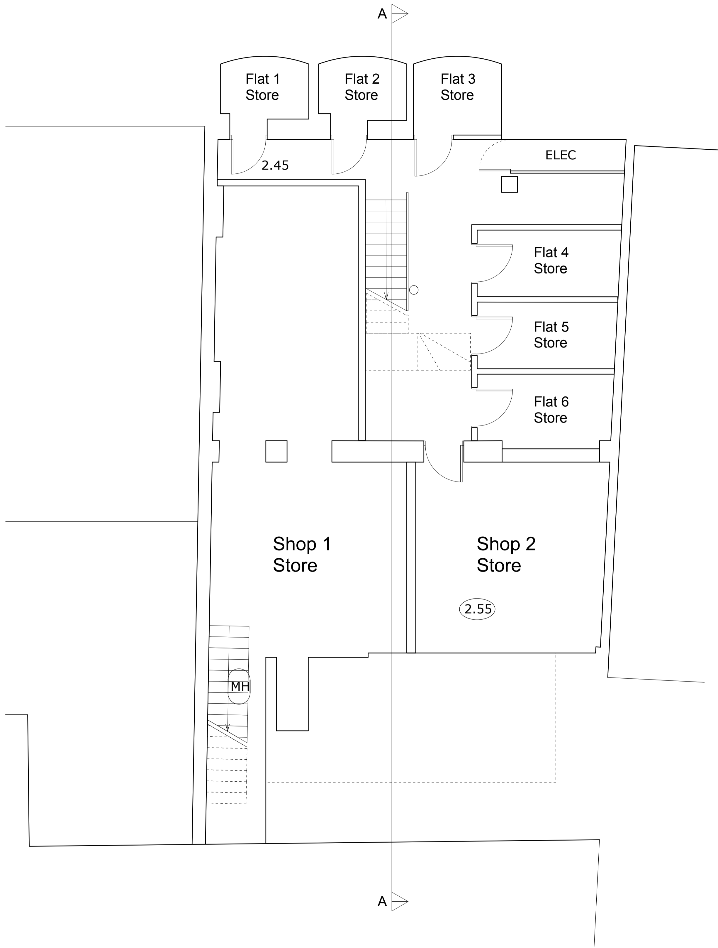
01/P208 Proposed Basement Plan