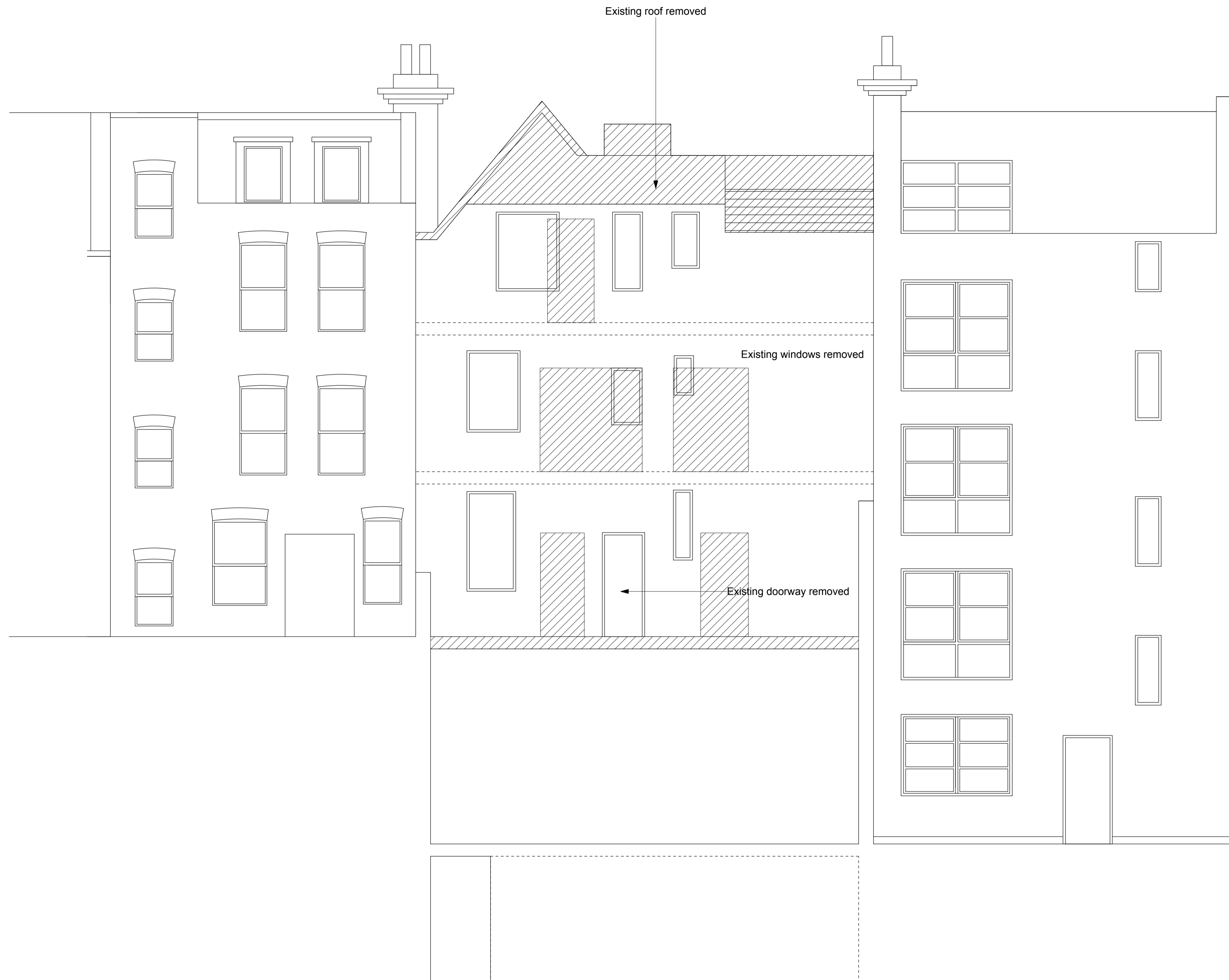
01/P206 Existing Rear Elevation