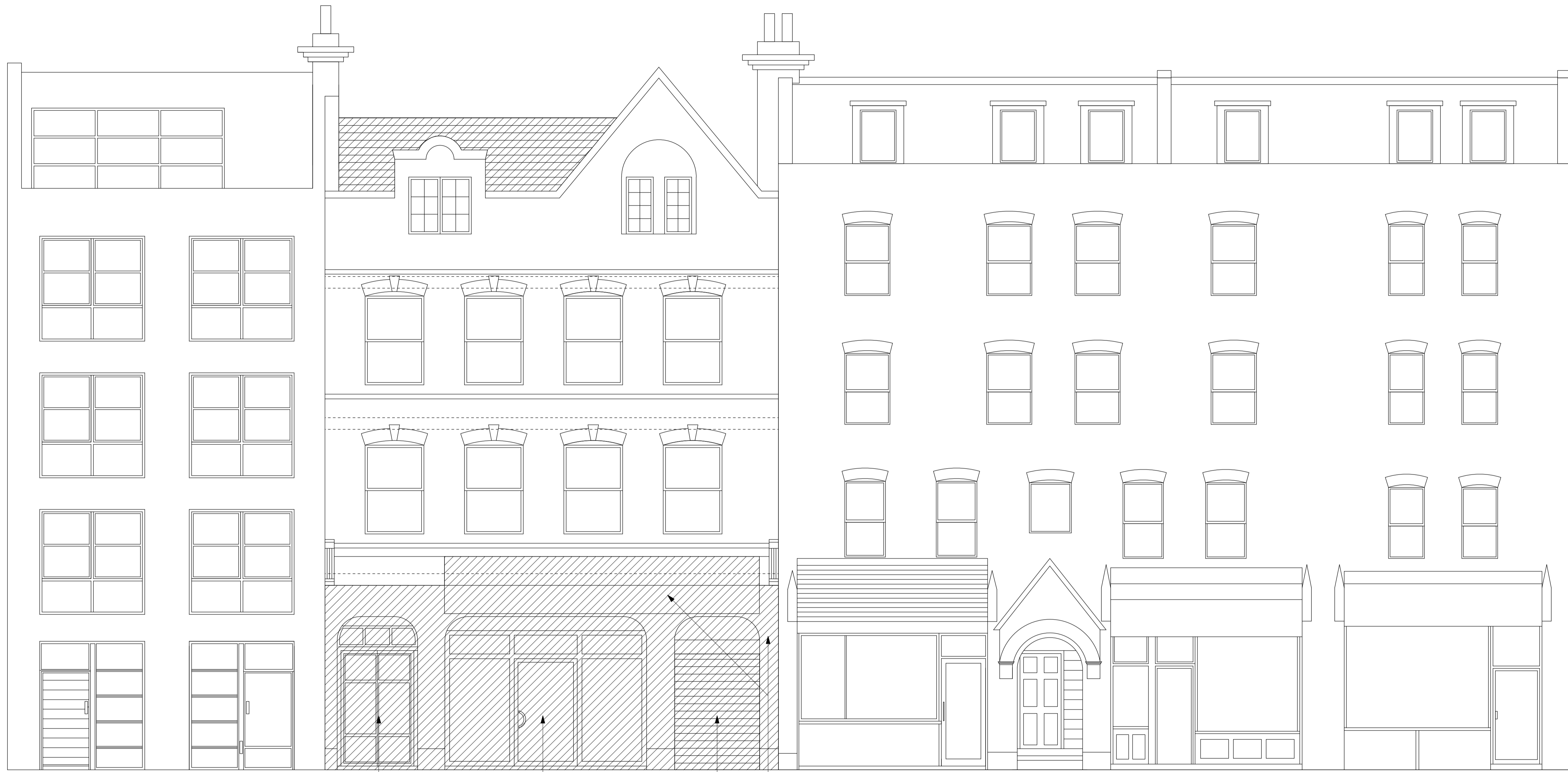
01/P205 Existing Front Elevation