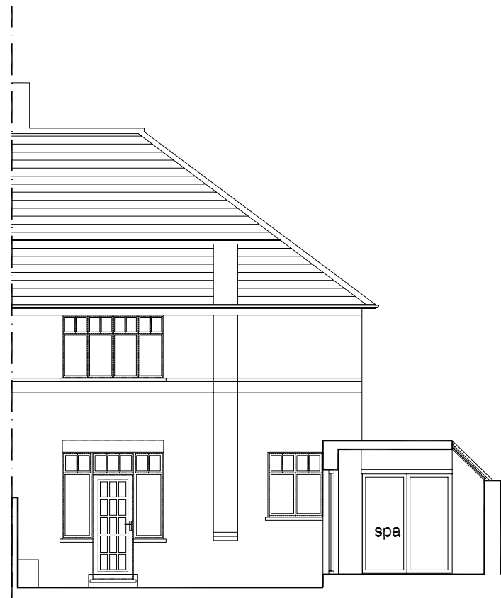
Sectional Elevation BB as existing