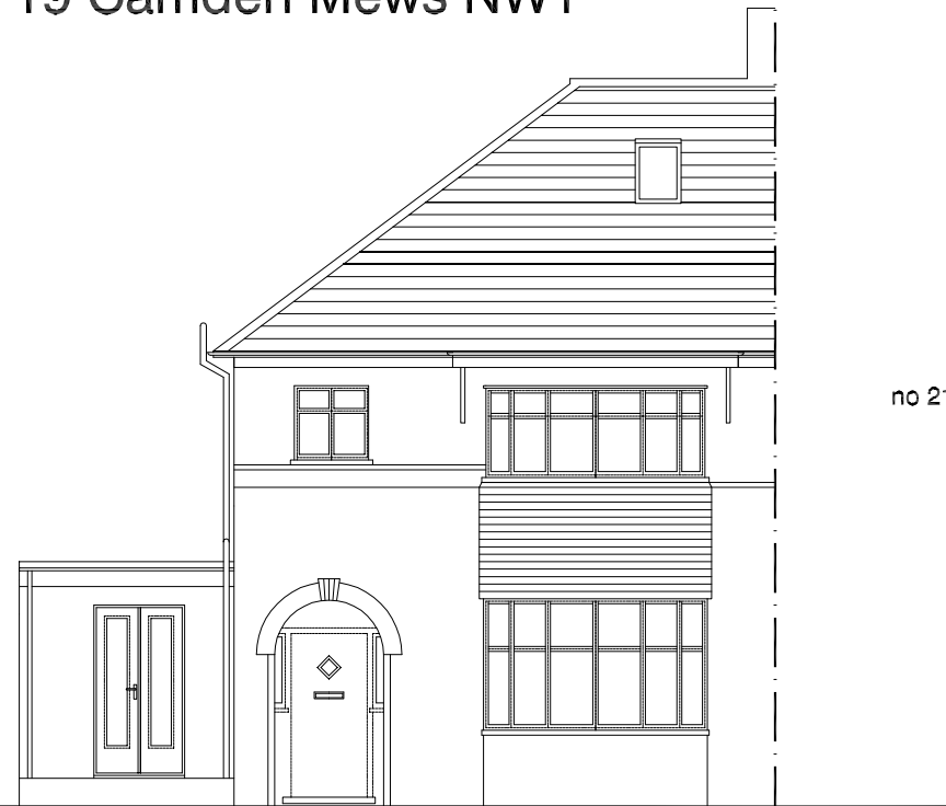
front elevation as existing