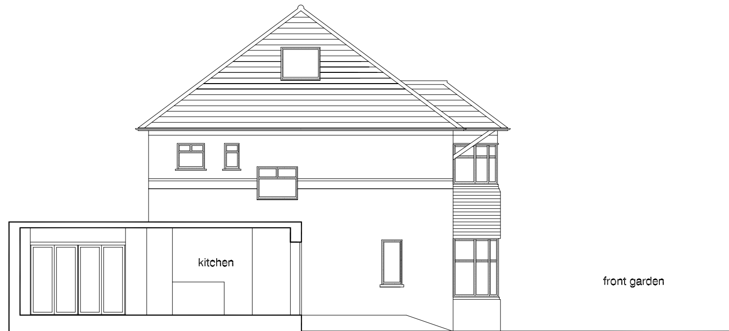
Sectional Elevation AA as existing