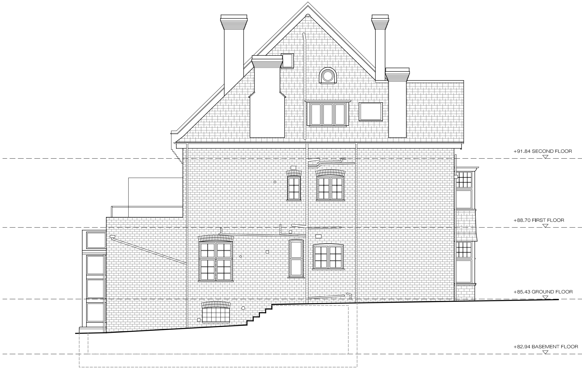
01 Side Elevation