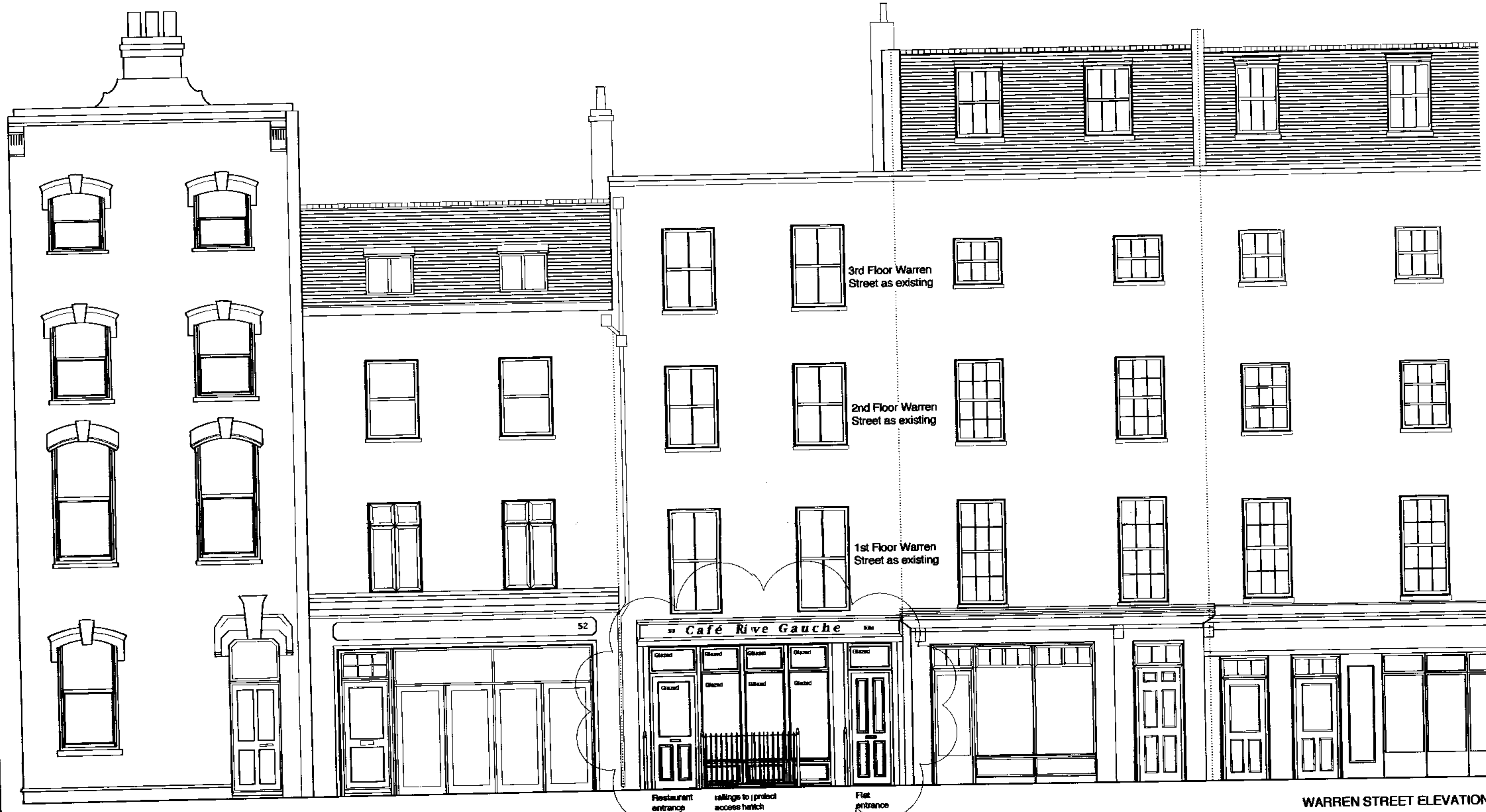
WARREN STREET ELEVATION

337 Euston Road See drawing RG/2003 for details of shop front New stained timber shop front including entrance door to new maisonette above 337 Euston Road