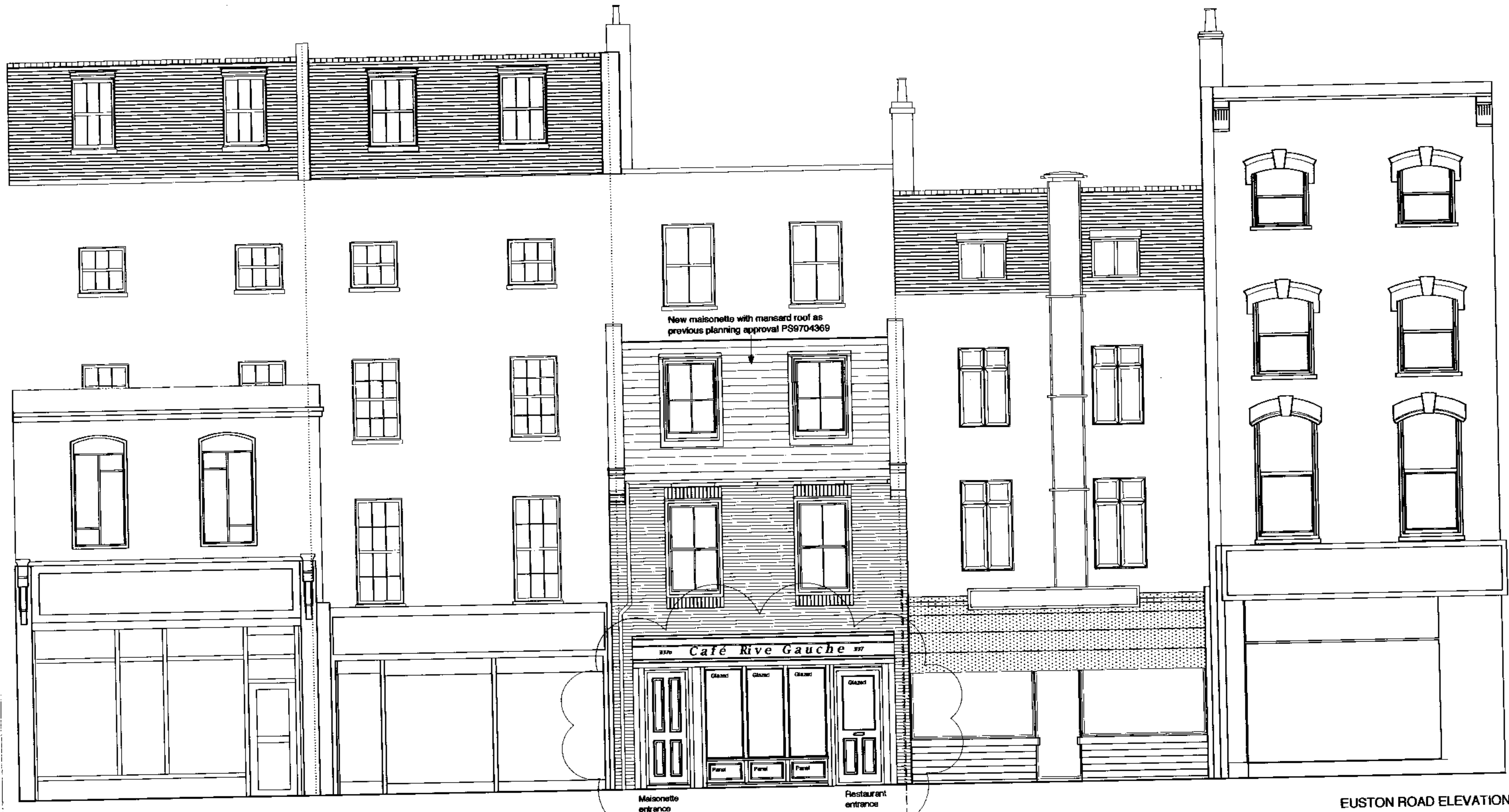
EUSTON ROAD ELEVATION

337 Euston Road See drawing RG/2003 for details of shop front New stained timber shop front including entrance door to new maisonette above 337 Euston Road