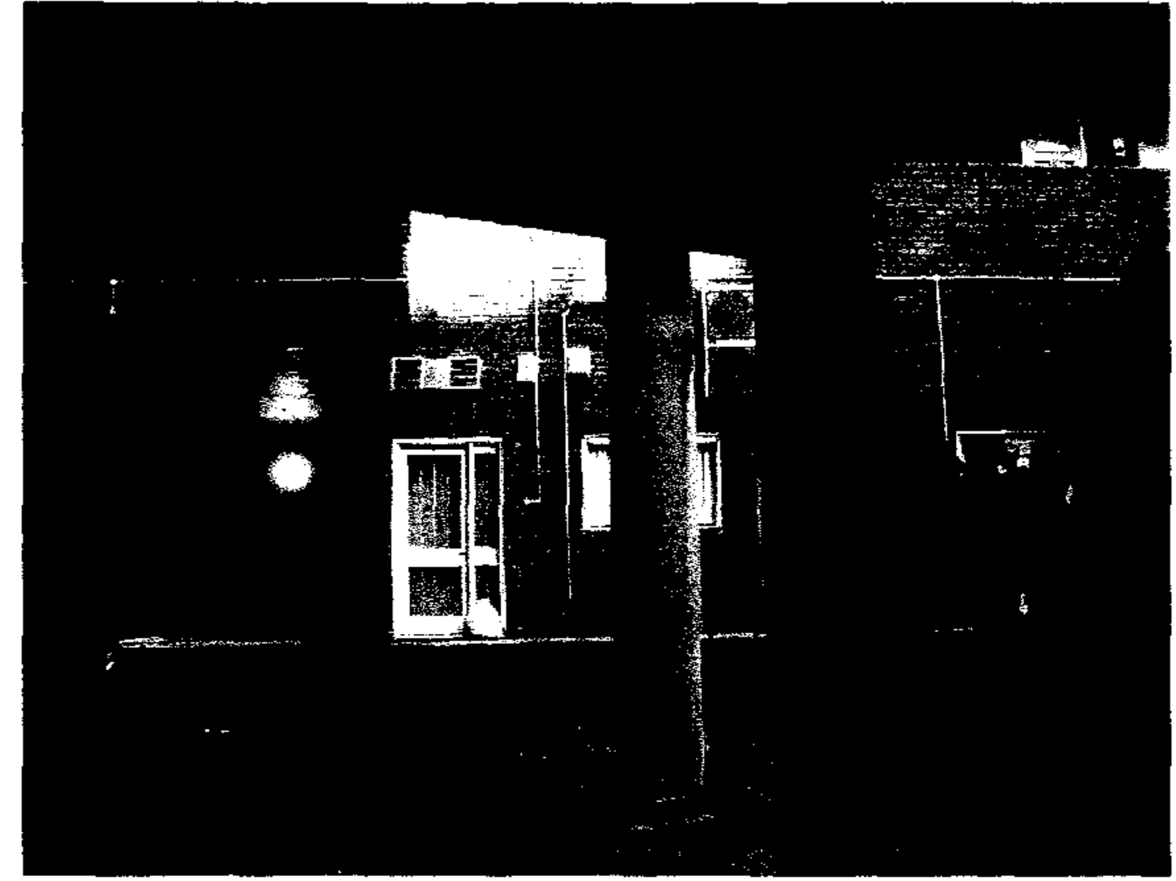
car park to rear of 15-17 Earham Street