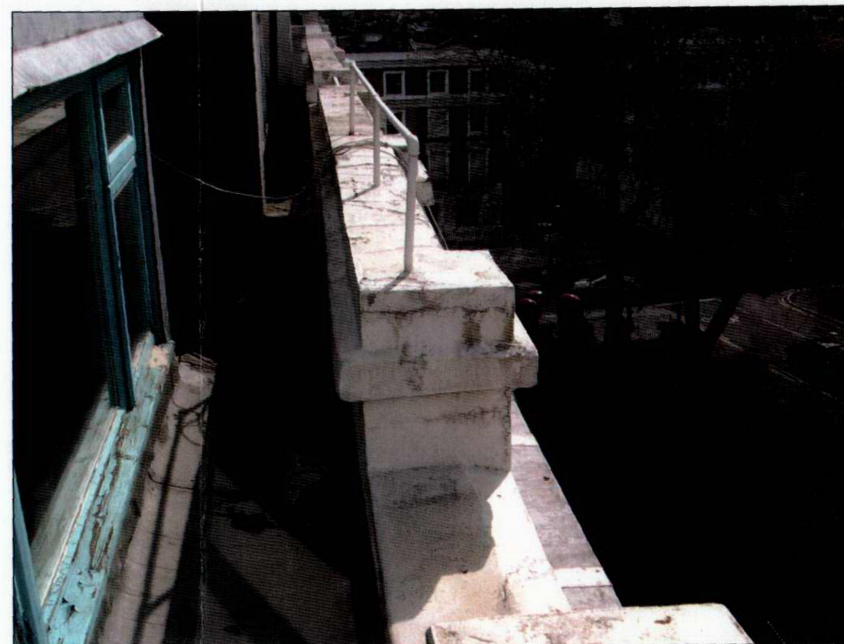
VIEW OF PARAPET FACING EAST

NOTES All dimensions to be checked on site prior to commencement of any works, and refer any discrepancies to the surveyor. This drawing is to be read in conjunction with the specification and all relevant drawings. Do not scale this drawing.