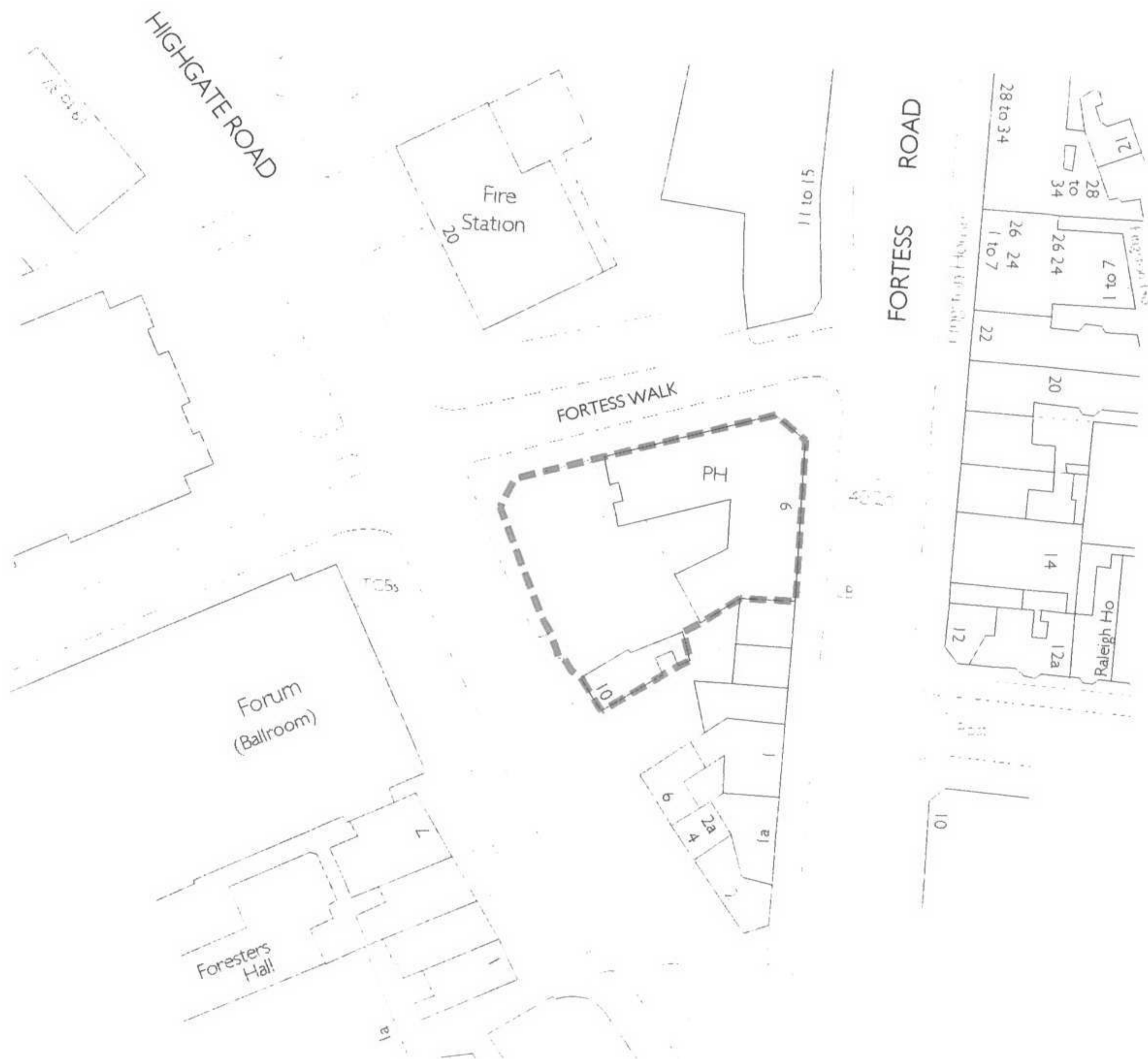
Image Three – Site Location Plan (Not to Scale) (Site Outlined in Red)