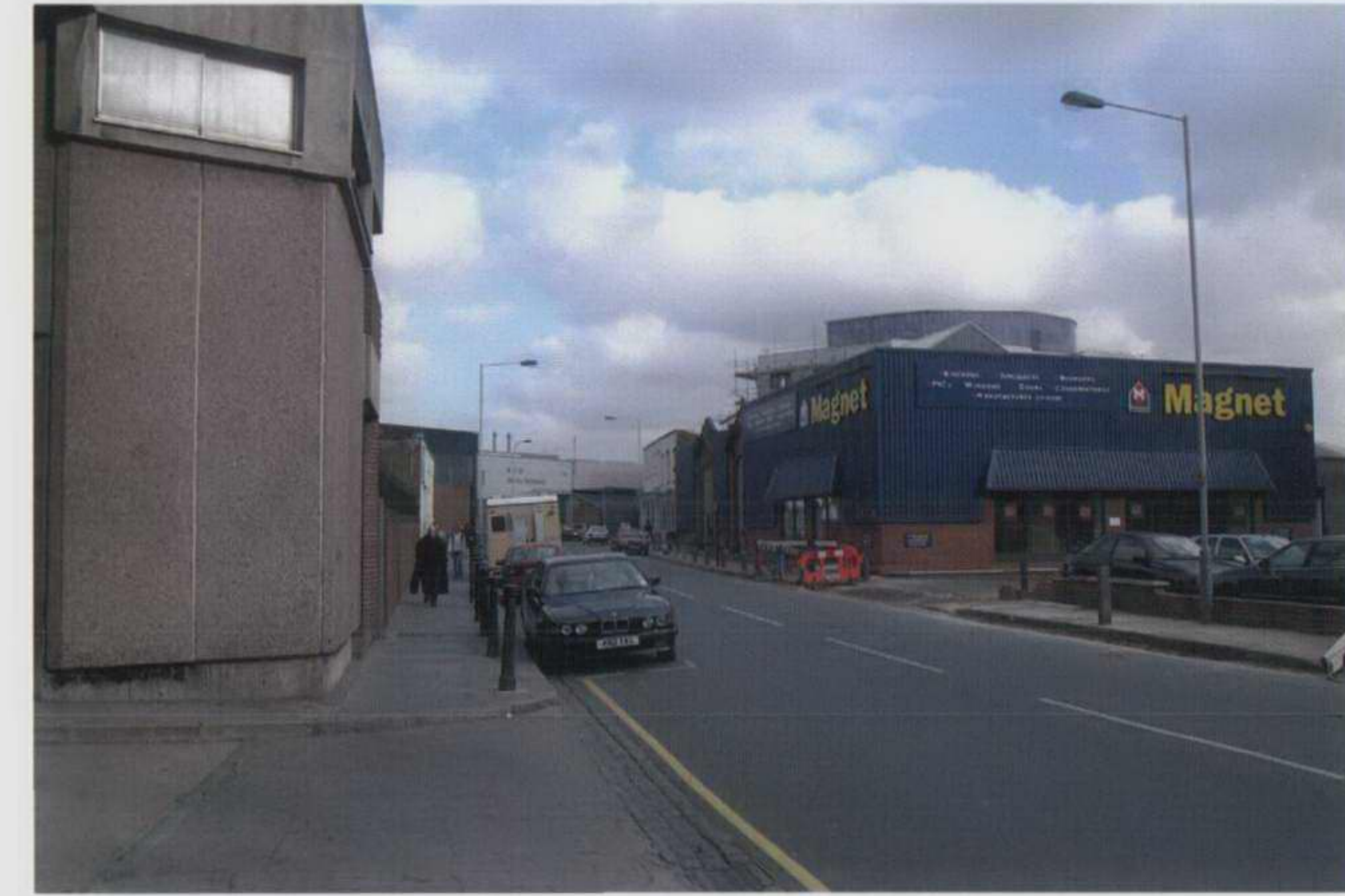
VIEW ALONG HOLMES ROAD LOOKING NORTH EAST