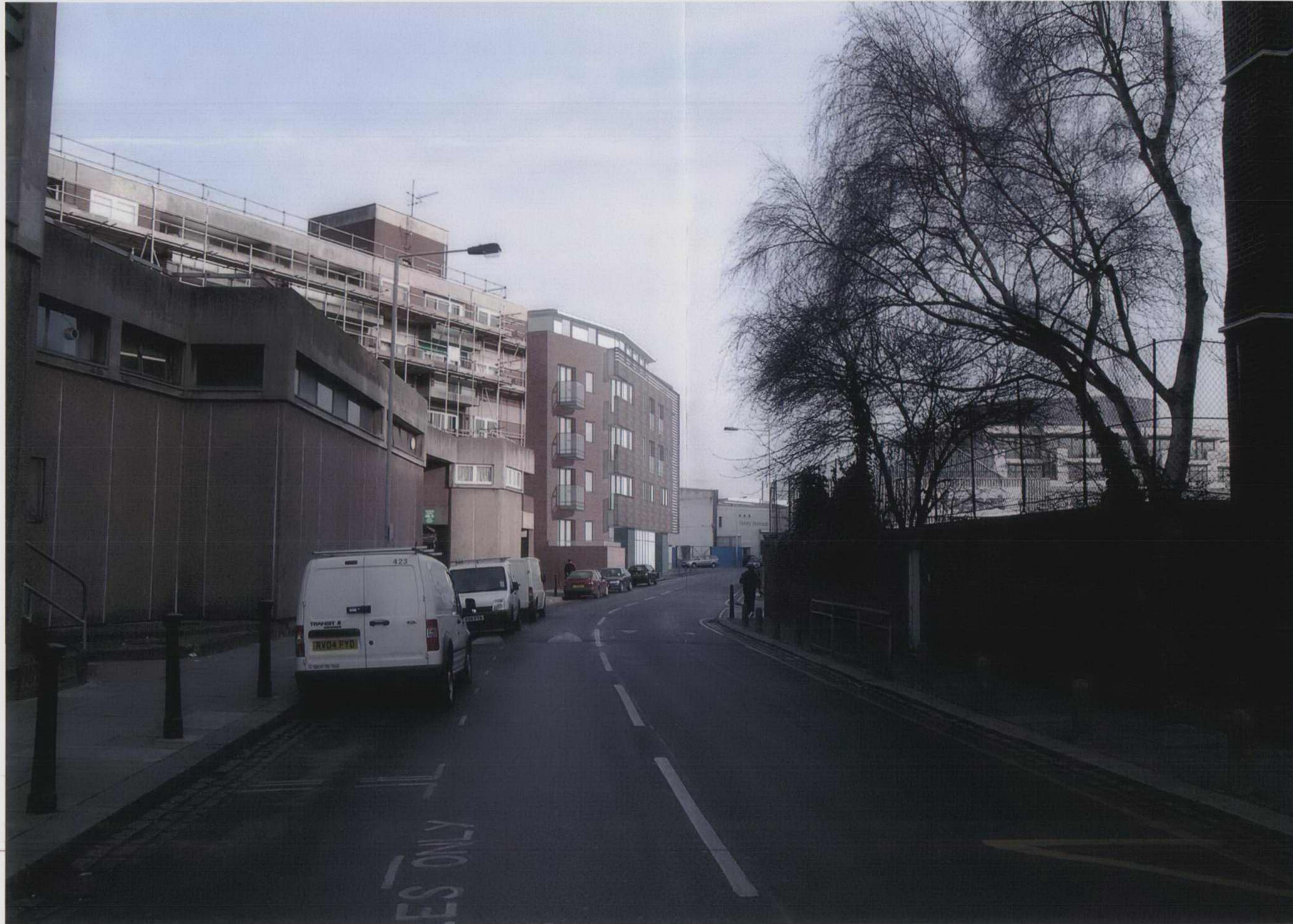
PHOT DRAWING NO. 810R 051- REV A 74A HOLMES ROAD : PROPOSED PHOTOMONTAGE 2