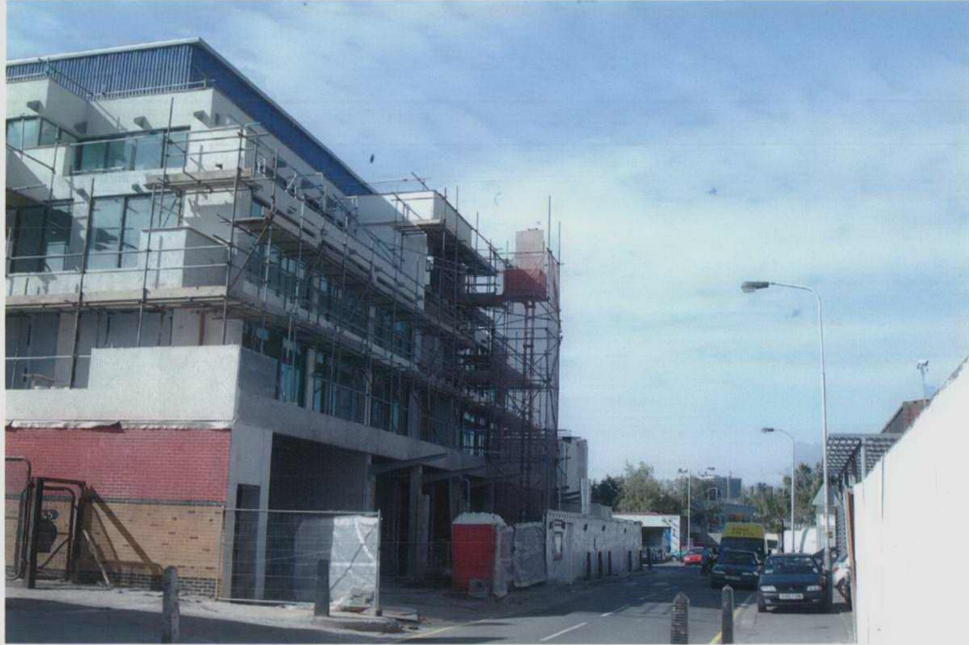
EXISTING VIEW OF HOLMES RD LOOKING NORTH EAST (FROM KENTISH TOWN RD END)