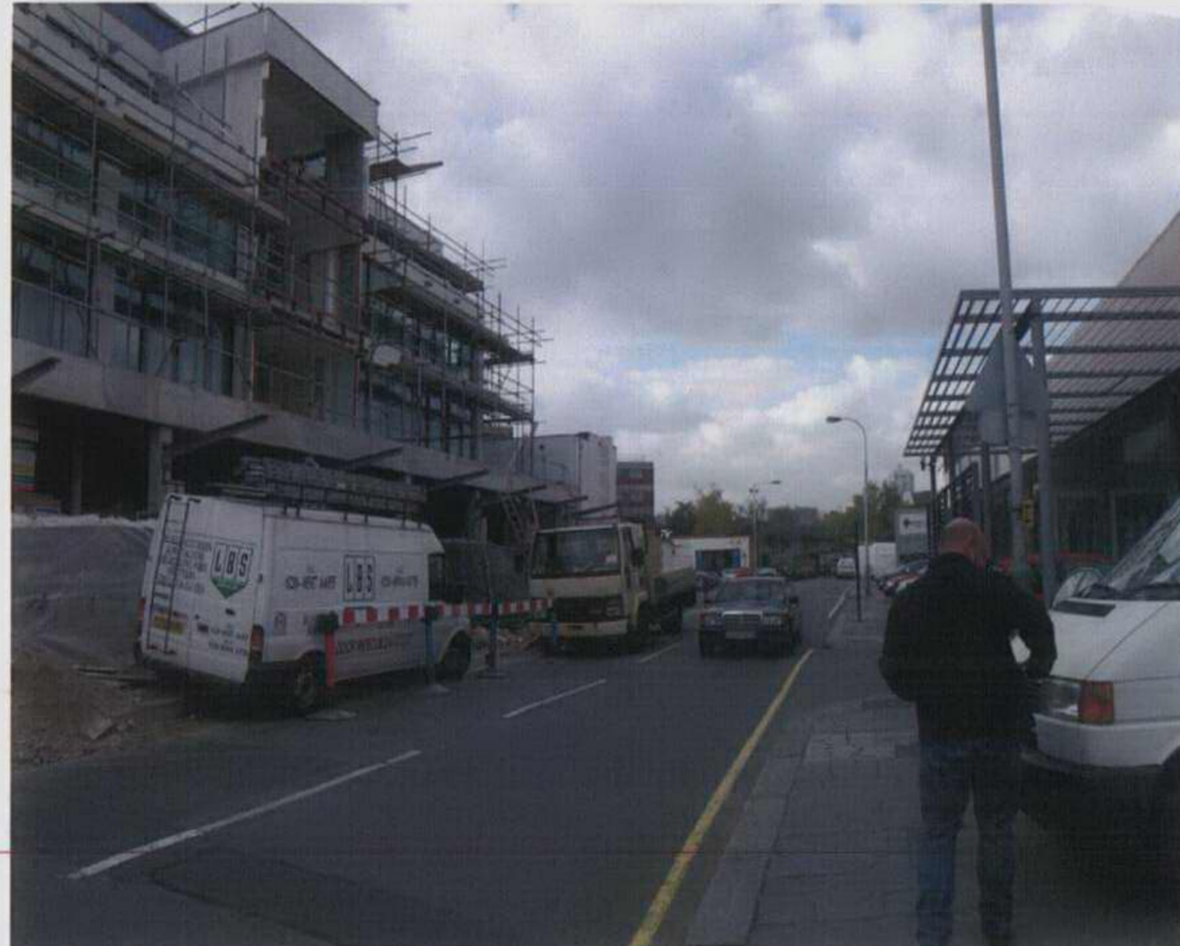
VIEW ALONG HOLMES RD LOOKING NORTH WEST- 74 A CORNER SITE AHEAD