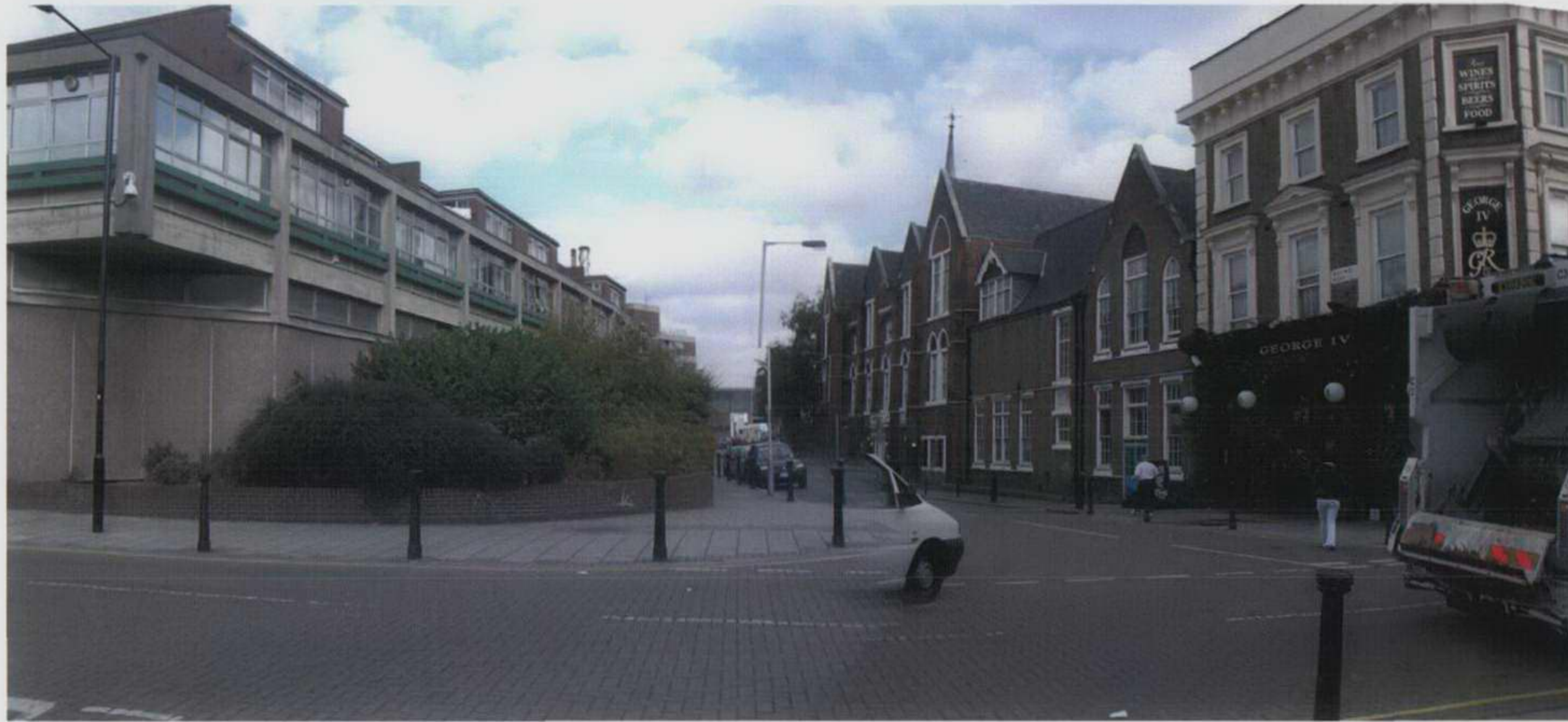
VIEW ALONG HOLMES ROAD FROM SPRING PLACE LOOKING NORTH EAST