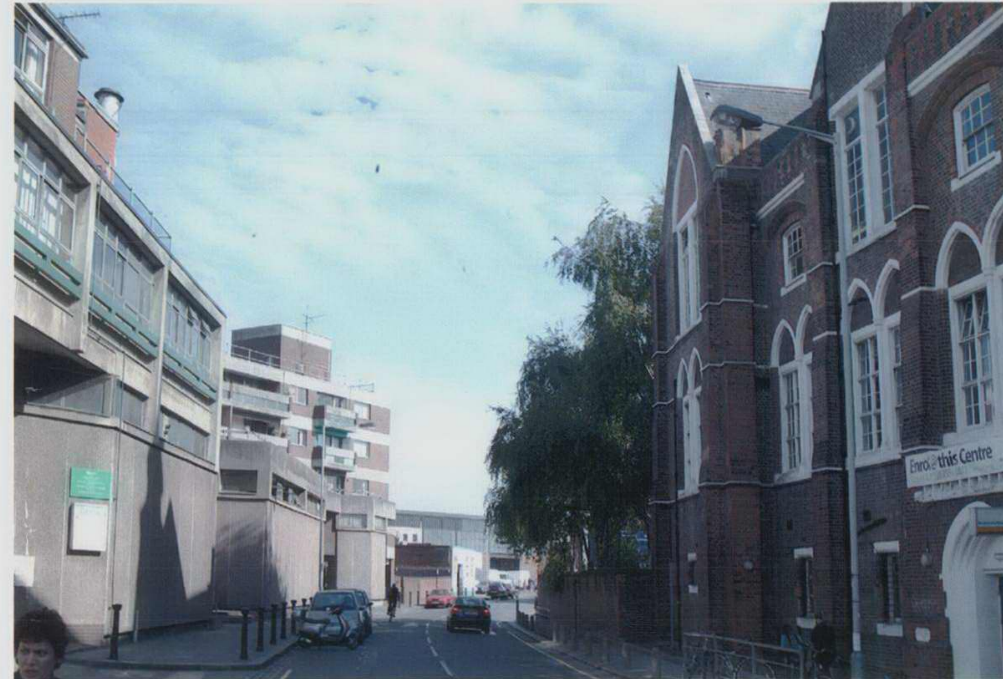
EXISTING VIEW OF HOLMES RD LOOKING NORTH WEST (FROM SPRING PLACE END)

PHOTO DRAWING NO. 810R 010 74A HOLMES ROAD : EXISTING CONTEXT PHOTOGRAPHS