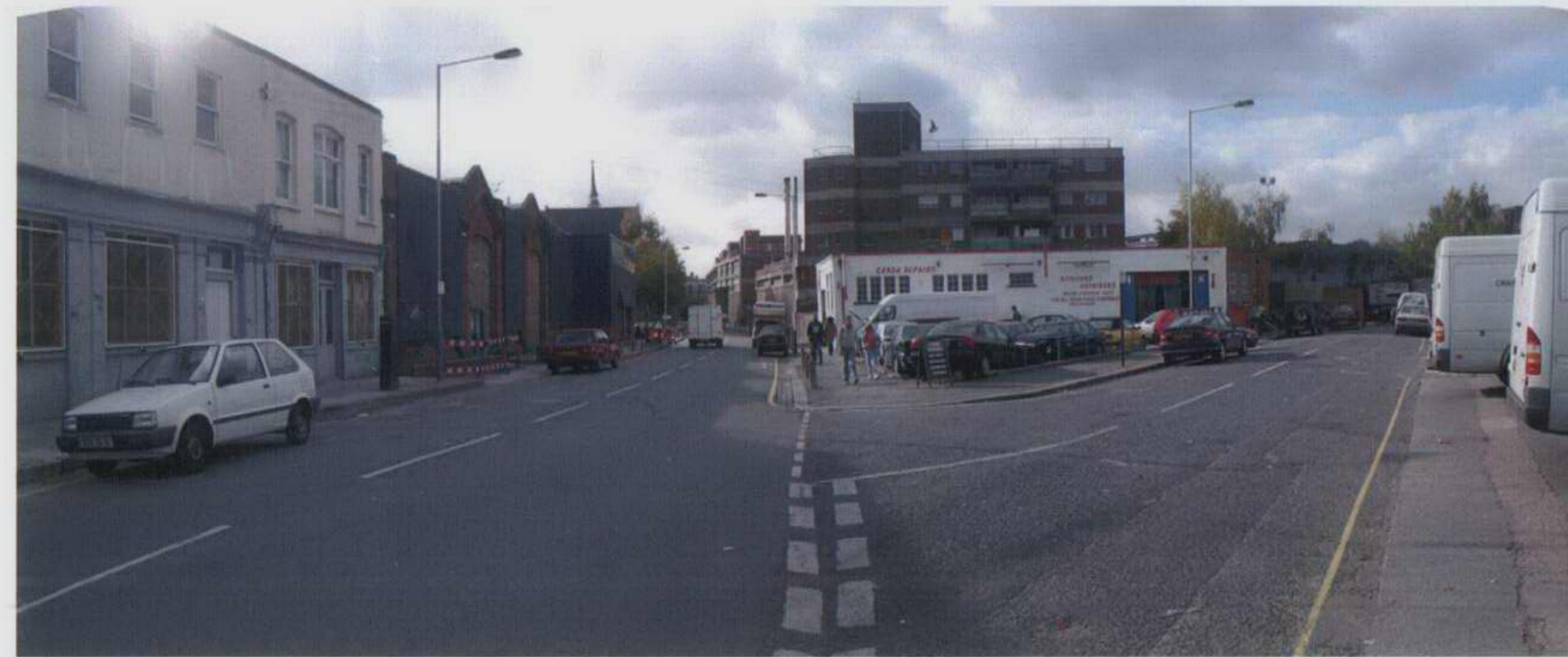
VIEW OF 74 A CORNER SITE

PHOTO DRAWING NO. 810R 011 74A HOLMES ROAD : EXISTING CONTEXT PHOTOGRAPHS