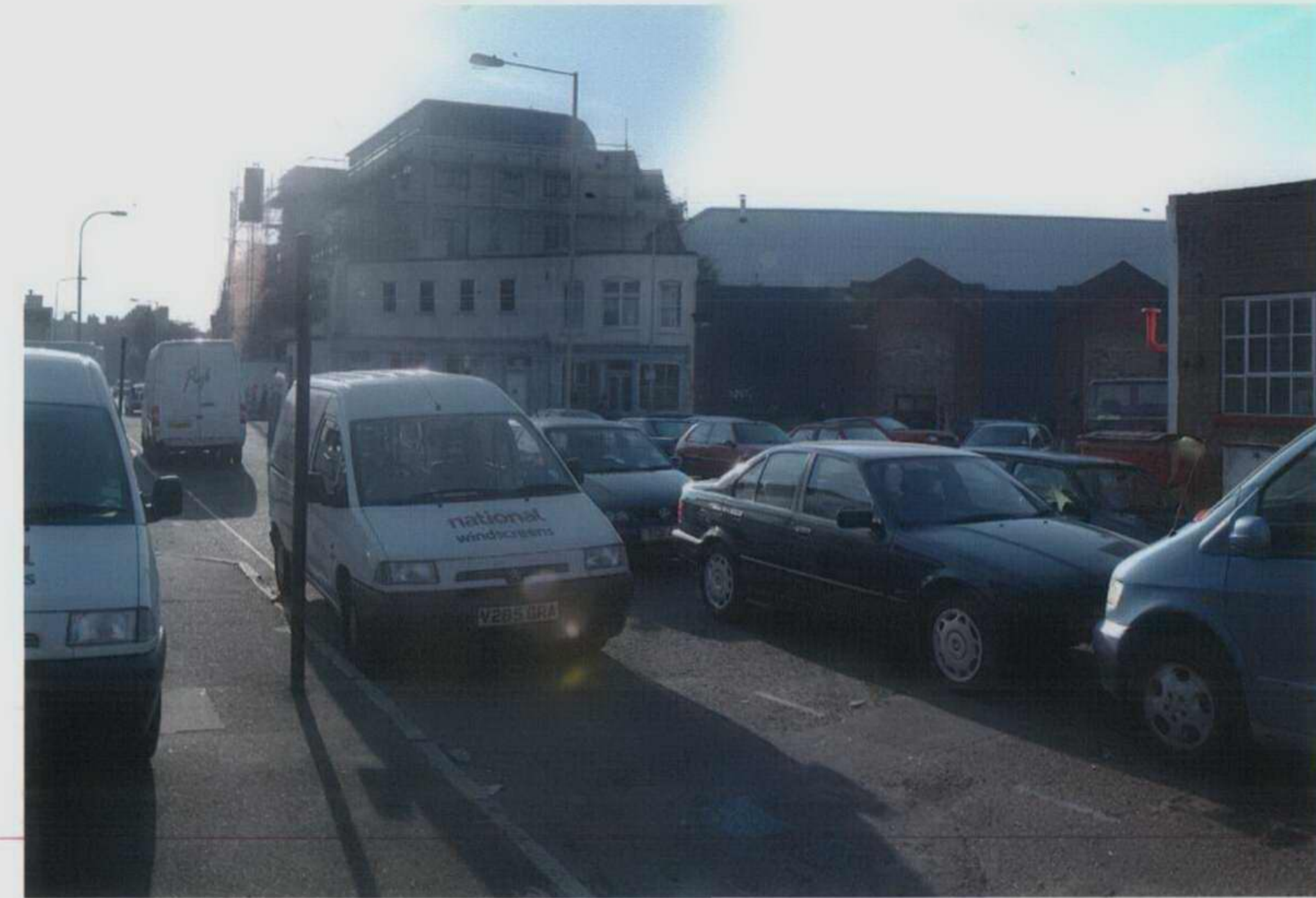
VIEW LOOKING SOUTH EAST -74A SITE ON THE RIGHT

PHOTO DRAWING NO. 810R 012 74A HOLMES ROAD : EXISTING CONTEXT PHOTOGRAPHS