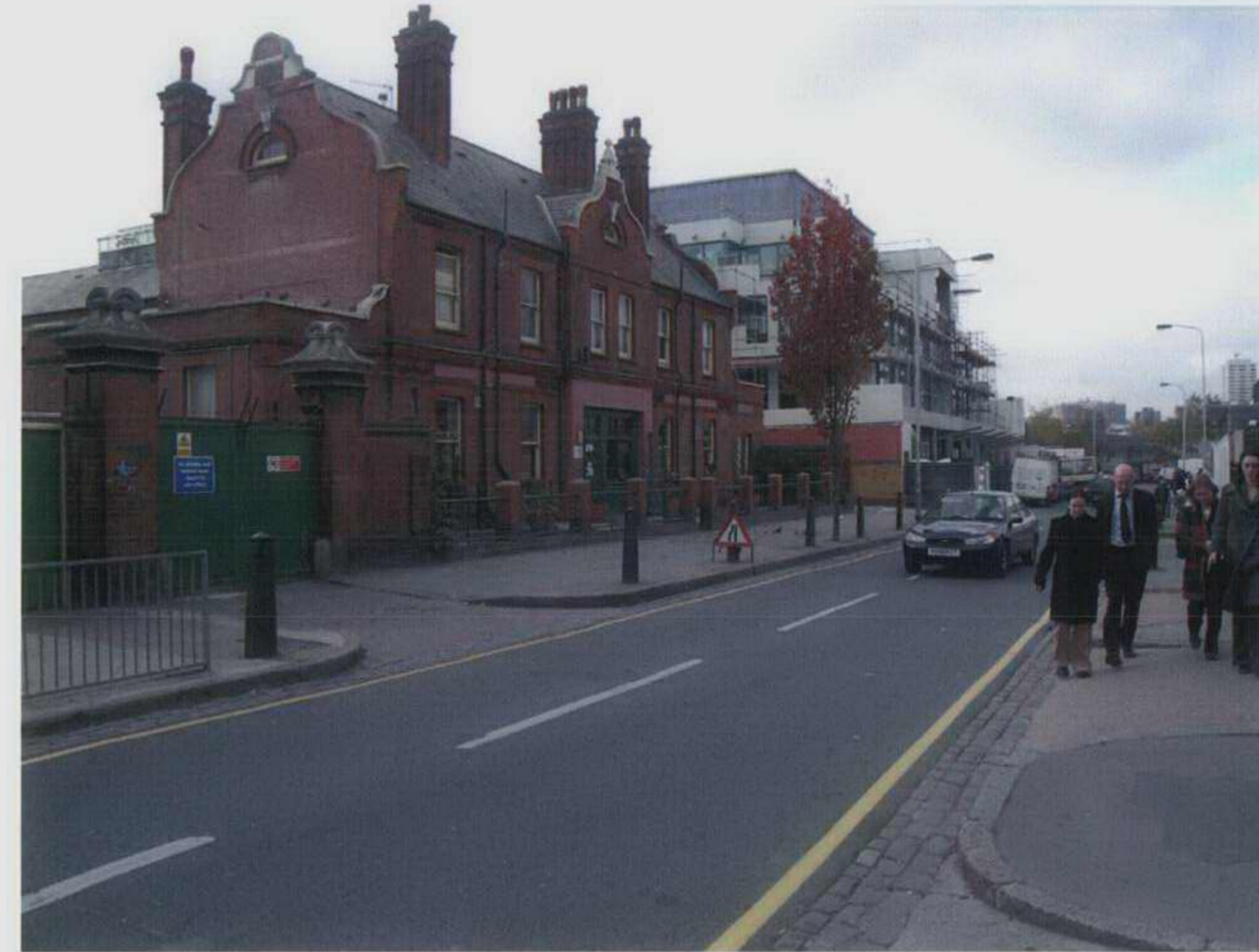
VIEW ALONG HOLMES RD LOOKING NORTH WEST