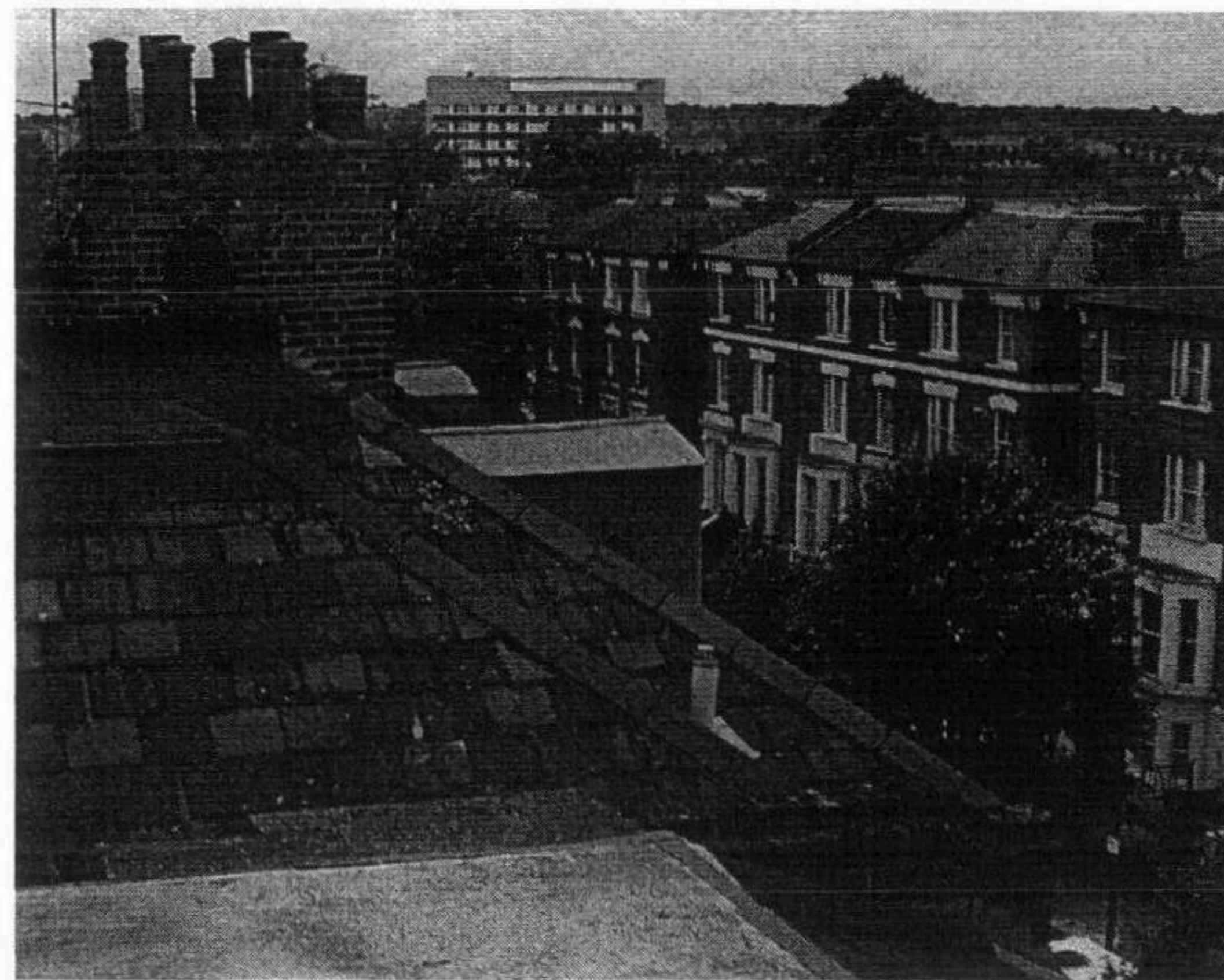
Front elevation dormers on top of Nos. 45 & 47