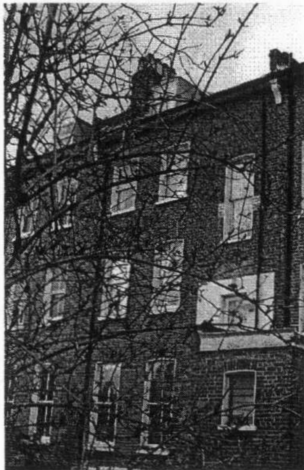
Rear elevation dormers on top of Nos. 45 & 47