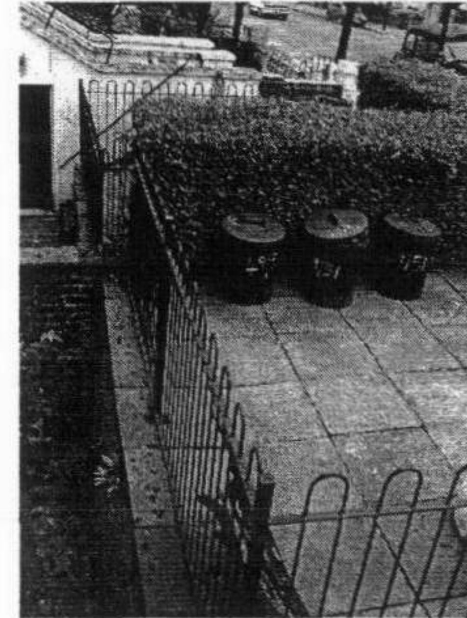
Front area railings to Nos. 49 & 51

AGATE SHORT ARCHITECTS 8 WATERSON STREET LONDON E2 8HL