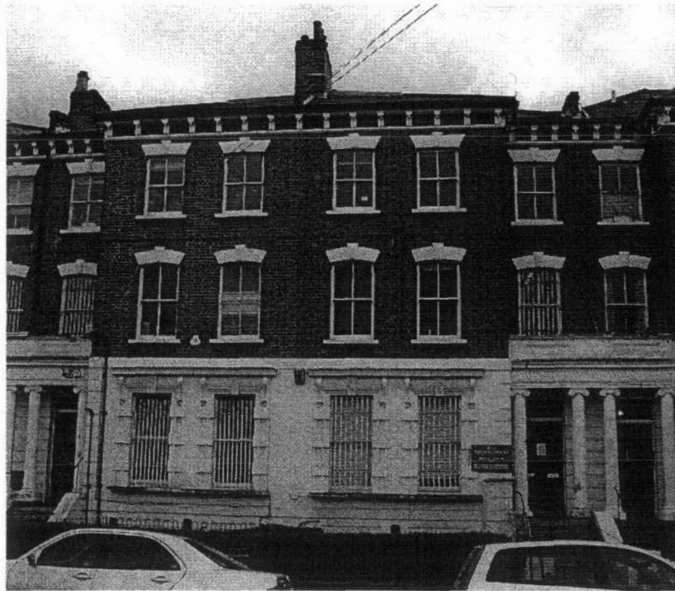
Front elevation to Nos. 49 & 51