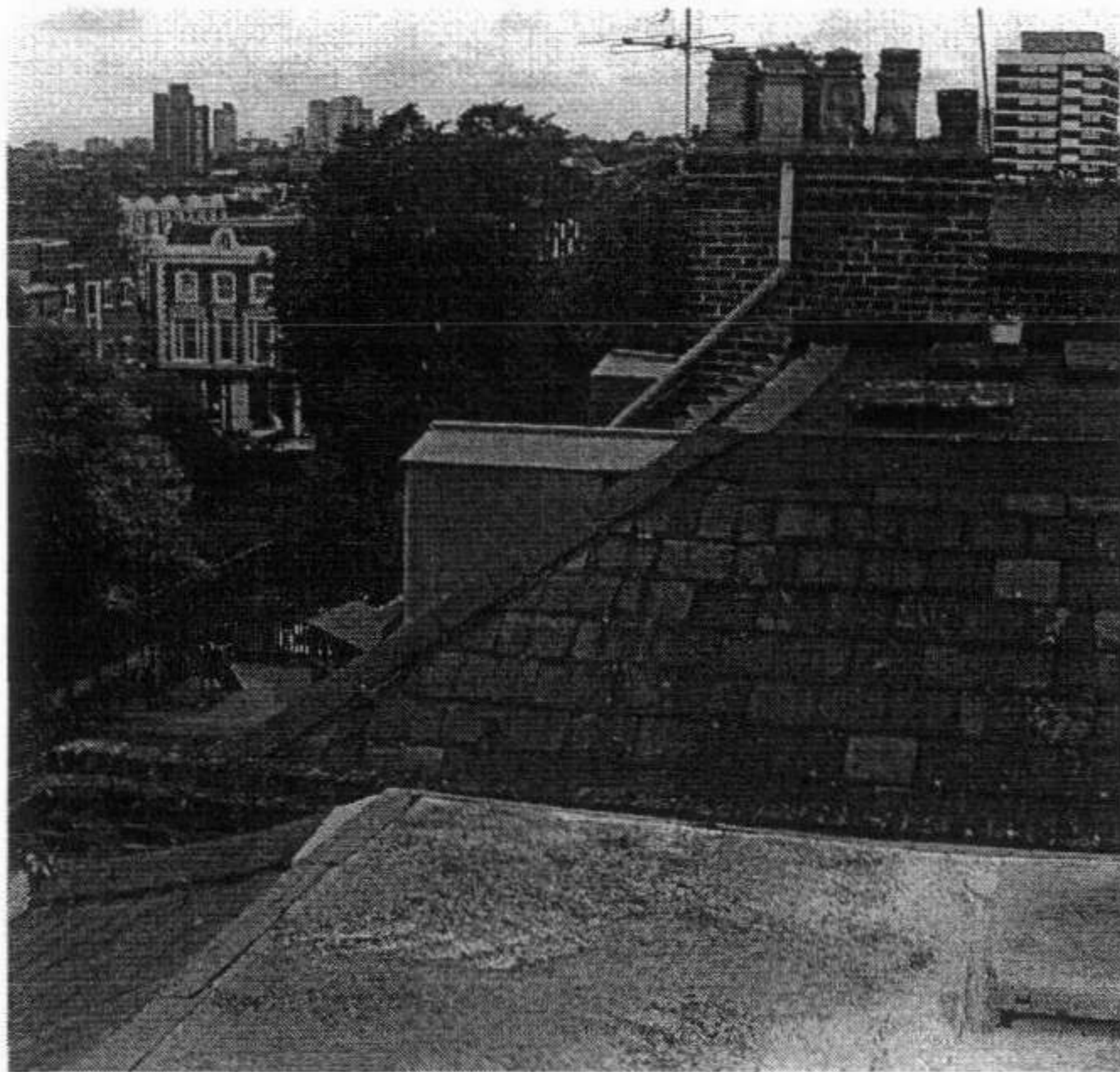
Rear elevation dormers on top of Nos. 45 & 47