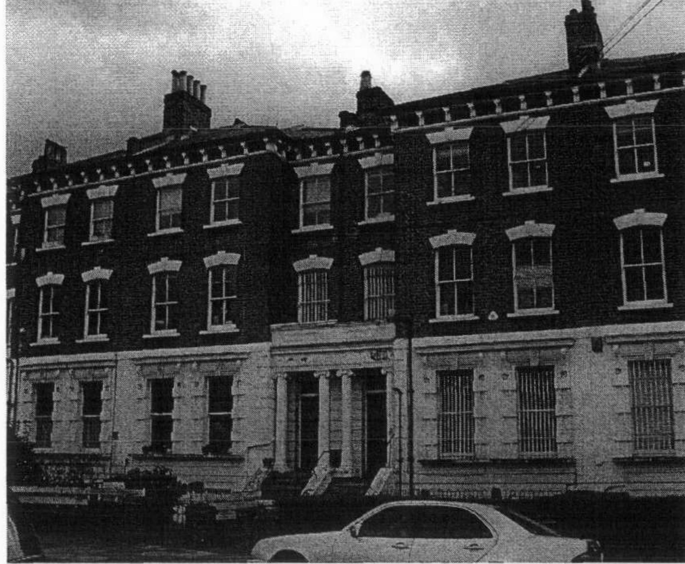
Front elevation to Nos. 51 & 53