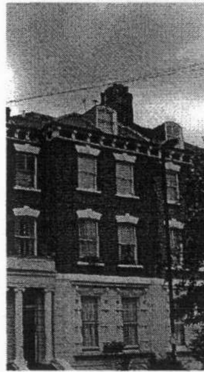
Front elevation to Nos. 45 & 47