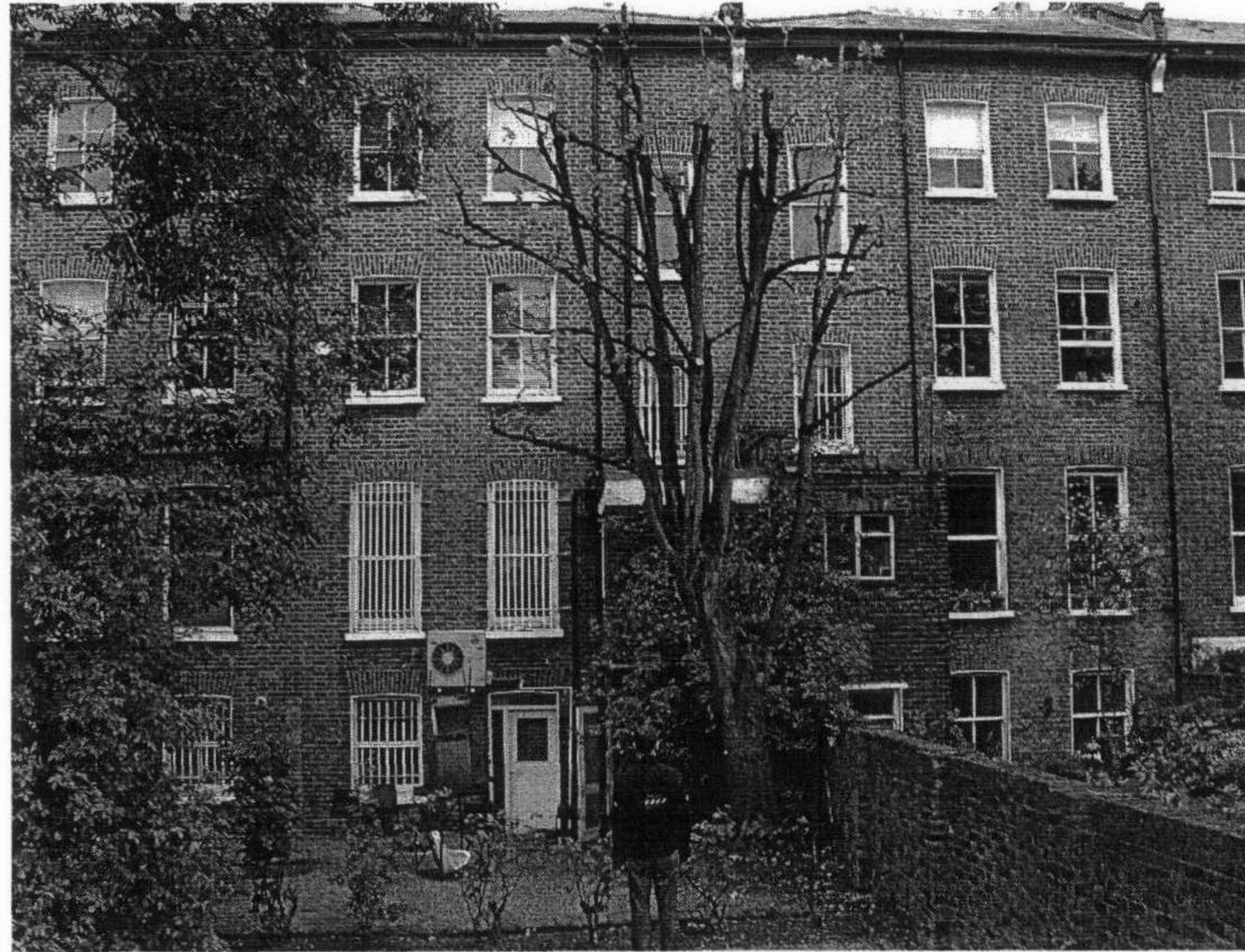
Rear elevation to Nos. 49 - 53