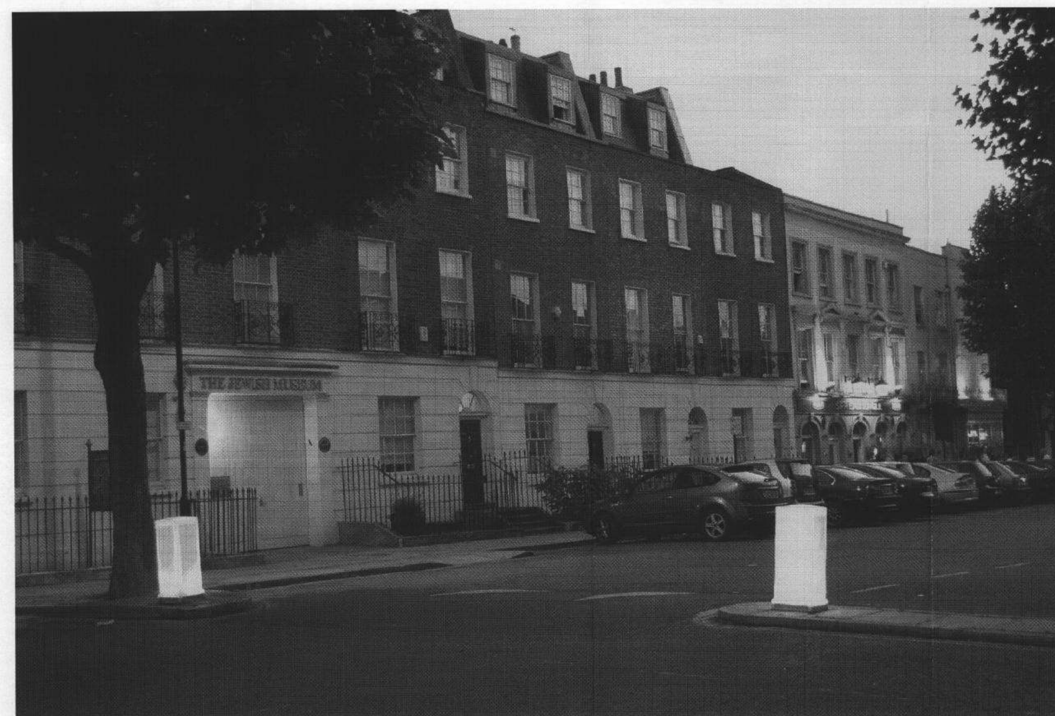
04 JM(01)03 VIEW 4: VIEW ALONG ALBERT STREET AT DUSK