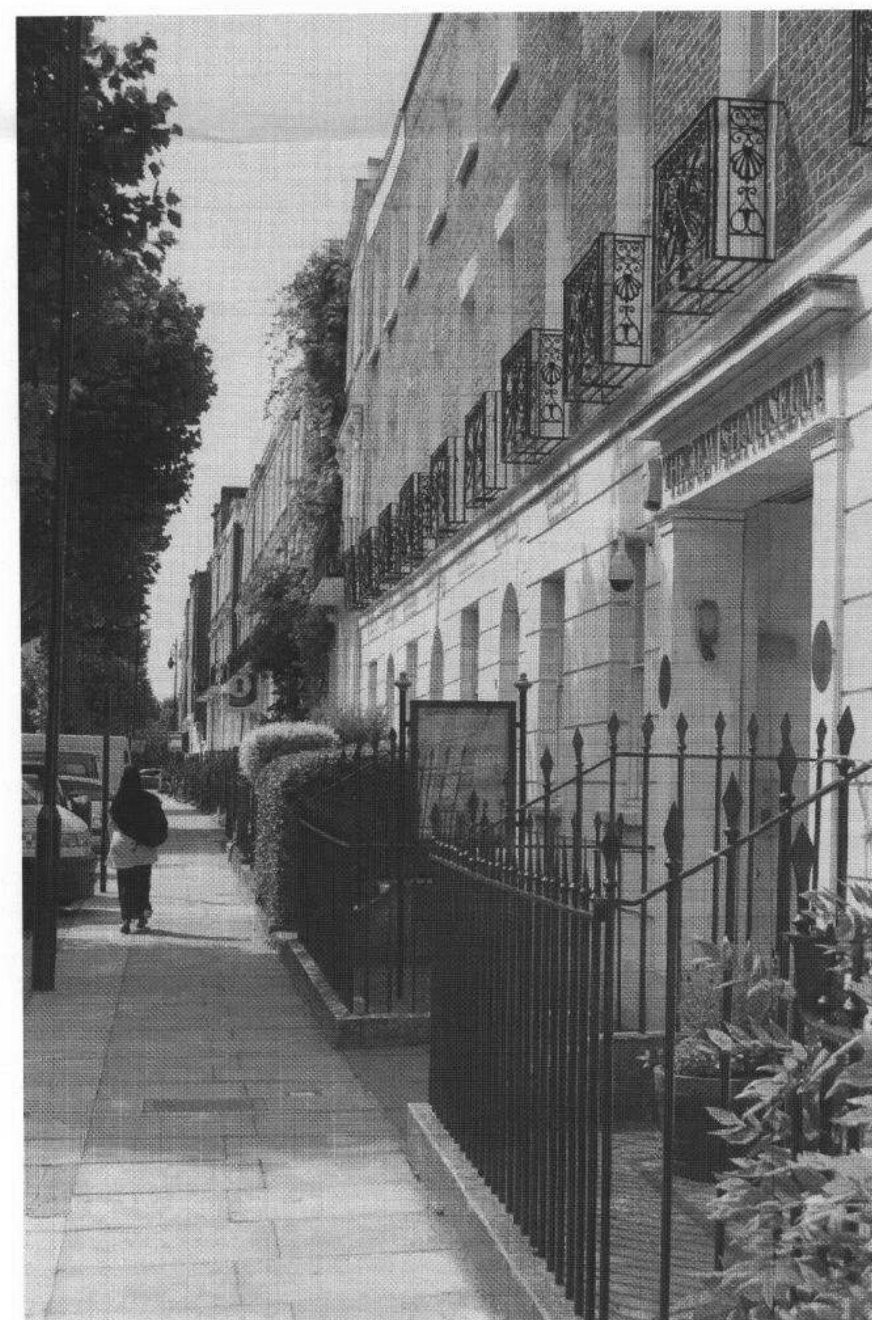
03 JM(01)03 VIEW 3: APPROACH TO ENTRANCE ALONG ALBERT STREET