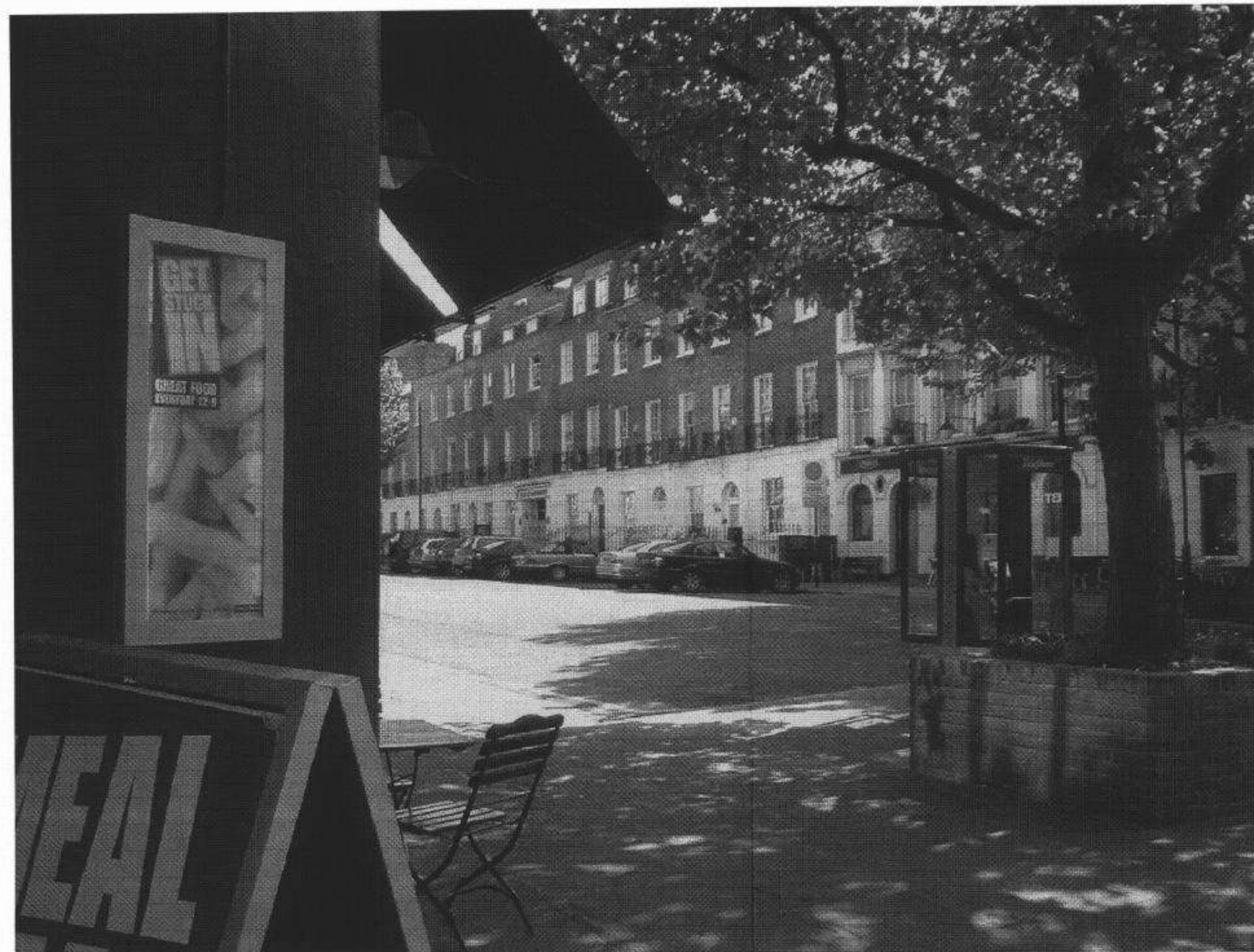
01 JM(01)03 VIEW 1: VIEW FROM PARKWAY CORNER TO ALBERT STREET