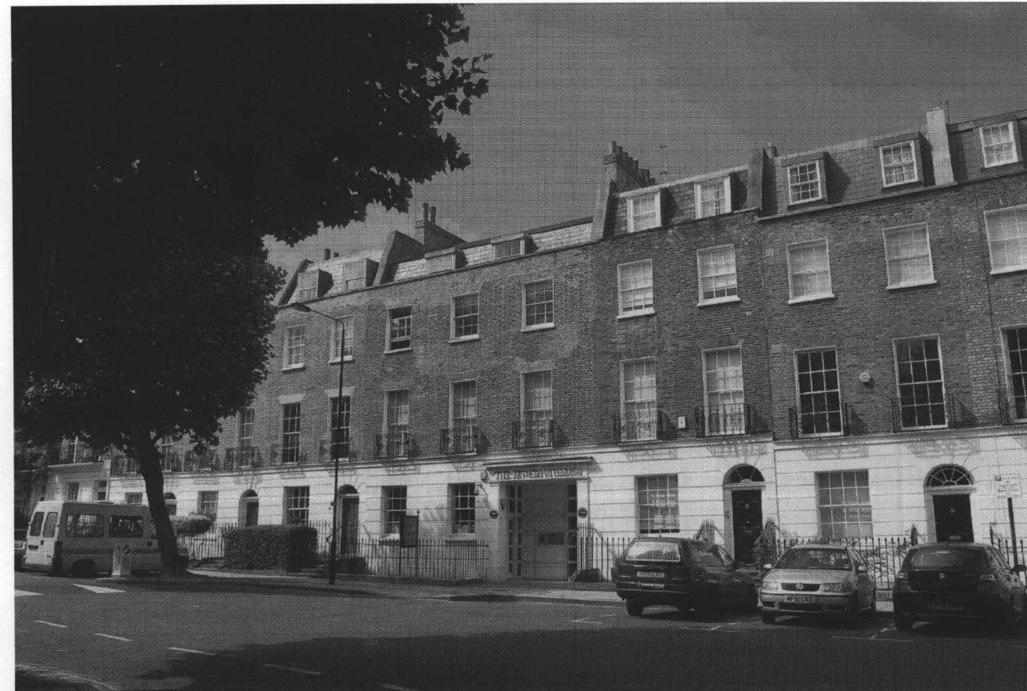
02 JM(01)03 VIEW 2: VIEW ACROSS ALBERT STREET