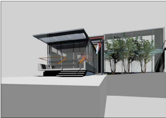
LOW LEVEL VIEW