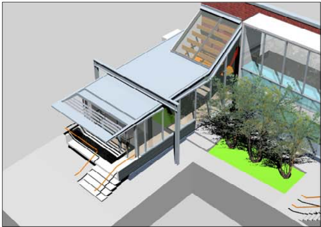
HIGH LEVEL VIEW