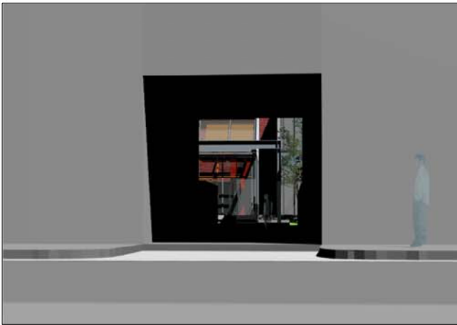
CHARLOTTE STREET VIEW