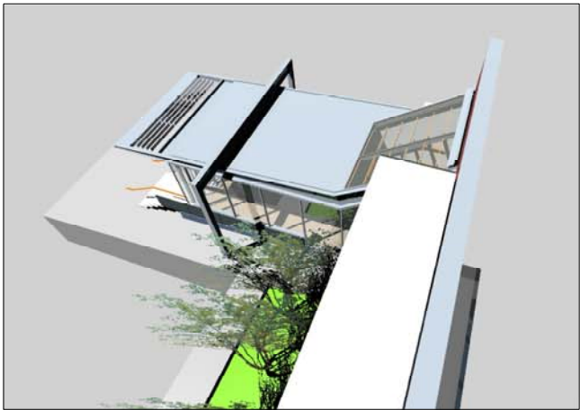
ROOF LEVEL VIEW