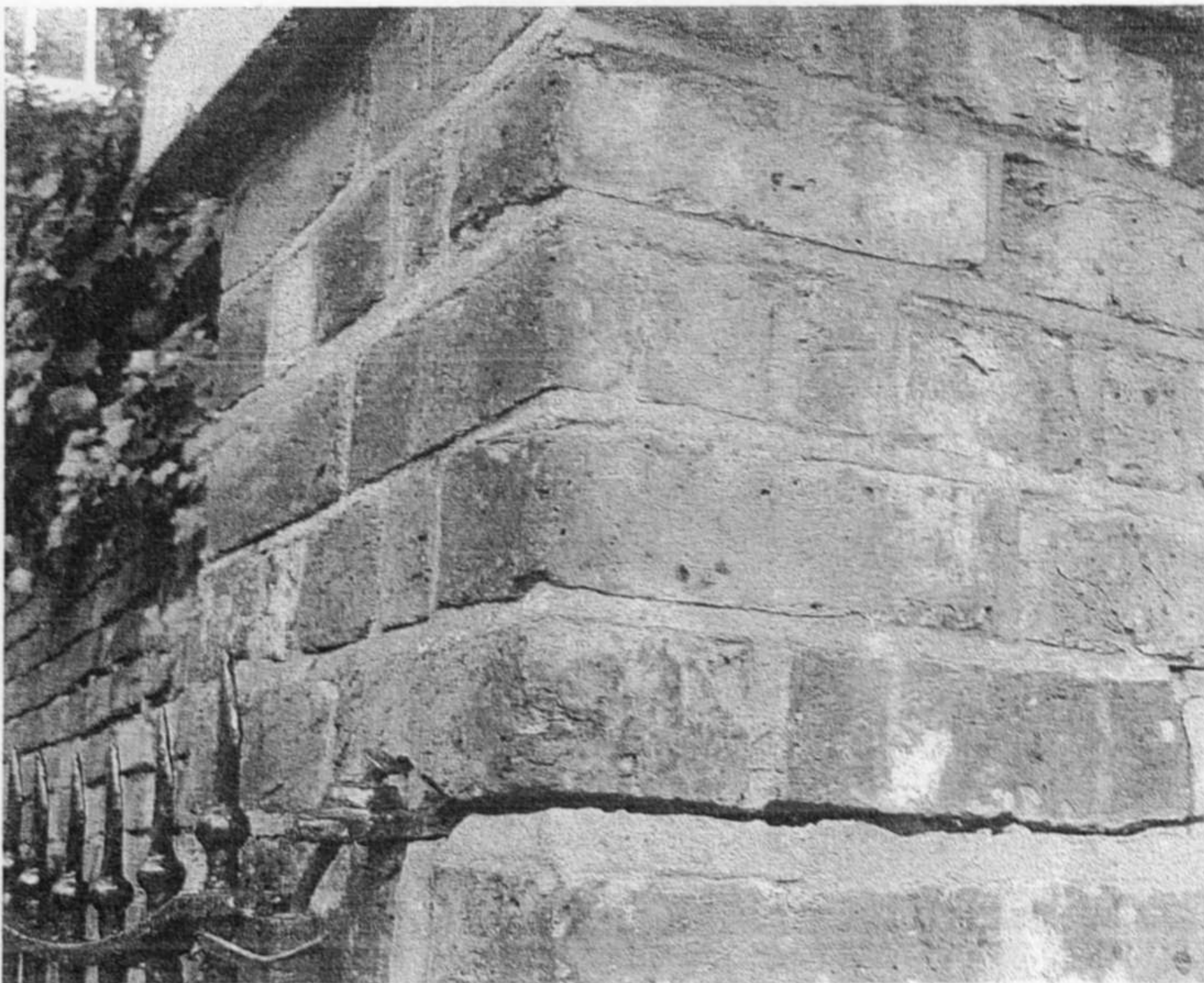
The wall is starting to cause the brick pier to also lean over.