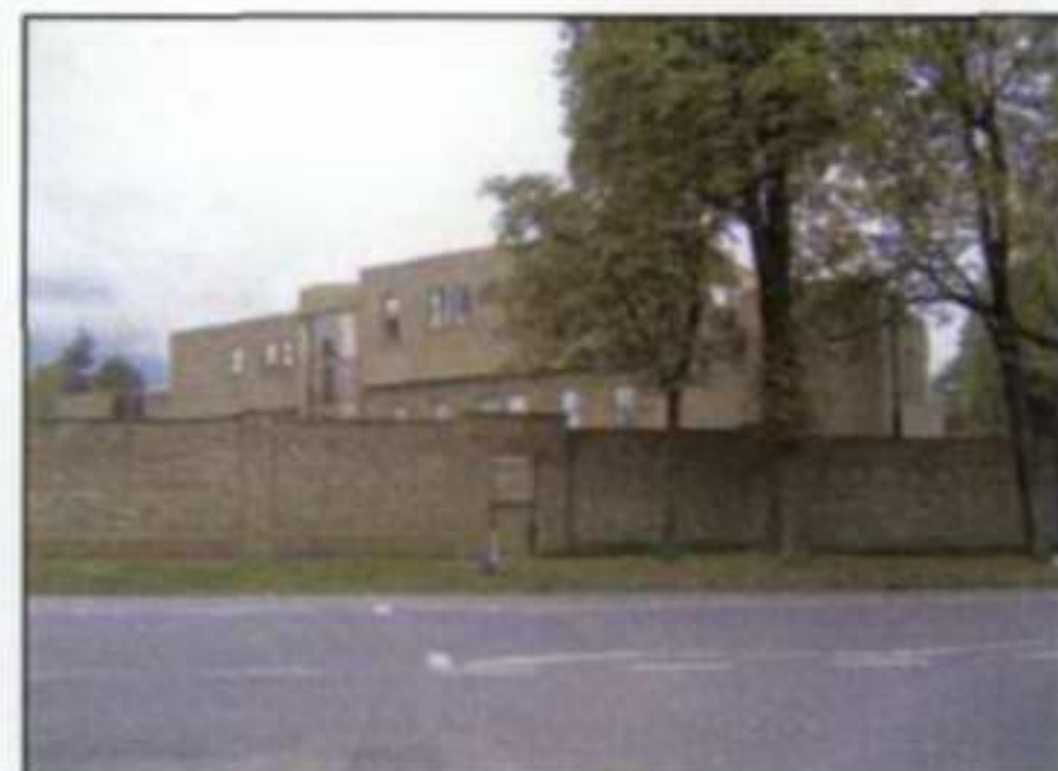
Existing site photo.