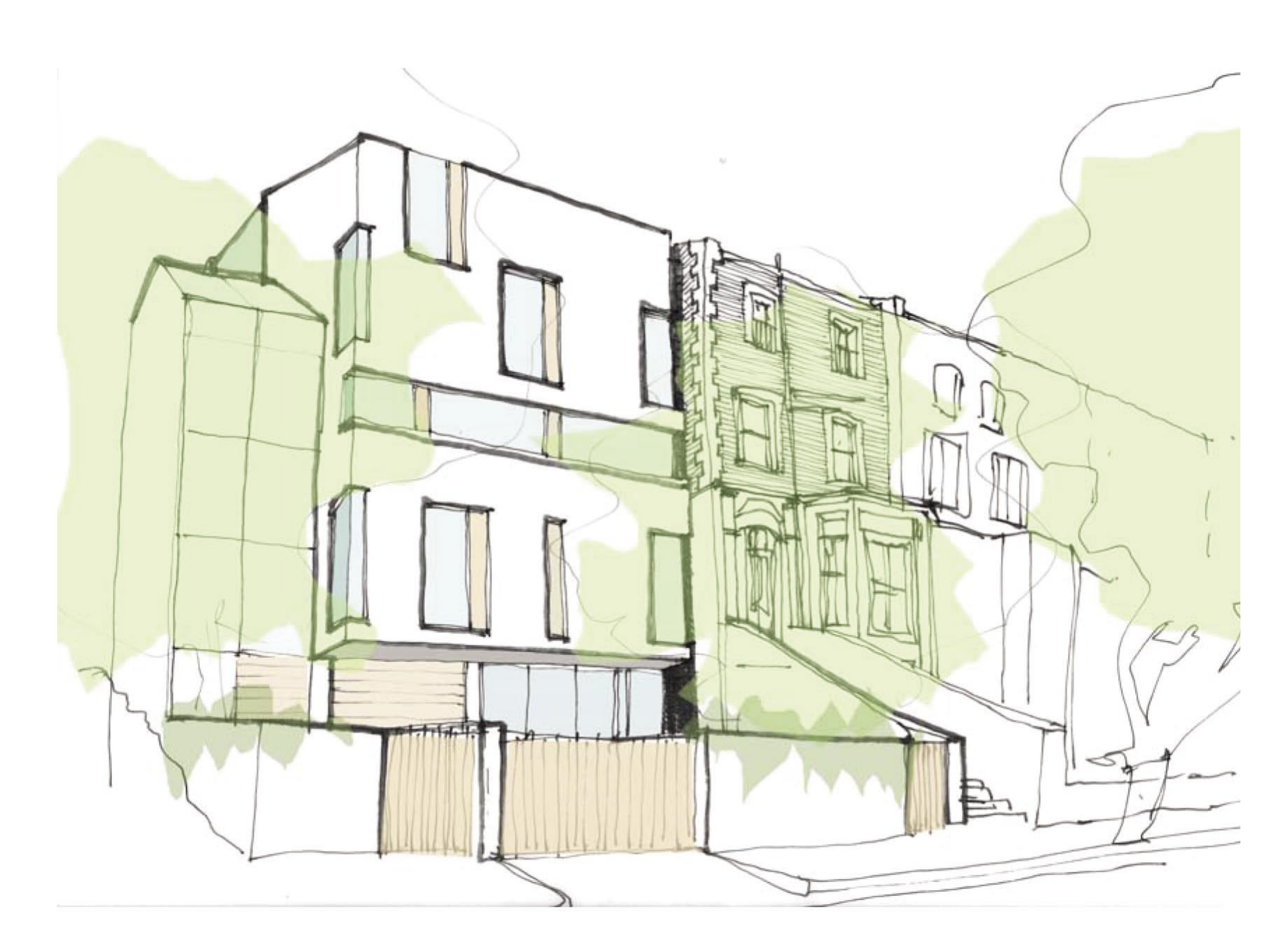
PROPOSED VIEW FROM STREET LEVEL