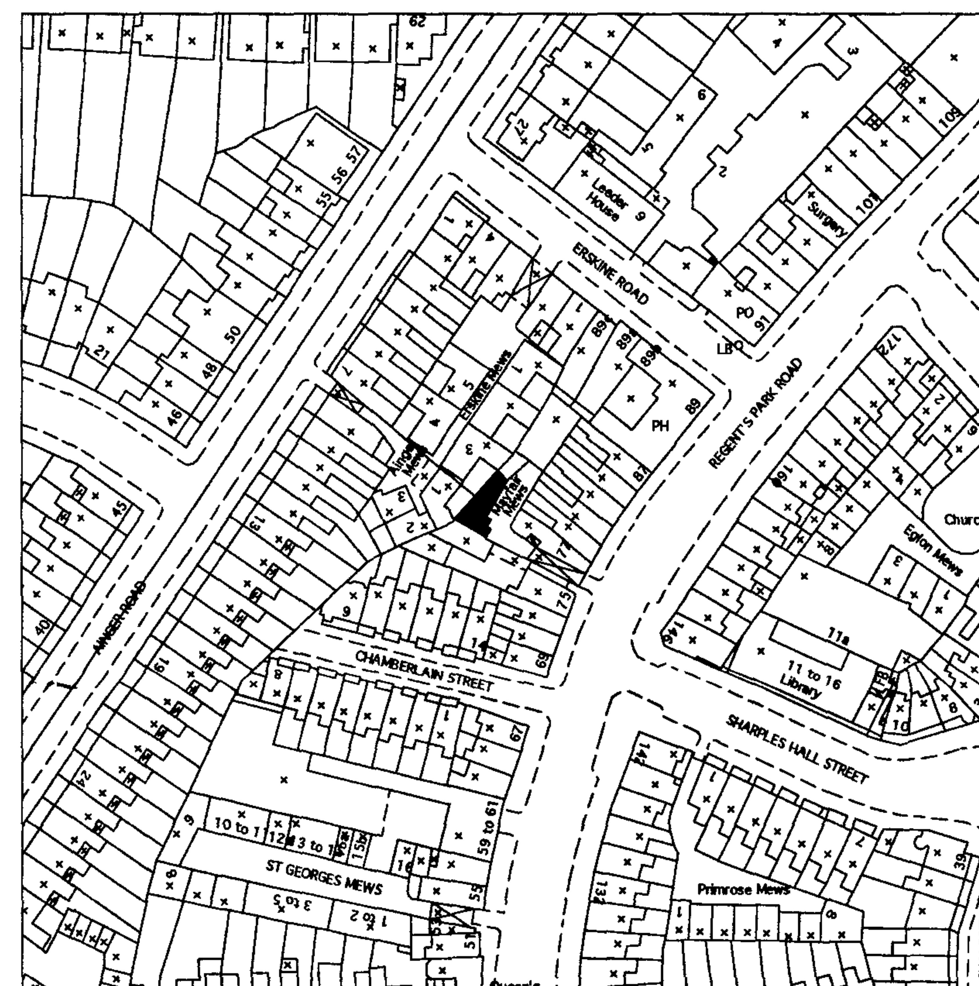
Existing Location Plan 1:1250