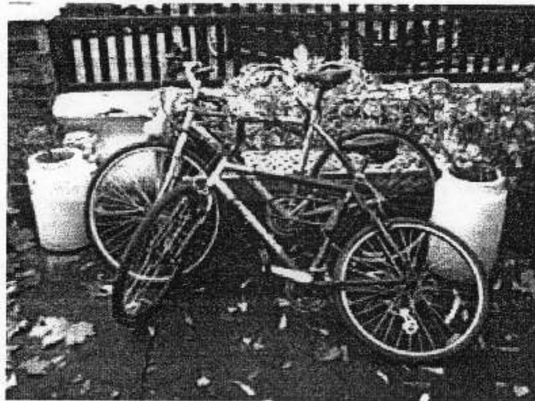
And our old storage method!

We thank you in advance for considering our application. If you need to correspond with us could you please email us, as we will be away from the 10 th of December till the 28 th of January.