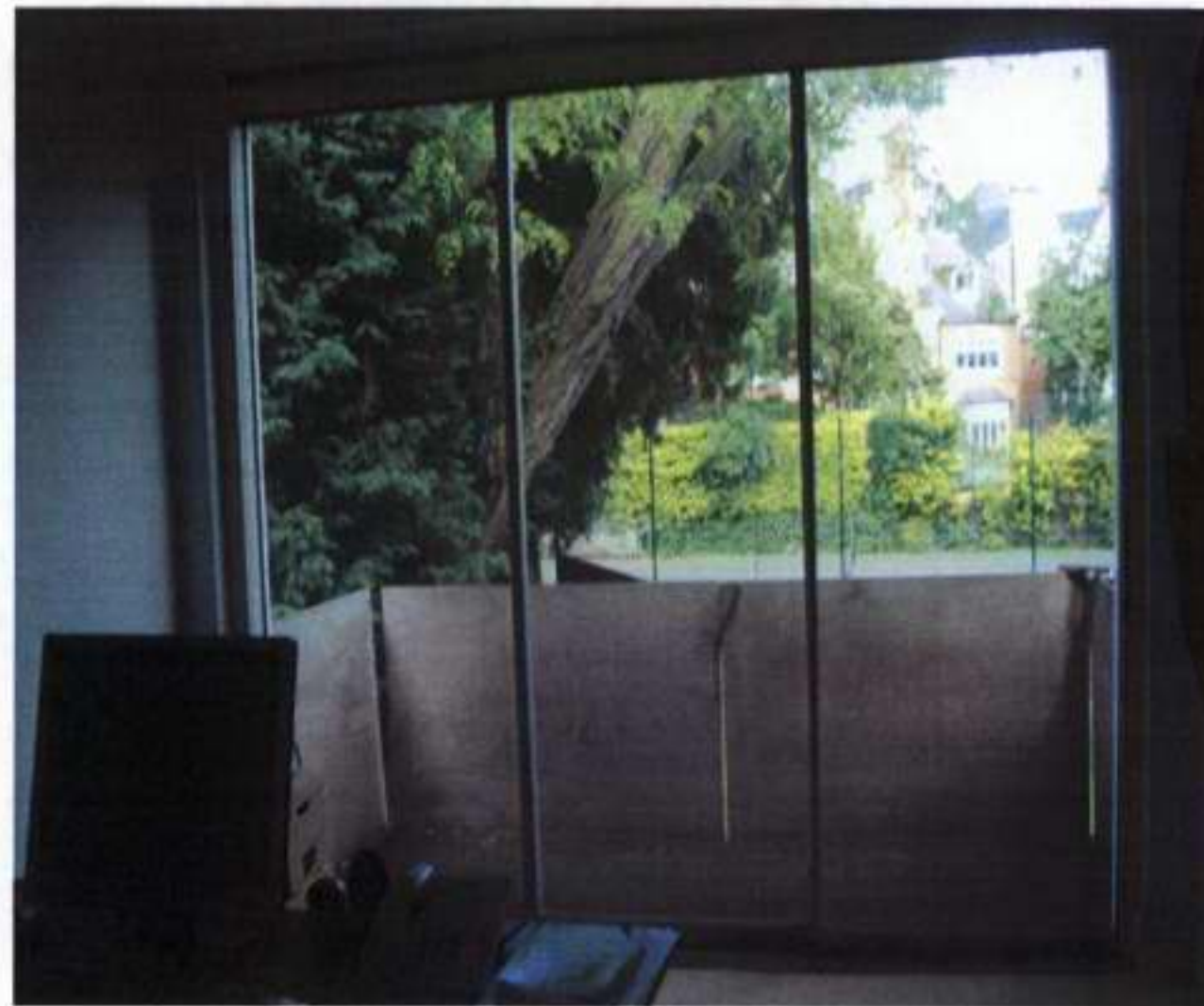
Existing balcony to ground floor