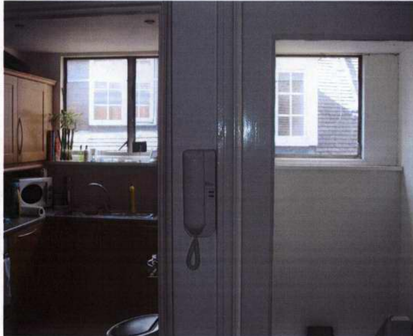
Second floor existing hallway and kitchen with existing Aluminum windows which are to be replaced