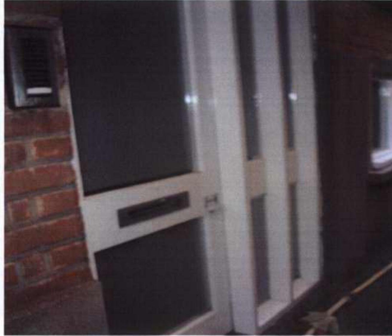
Existing door to staircase to second floor