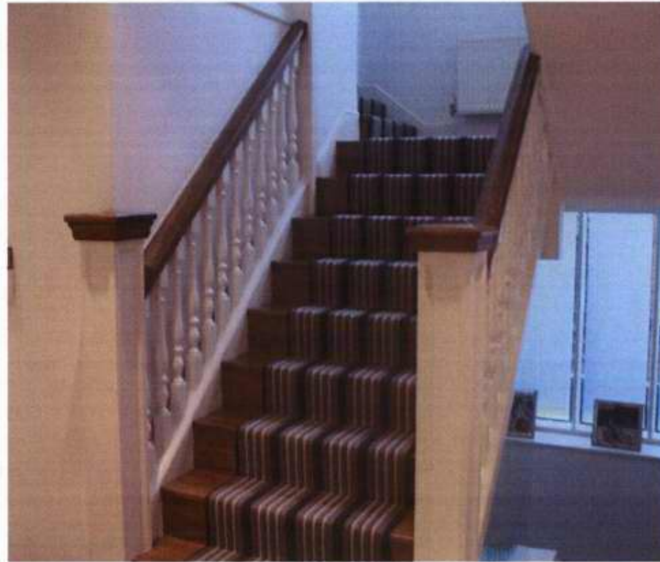
Existing staircase from ground floor to first floor