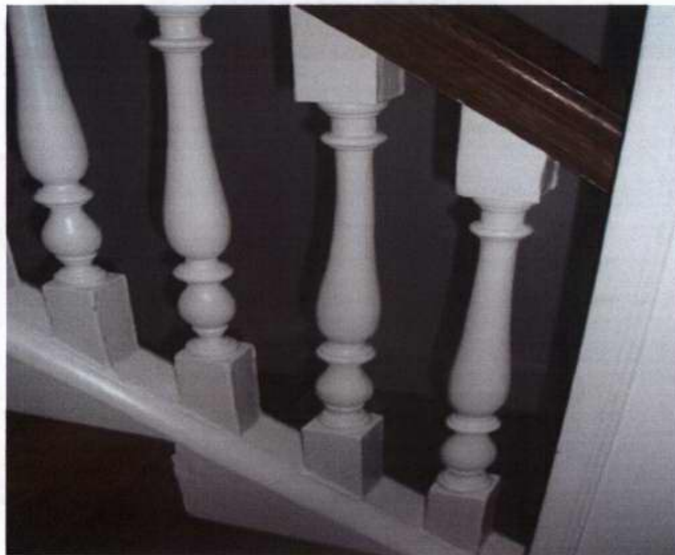
Existing balustrade and handrail