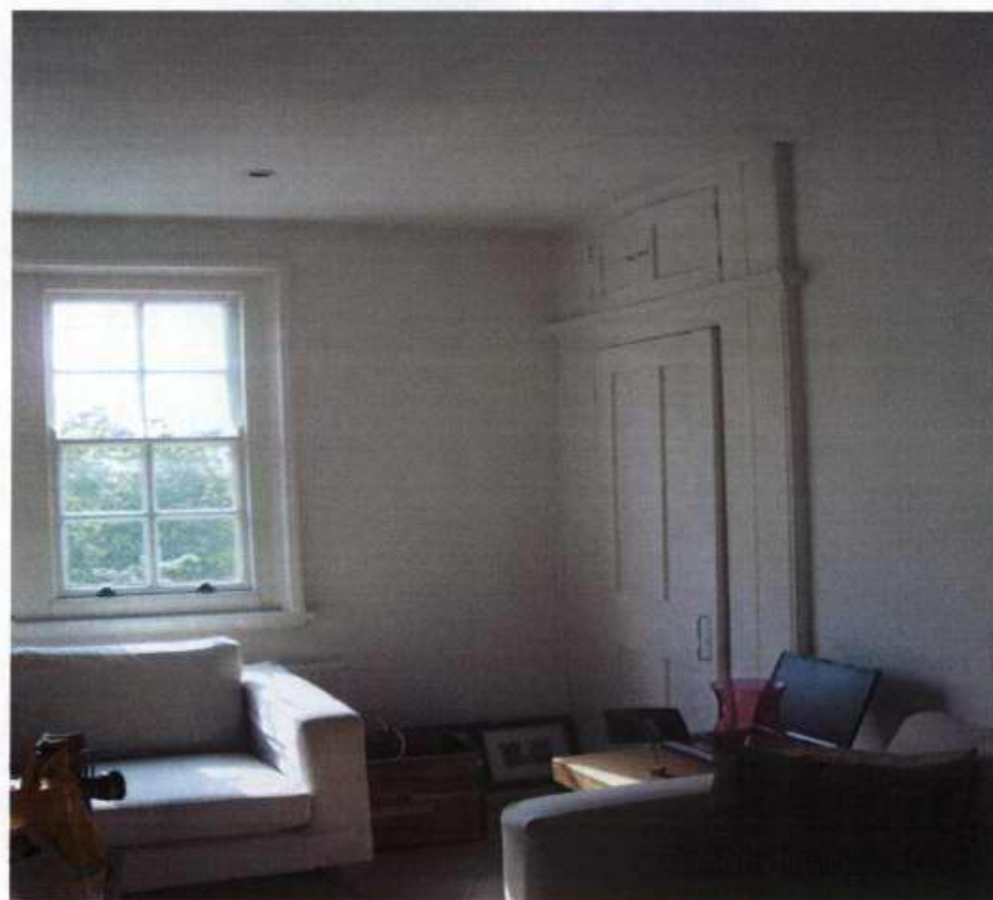
Second floor existing timber framed sash window to front elevation