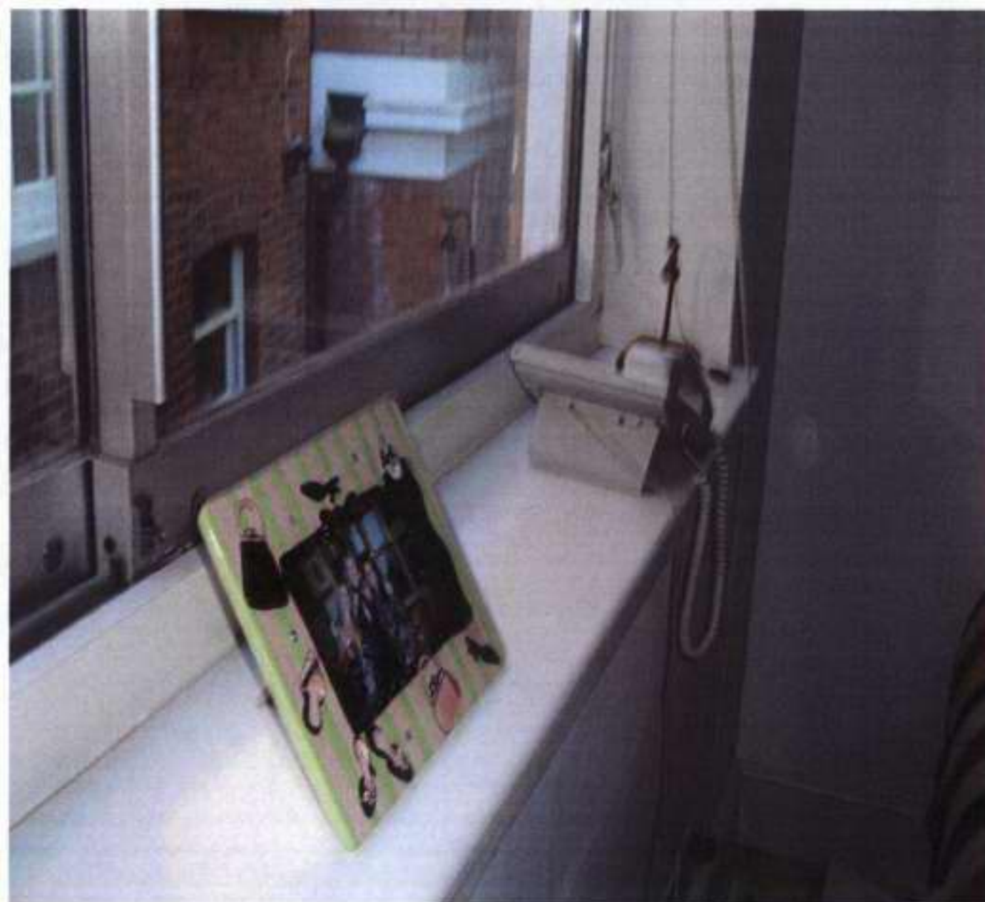
Existing aluminum window to TV room