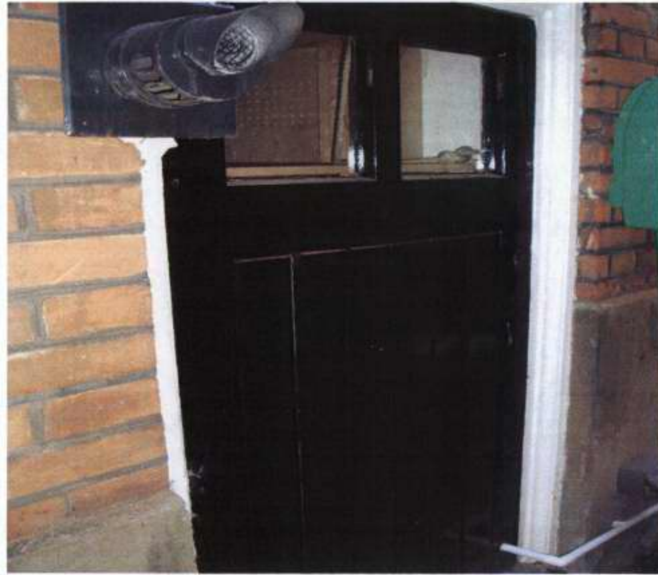
Existing side door