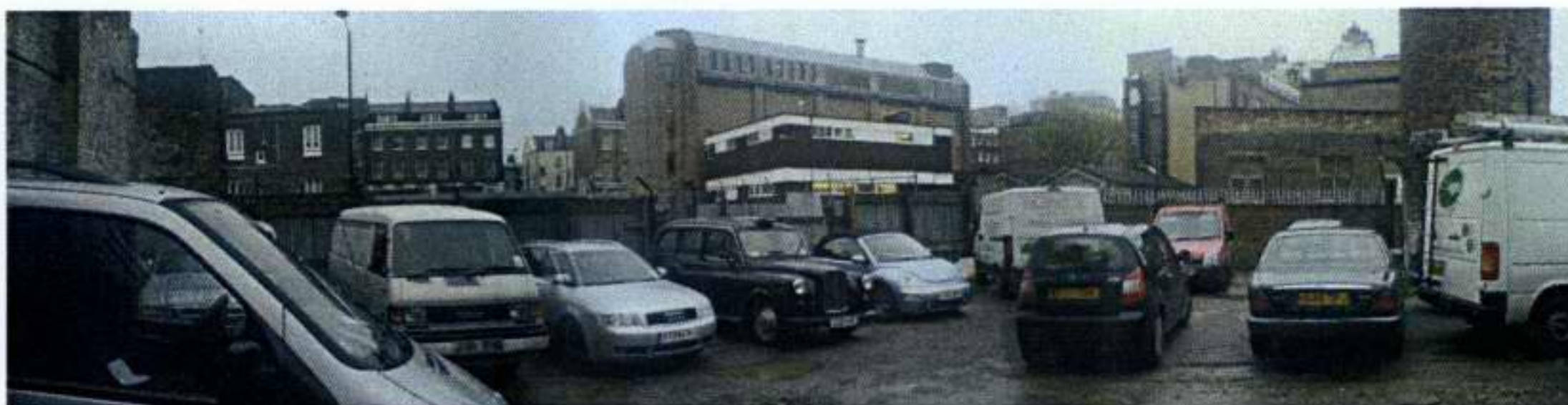
Figure 2: Panoramic View of Car Park site looking towards rail cutting corner with Wicklow St