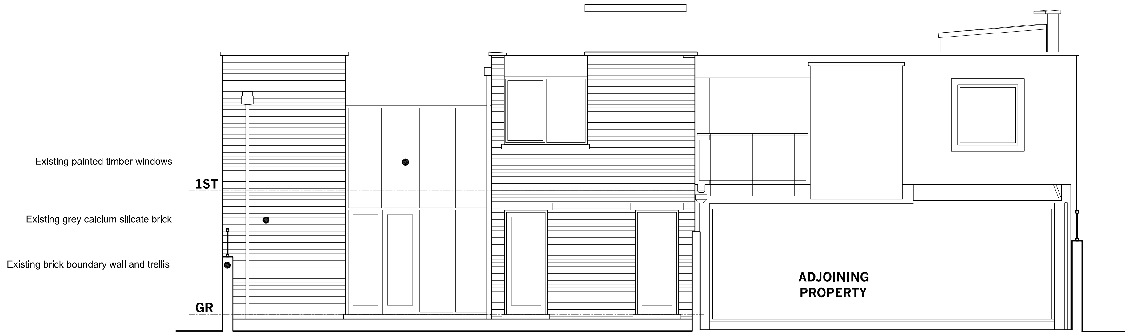
EXISTING SOUTH ELEVATION (REAR)

REV 0: 03/03/06 WHL * Issued for Planning