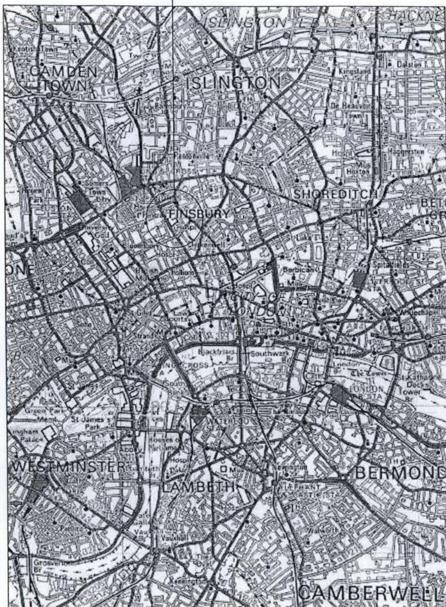
SITE LOCATION PLAN (SCALE 1:50000)

From A1 turn onto A502, continue onto A598. At roundabout take the first exit onto A502, bear right onto A400 & bear right onto A5202. Bear left onto B504, turn left onto Tavistock Place. Turn into Regent Square, Sidmouth Street & turn right onto A5200. Arrive at destination