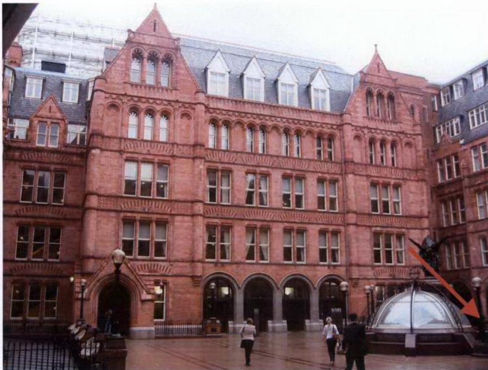
Courtyard of 138-142 Holborn Bars, also known as "Waterhouse Square"

Part of application for listed building consent for ground and lower ground floor of No 1 Waterhouse Sq, Holborn Bars