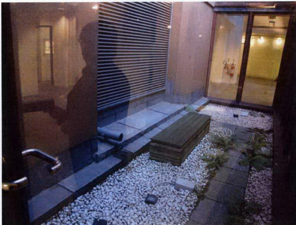
Light well from lower ground floor level; to be redecorated with bamboo plants in planter boxes with a metal screen attached to the back to shield rendered wall and louvres

Part of application for listed building consent for ground and lower ground floor of No 1 Waterhouse Sq, Holborn Bars