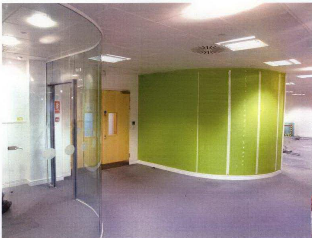
Coloured partitions to be removed