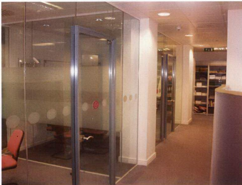
Glazed partitions as present; to be removed or replaced with glazed partitions to RBS group standard

Part of application for listed building consent for ground and lower ground floor of No 1 Waterhouse Sq, Holborn Bars