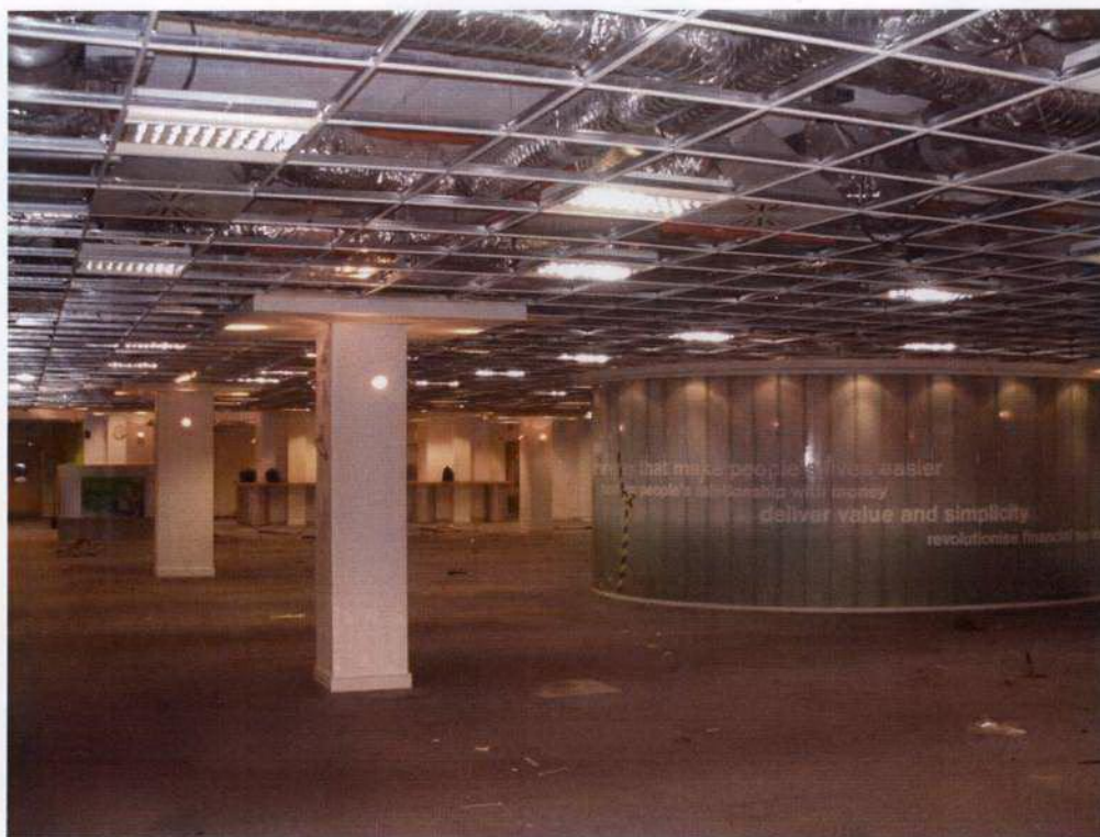
Lower ground floor as present; Suspended ceiling, feature element and carpet to be replaced, redecorated