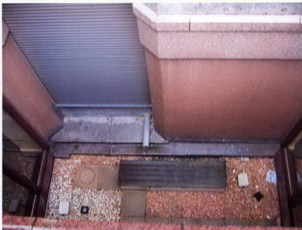
Light well situation looking down from Waterhouse Square