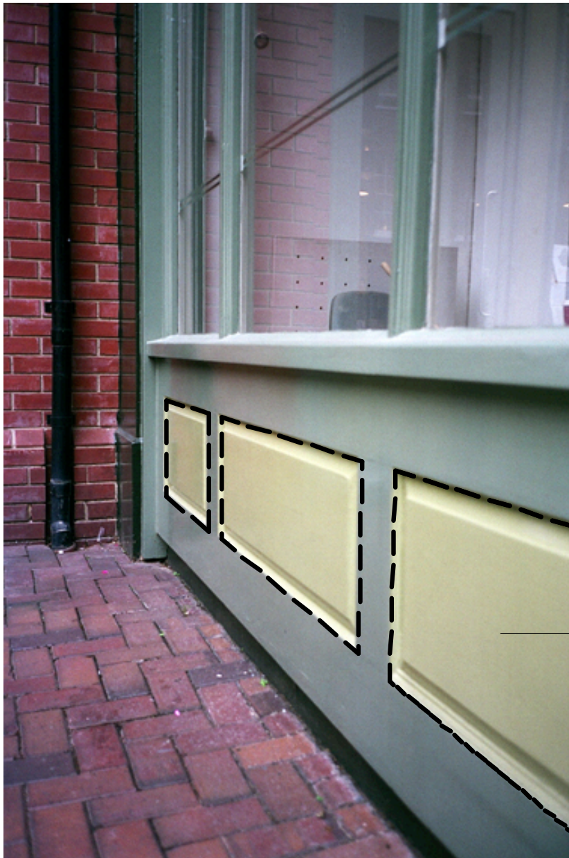
DETAILS No.16 BURY PLACE AREA OF PROPOSED ALTERATION TO FACADE

EXISTING PANELS BELOW CILL HEIGHT TO BE REPLACED WITH 3no. LOUVRED GRILLES, DESIGN TO MATCH EXISTING LOUVRES AT 16 BURY PLACE.