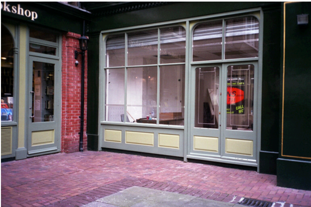
EXTERIOR No.16 BURY PLACE EXISTING PANELLING BELOW CILL HEIGHT TO HAVE LOUVRES AS ABOVE