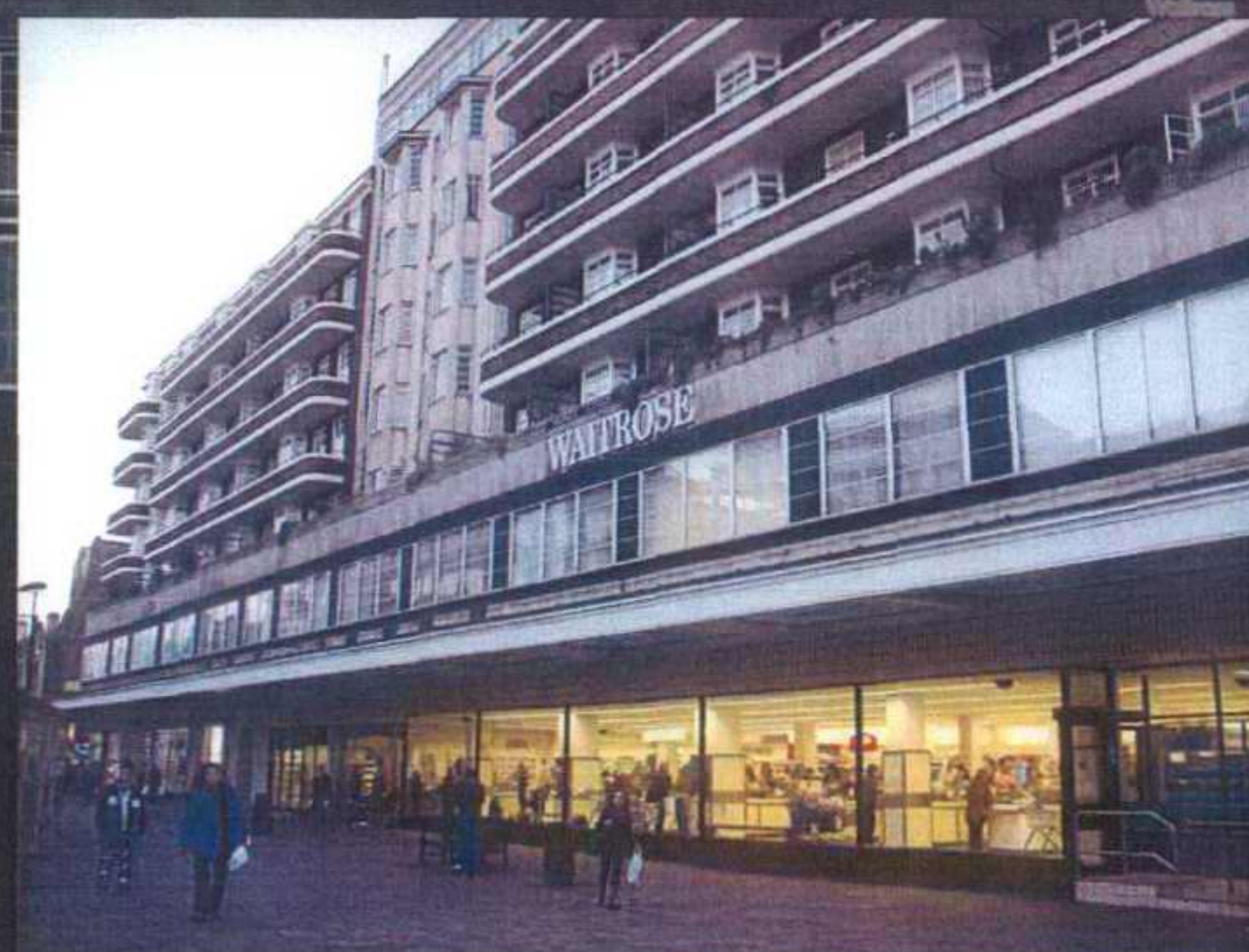
4. New signage and window treatment to ease the relation of store to the existing listed building