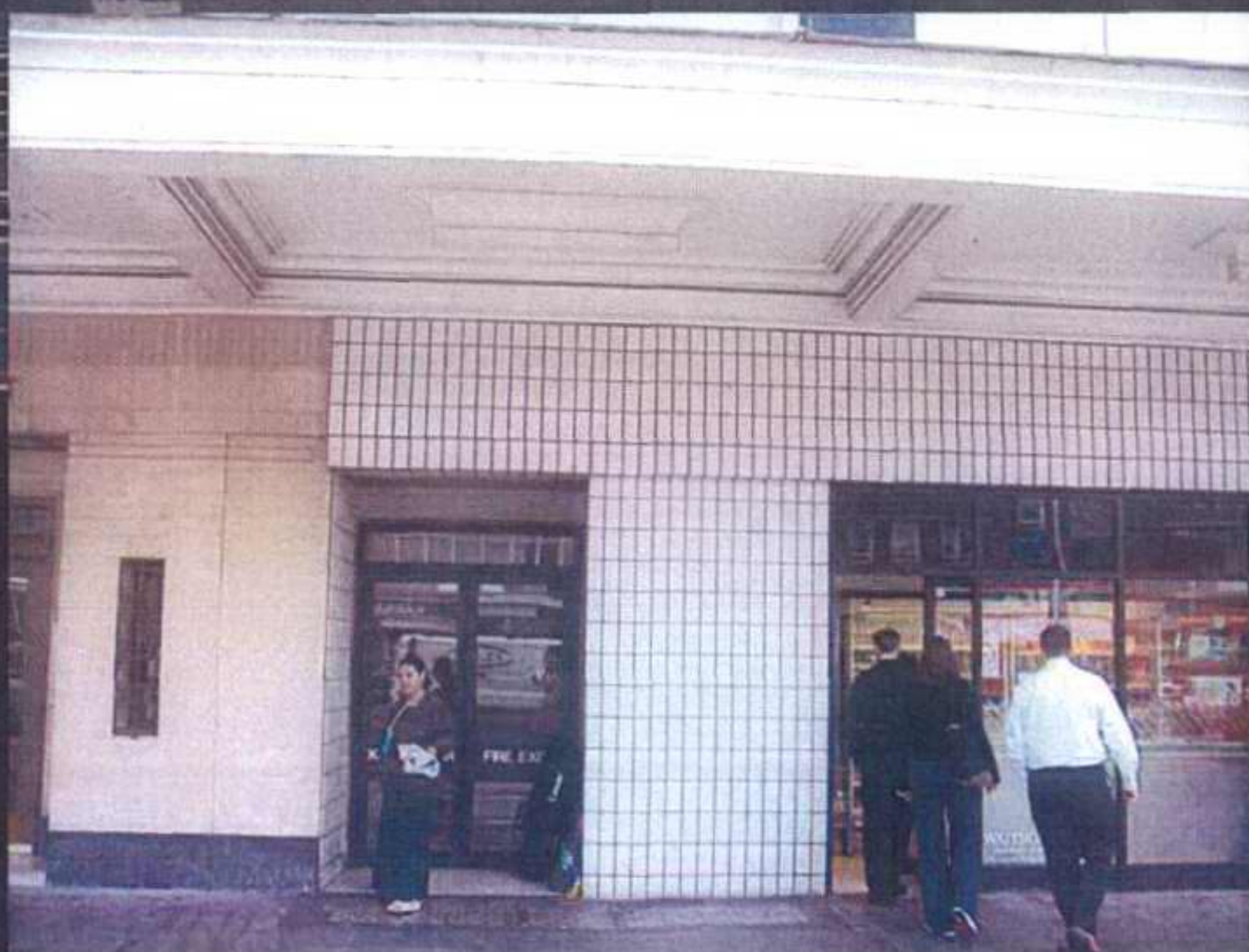
3. Existing tiles to be replaced to match existing stone