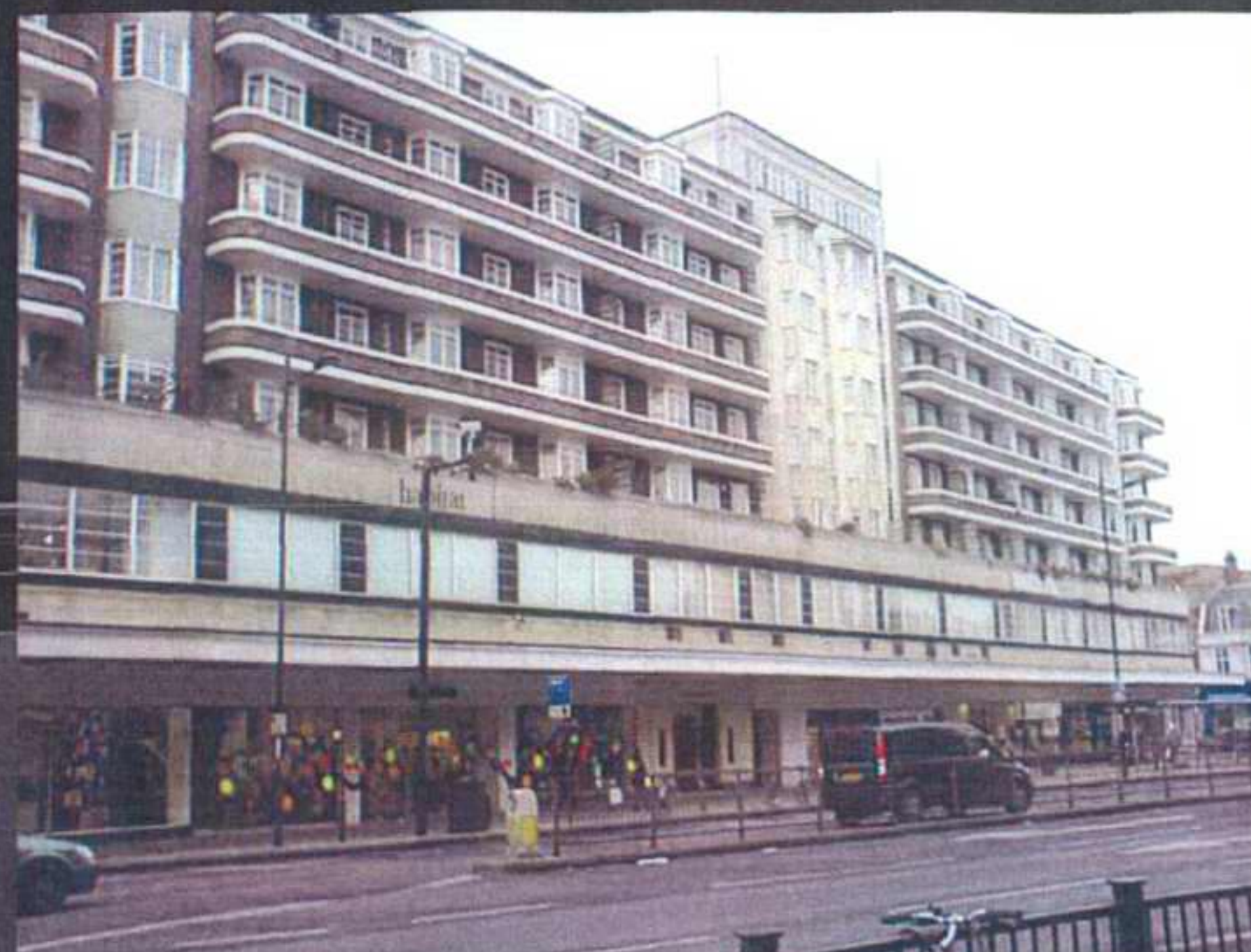
2. Proposed shopfront to provide a more vibrant landscape street level