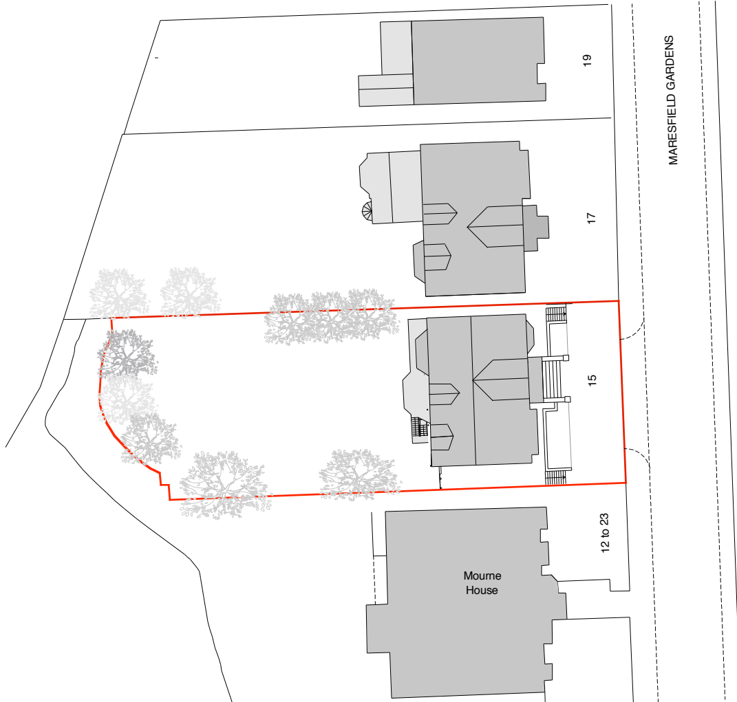
1 EXISTING SITE PLAN w/ rear balcony 1:400