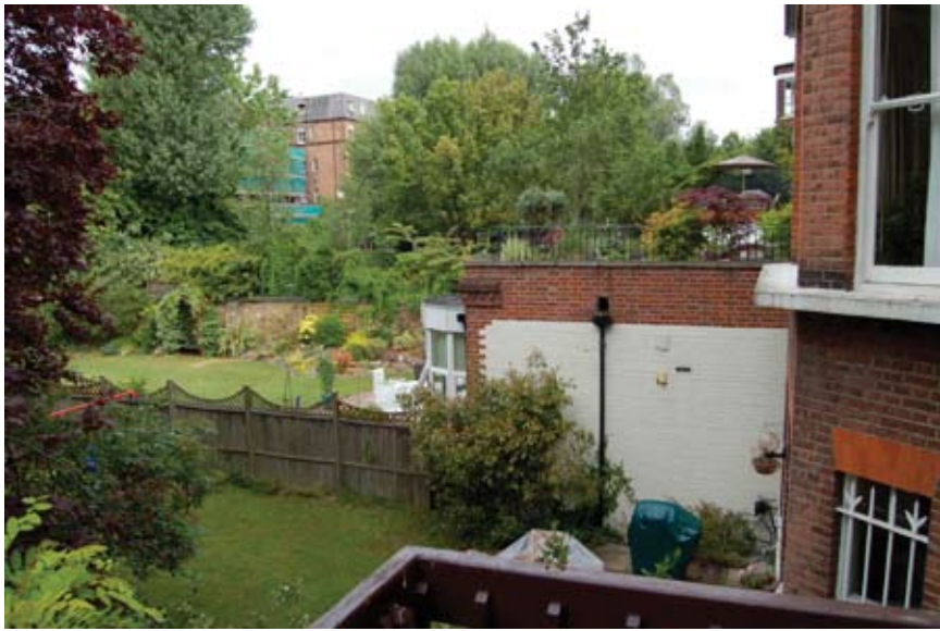
6 View from Existing Balcony Toward 17 Maresfield Gardens