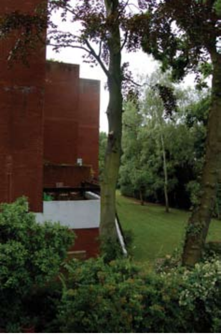
2 View Towards Mourn House