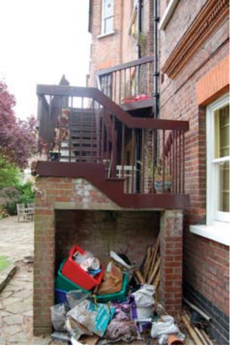
4 View of Existing Stairwell/Balcony