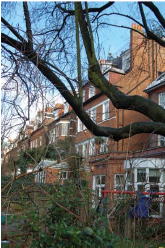
9 View showing extensions to no 17 & 19 Maresfield Gardens