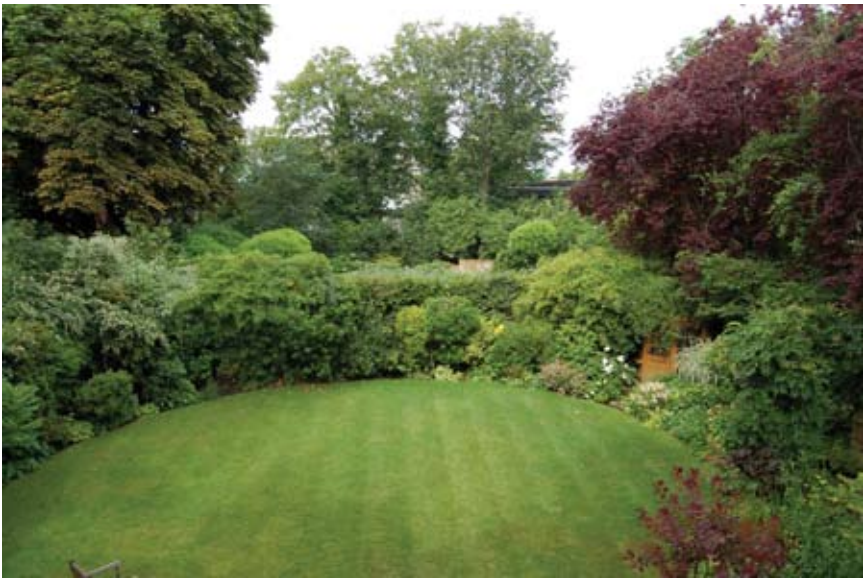
5 View From Existing Balcony