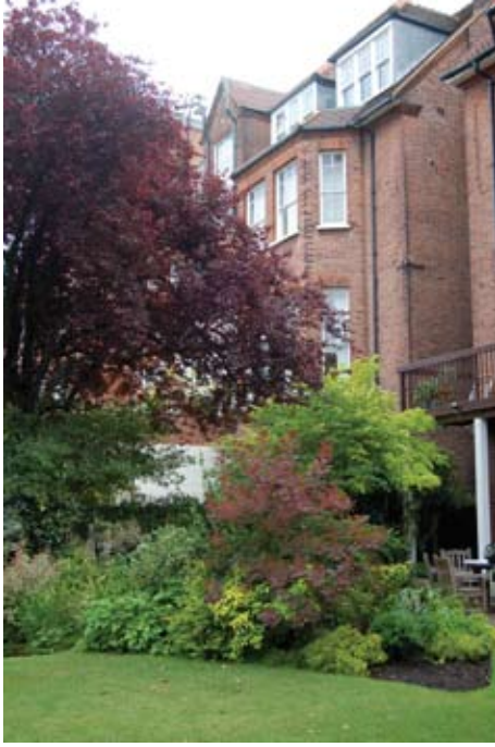
2 View Toward 17 Maresfield Gardens