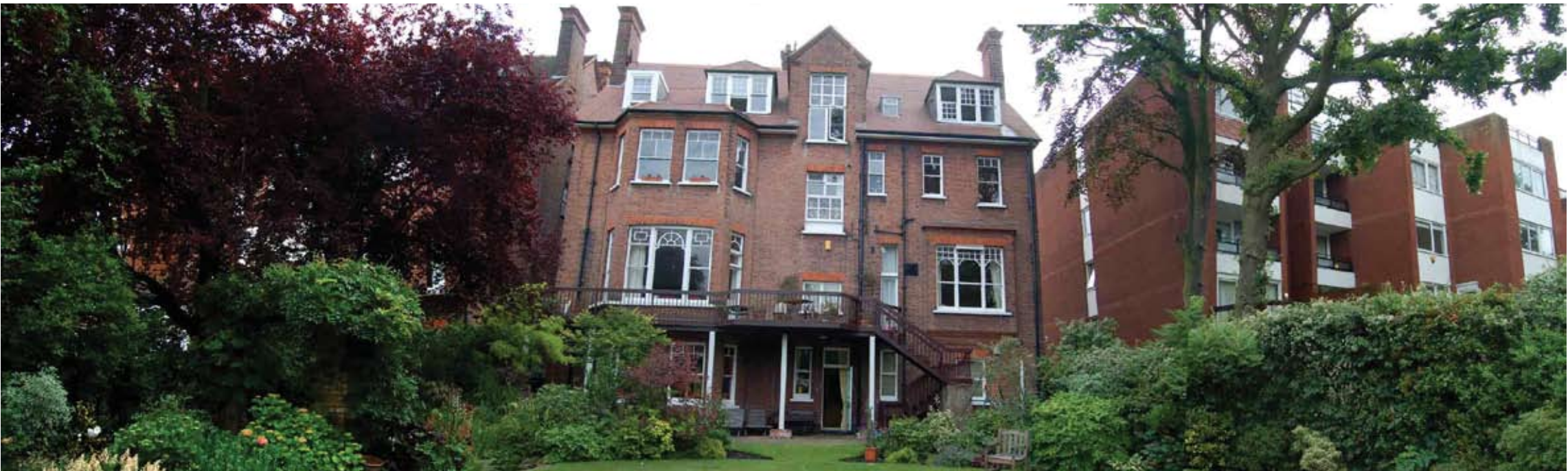
17 Maresfield Gardens