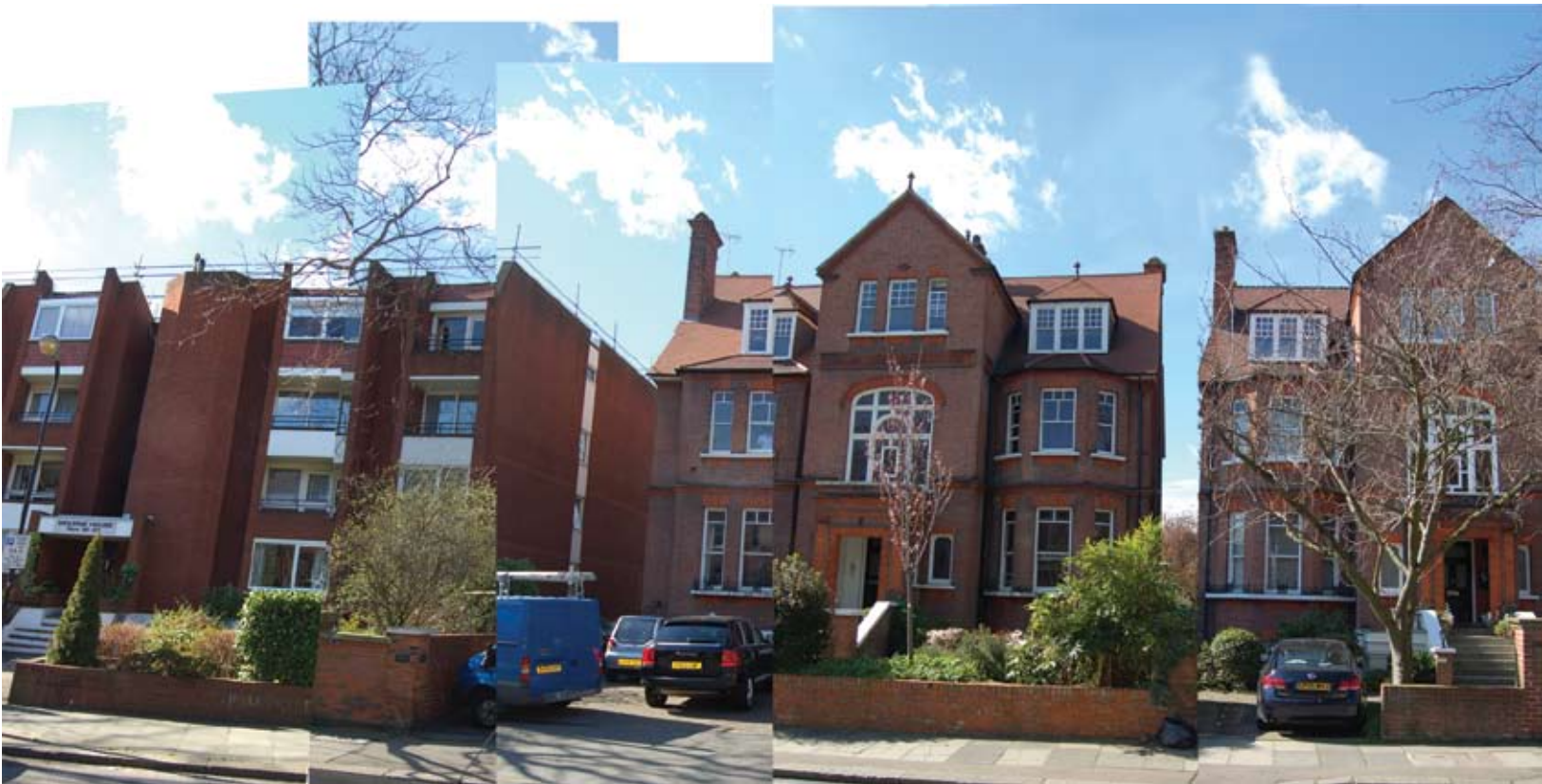
7 Mourn House