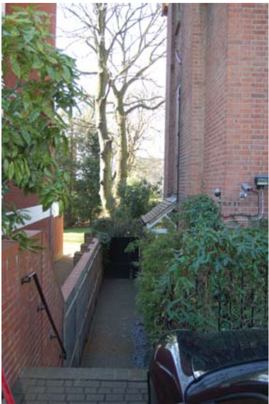
8 View from front patio between no 15a and Mourn House