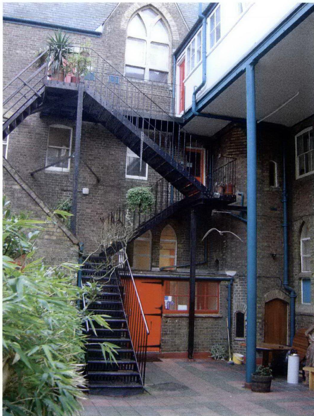
COURTYARD SOUTH ELEVATION