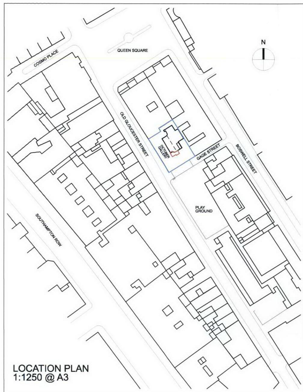
LOCATION PLAN 1:1250 @ A3