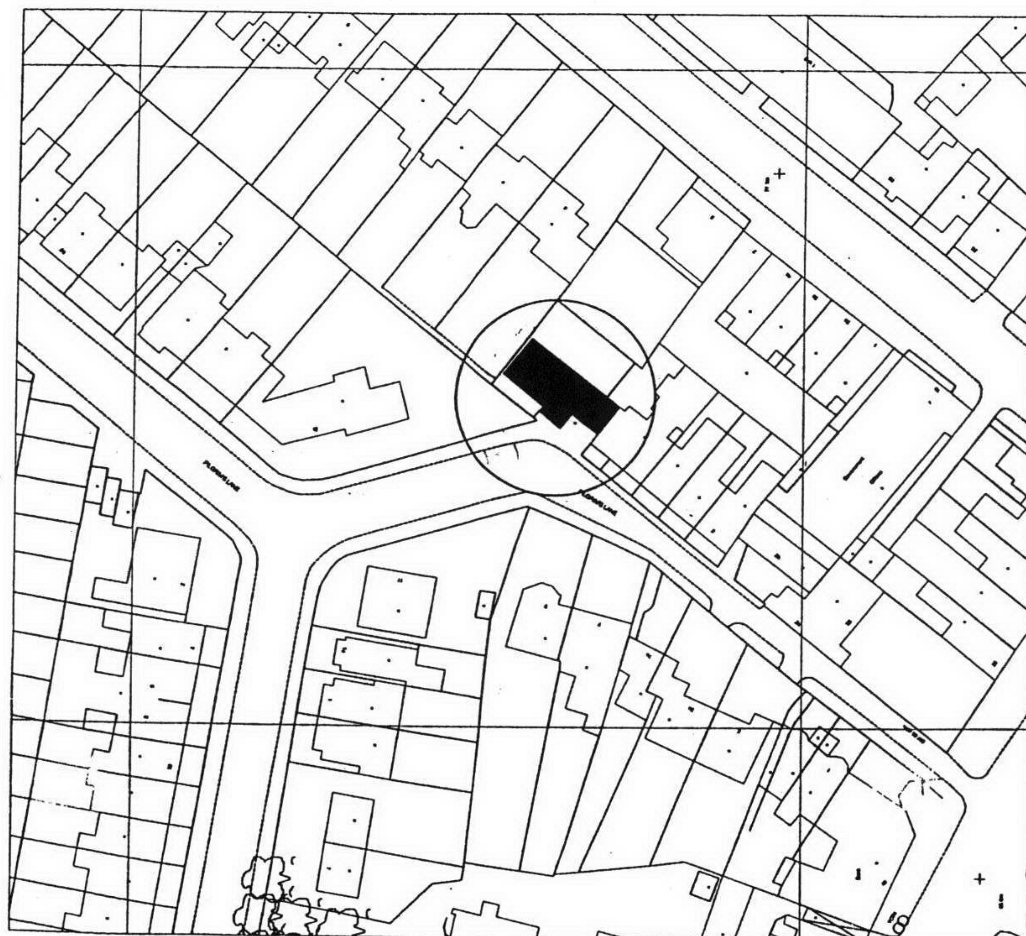
LOCATION PLAN 1:500