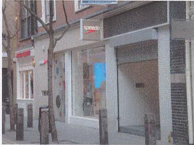
Neighbouring Store to the left of Energise - Speedo has internally illuminated projecting signs existing