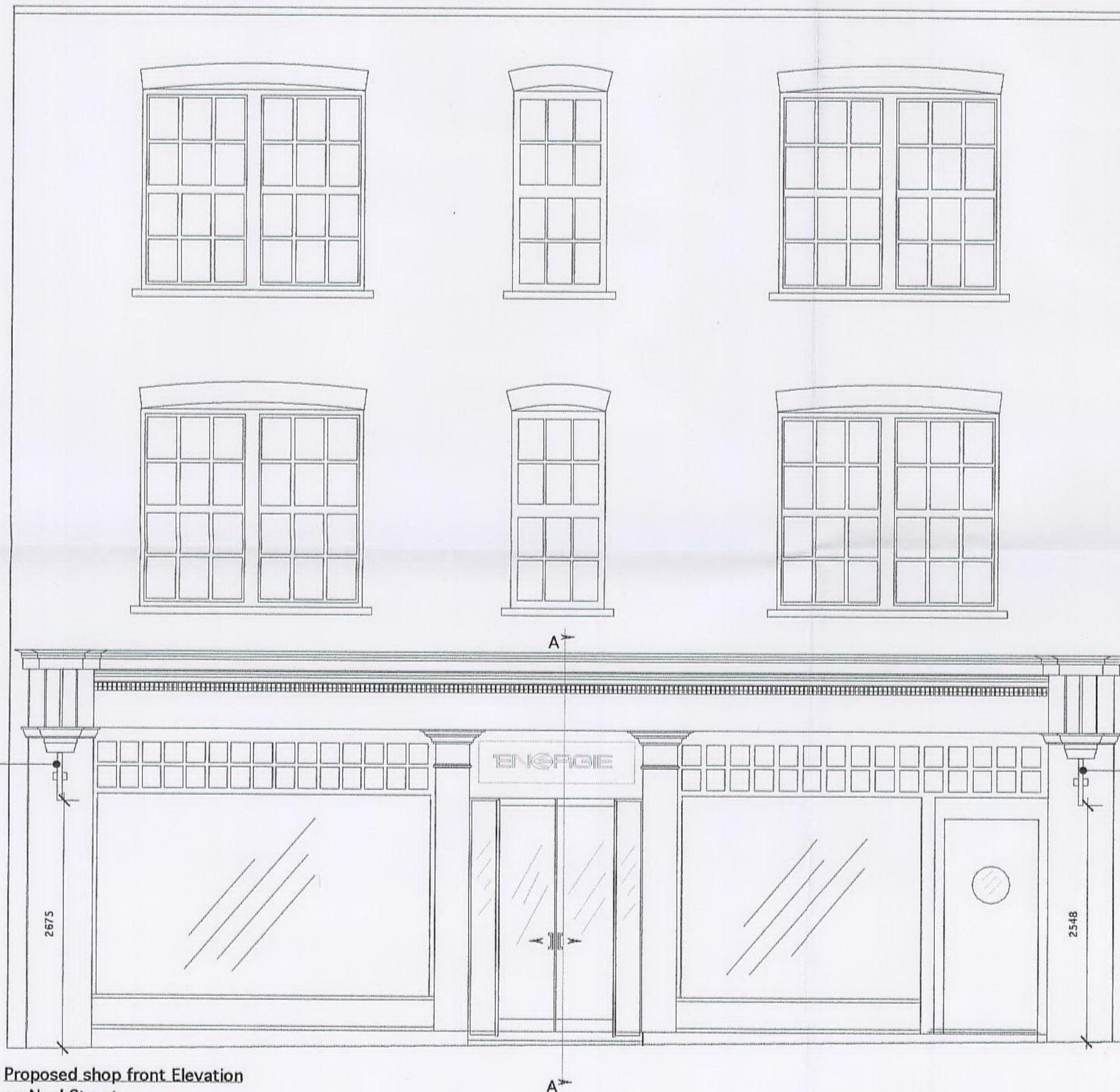
Proposed shop front Elevation on Neal Street Scale 1:50 @A2

Proposed replacement of existing non illuminated projecting sign with new internally illuminated projecting sign - see signage details below.