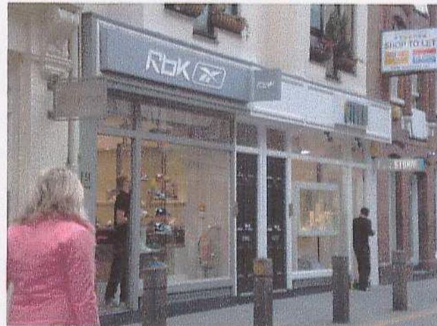
Neighbouring Stores to the right of Energise - RbK and Storm have internally illuminated projecting signs existing