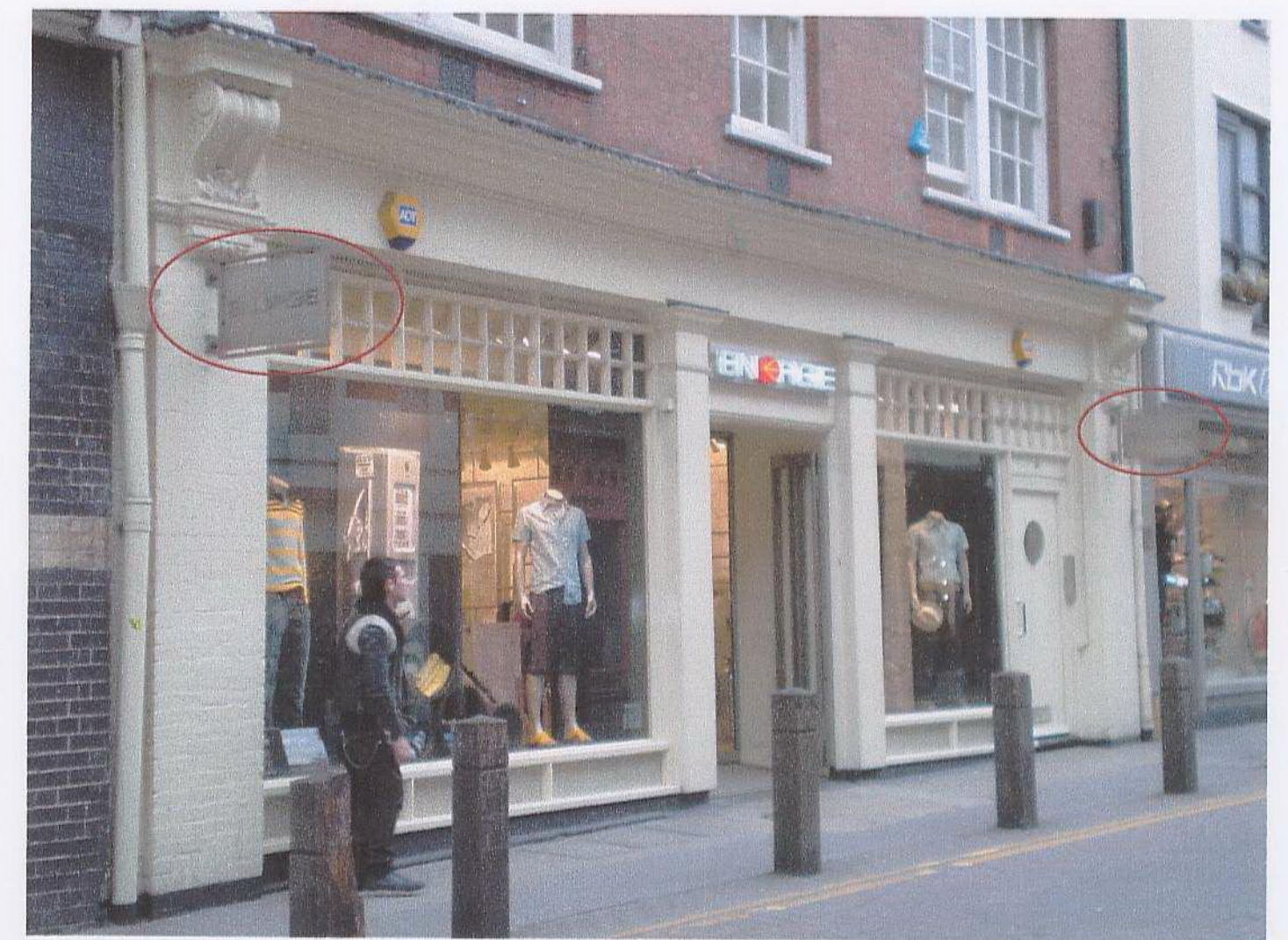
Existing shopfront - showing existing non illuminated projecting signage.

Rev A: Amendment showing correct signage detail - submitted for planning approval 16.05.07 KN