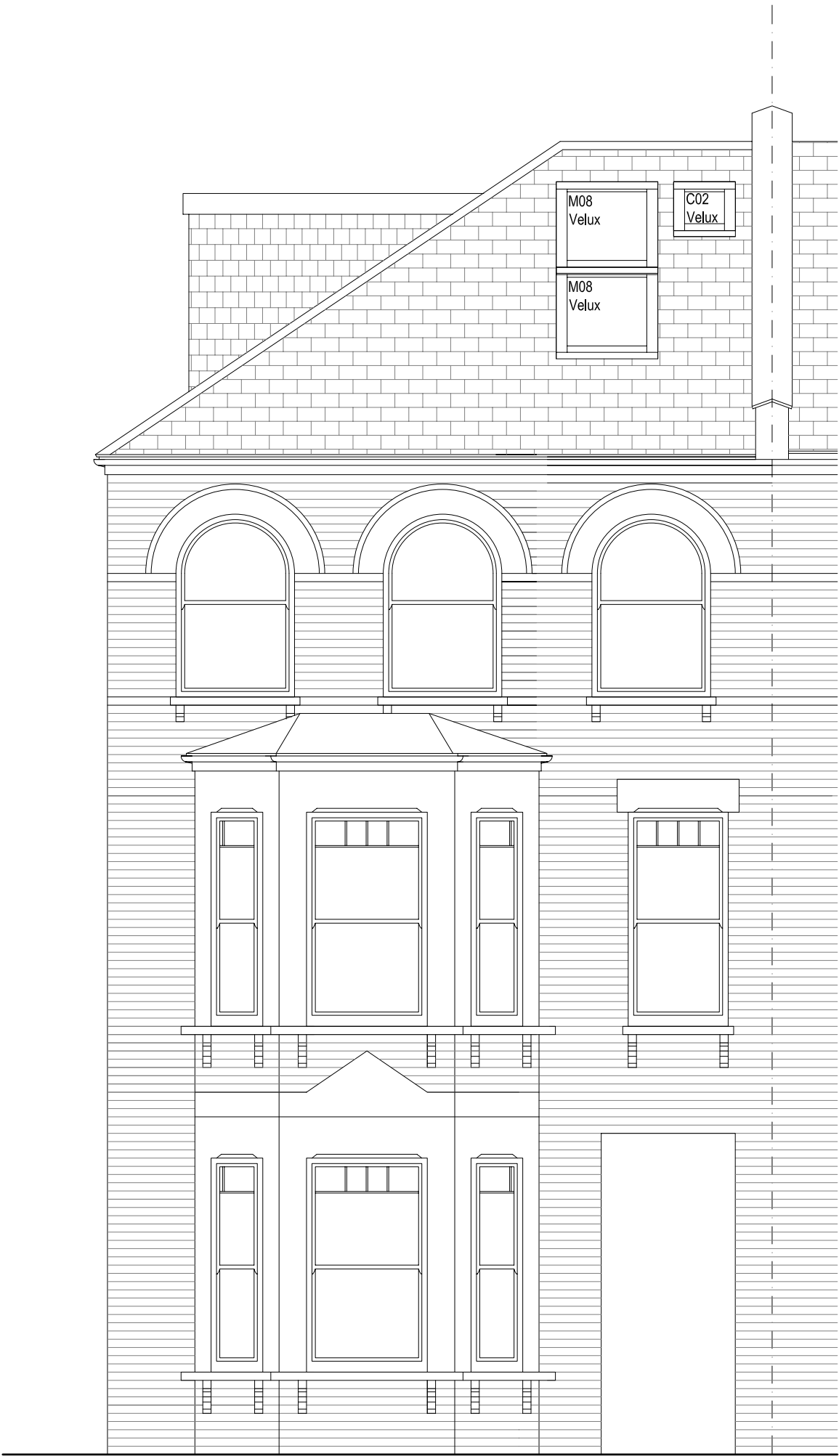
PROPOSED STREET ELEVATION