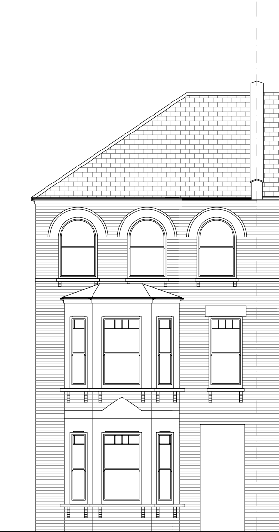
EXISTING STREET ELEVATION