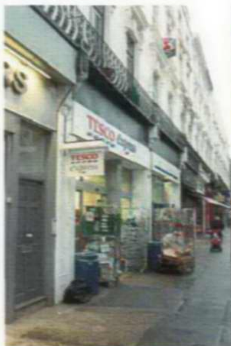
(Front of Store)