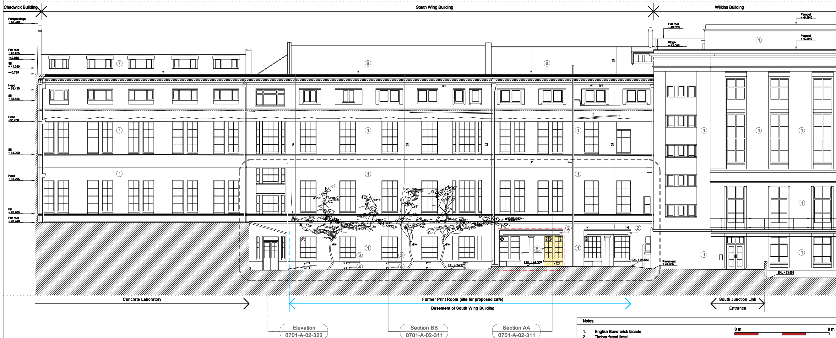
Existing South Wing Building Elevation