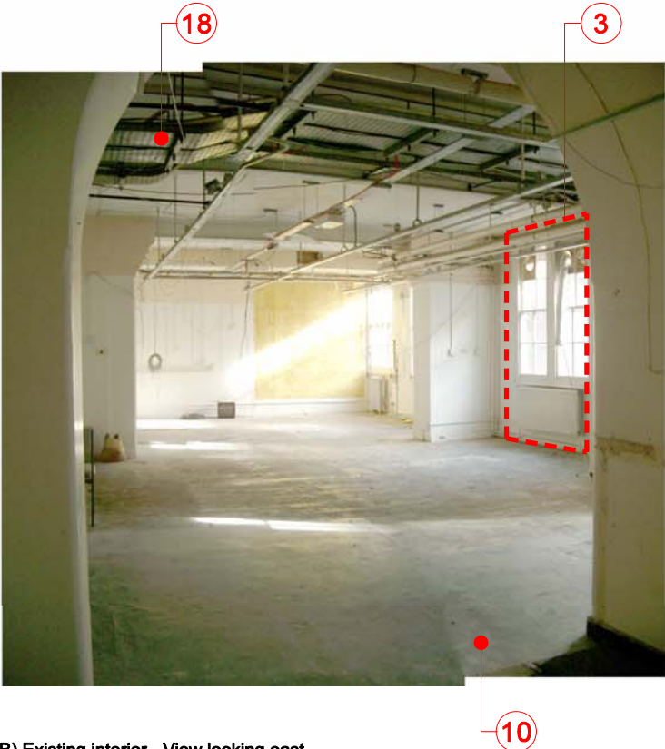
B) Existing interior - View looking east

Notes: For key and notes, please refer to MJP drawing 0701-A-09-802 for information.