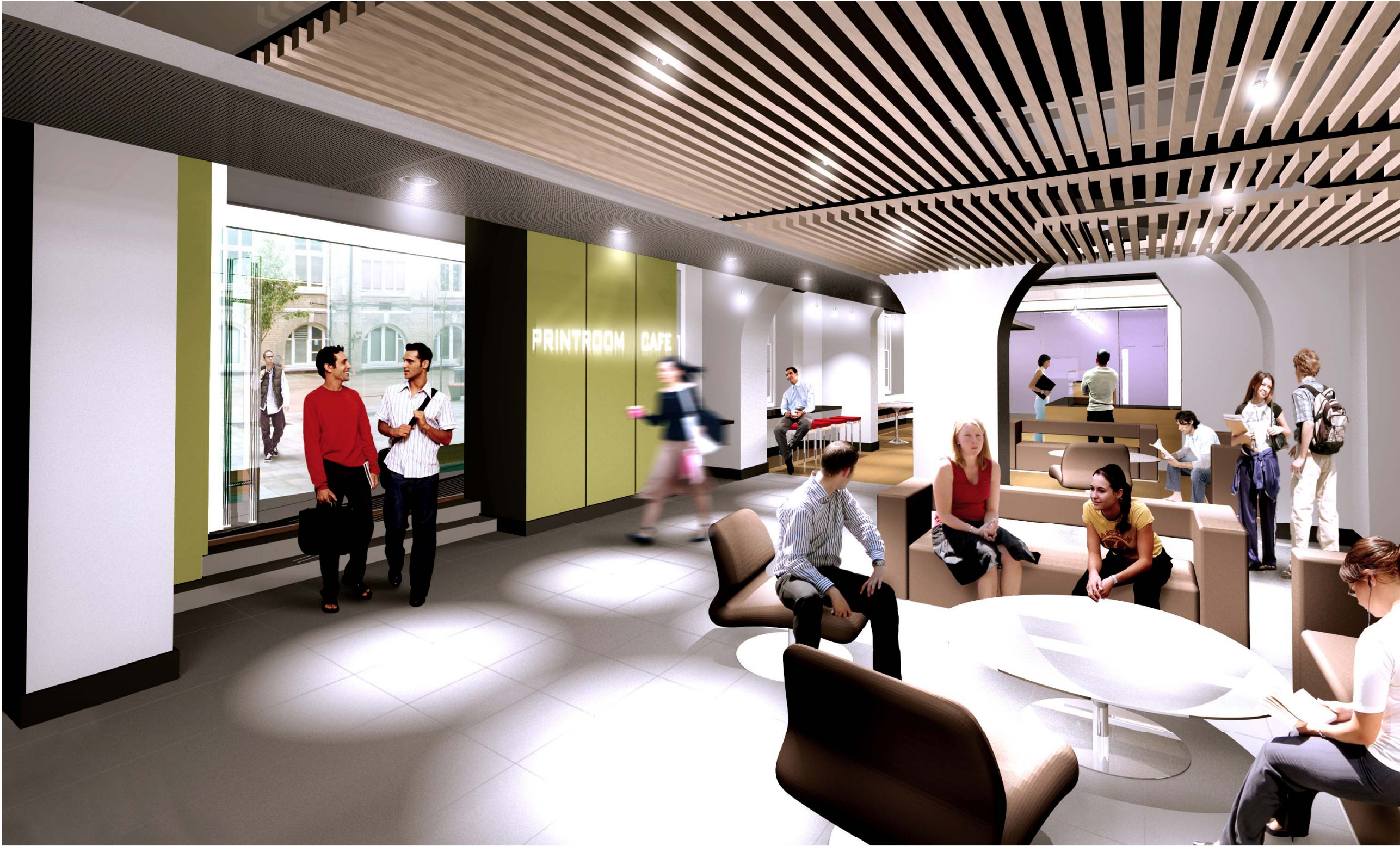
Indicative interior view of lounge seating area (towards the South Quadrangle entrance)