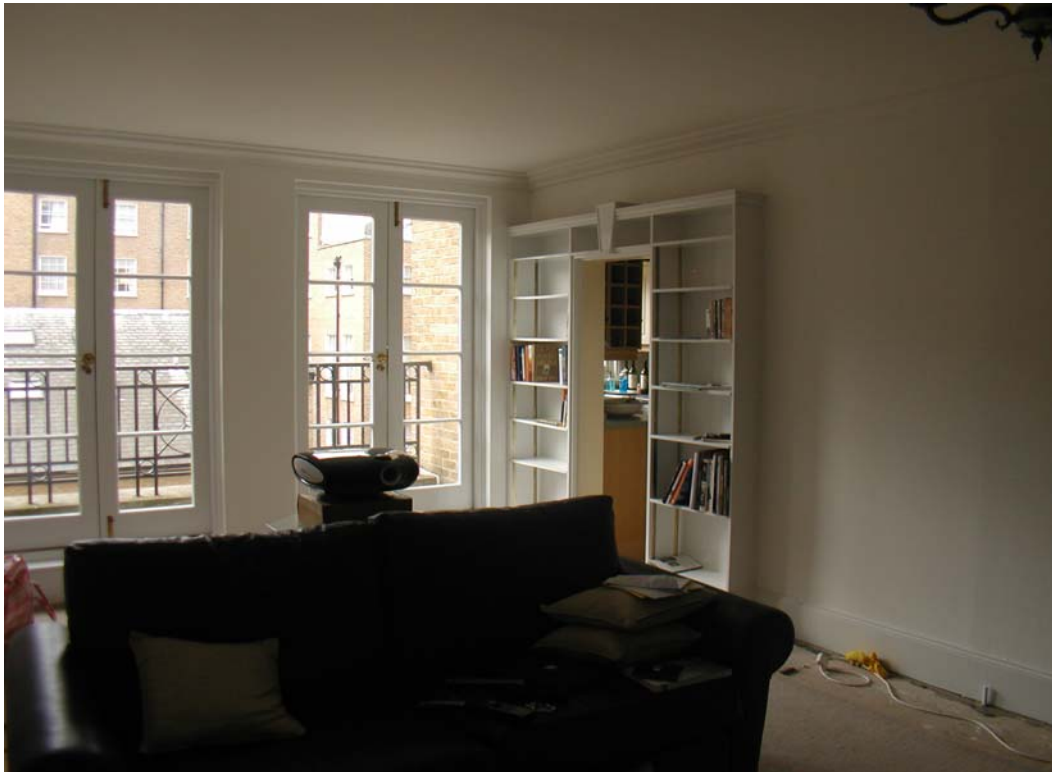
REAR RECEPTION ROOM (view towards Kitchen)

t +44(0)20 7724 8576 e mail@criticalmassarchitects.com