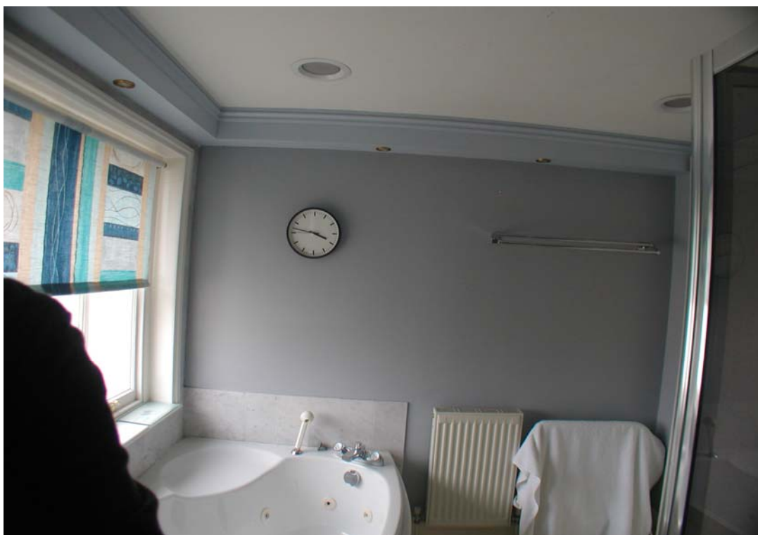
BATHROOM (View of affected wall)

Proposed to remove wardrobes & reposition dividing wall. (Existing board & plaster)