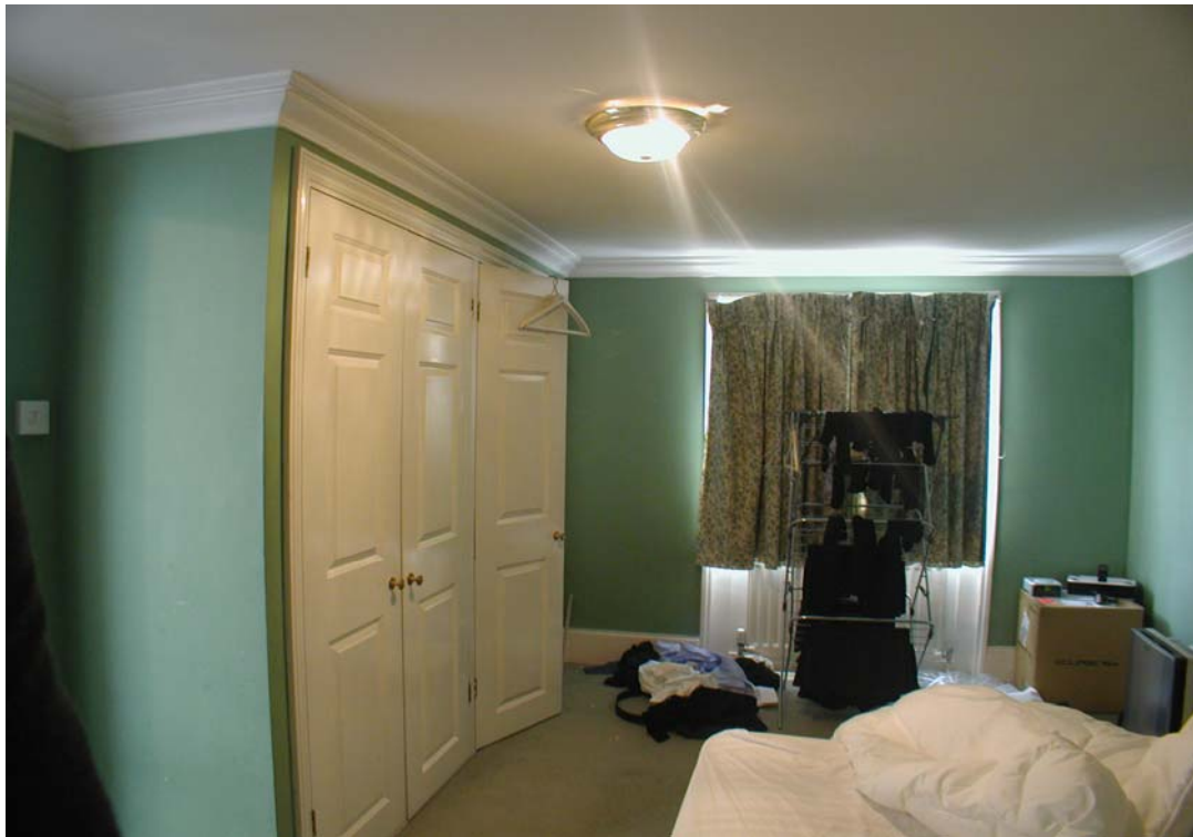
BEDROOM 1 (View of affected wall)

t +44(0)20 7724 8576 e mail@criticalmassarchitects.com