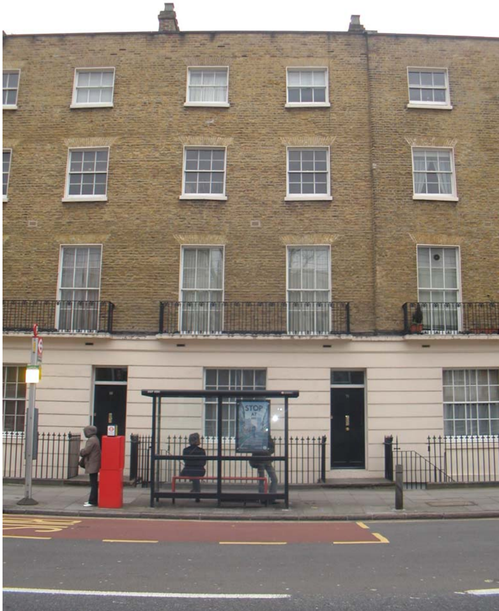
Front Elevation (No Proposed Works) (Flat occupies second and third floors)