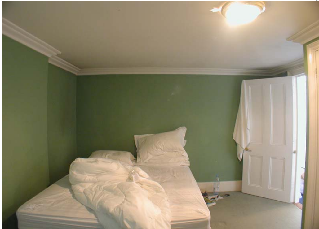
BEDROOM 1 (View of spine wall)

t +44(0)20 7724 8576 e mail@criticalmassarchitects.com