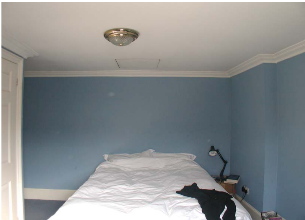
BEDROOM 2 (View of spine wall)

Proposed to introduce new opening to spine wall, immediately adjacent to chimney breast. Height to match existing door height (maintain existing Cornice). Using set-aside skirting where removed to line jambs of new opening