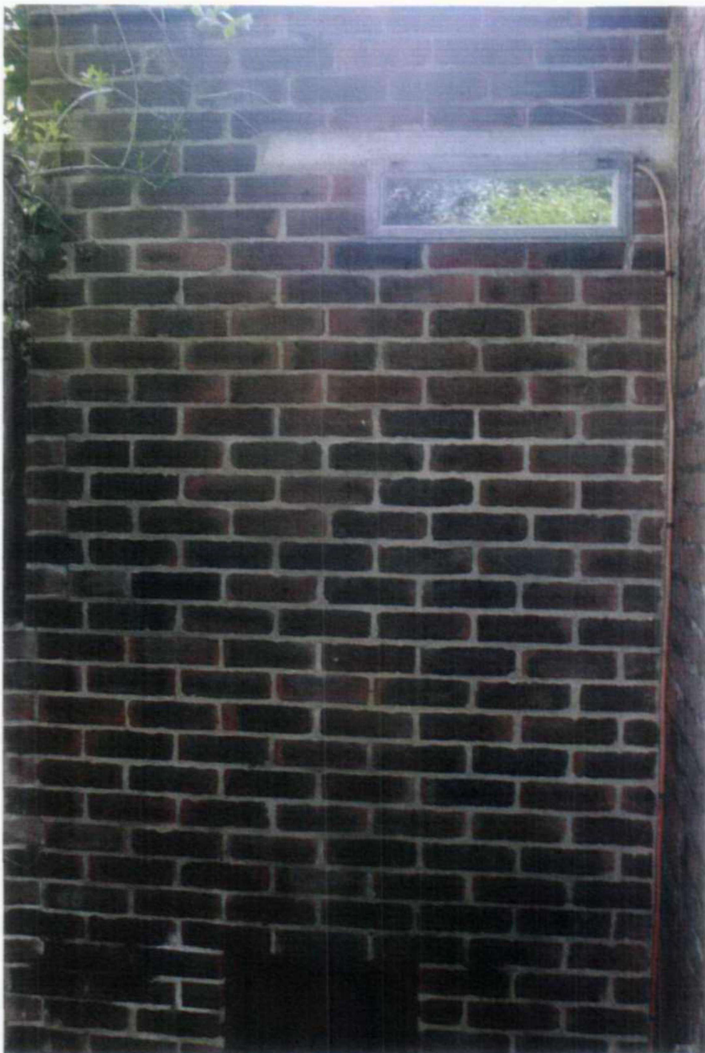
Existing utility outrigger to the North (Rear Elevation)