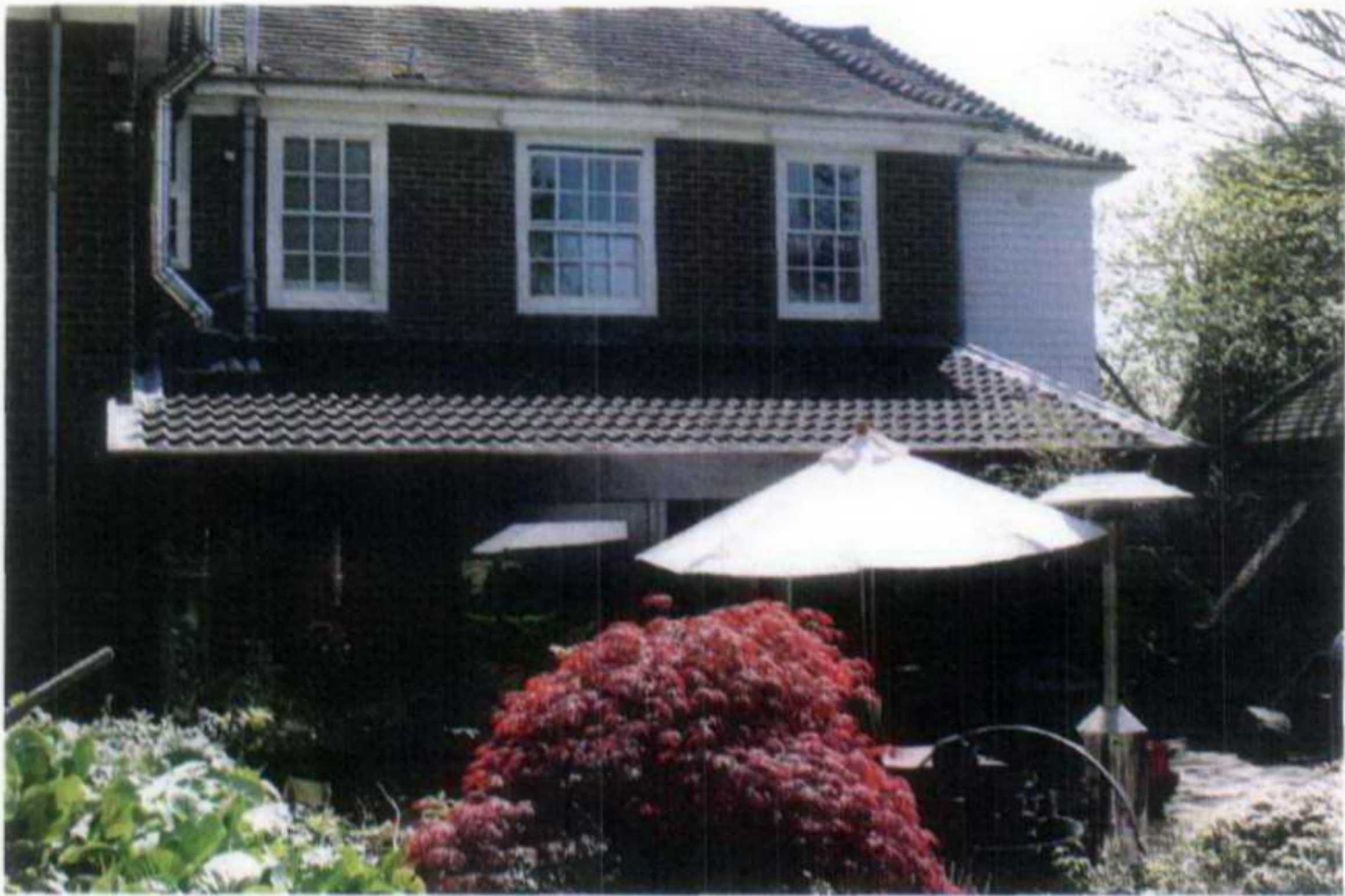
Existing Garden Room (Rear Elevation)