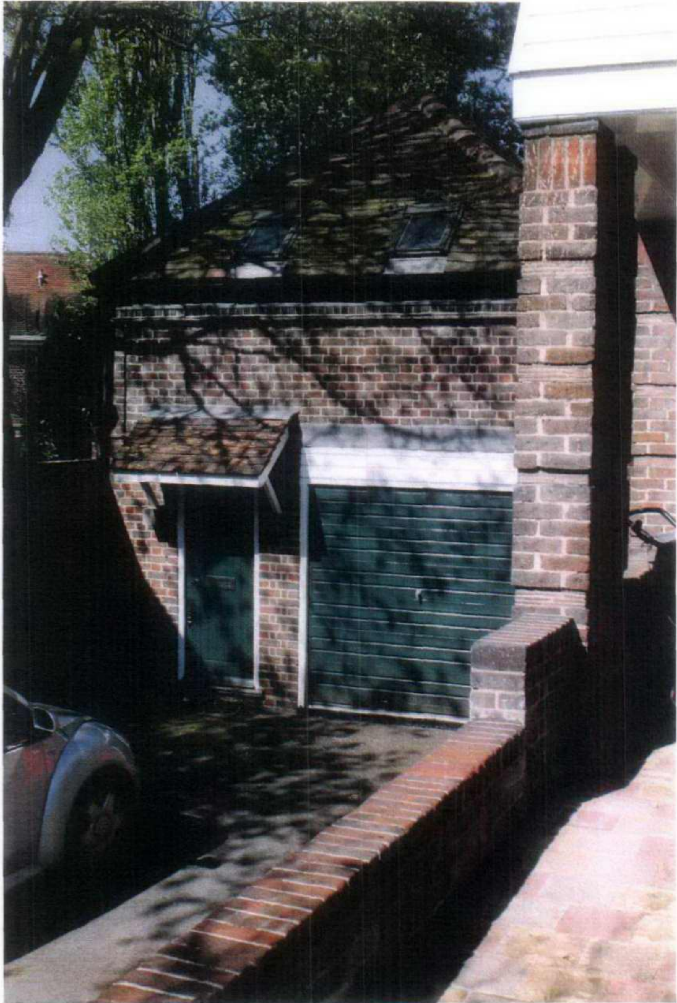
Existing Garage Annex (Front Elevation)