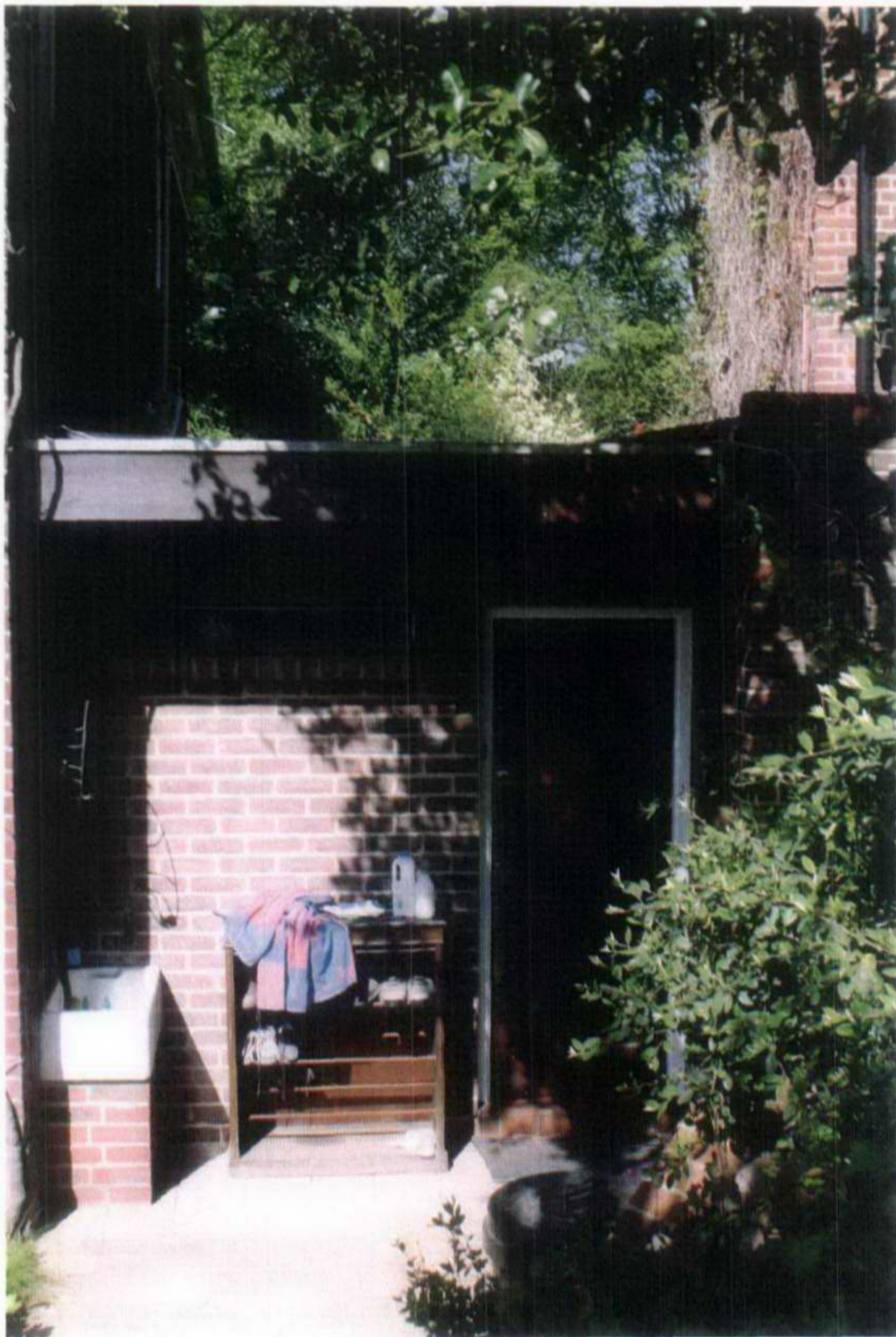
Existing utility outrigger to the North (Front Elevation)

Photographs showing existing areas to be demolished & rebuilt