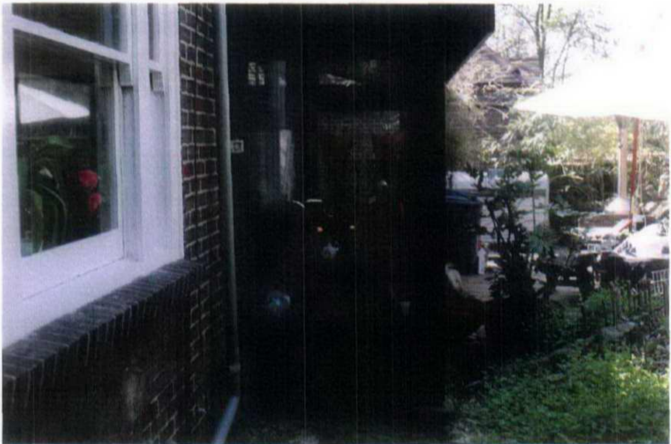
Existing Garden Room (Side Elevation)