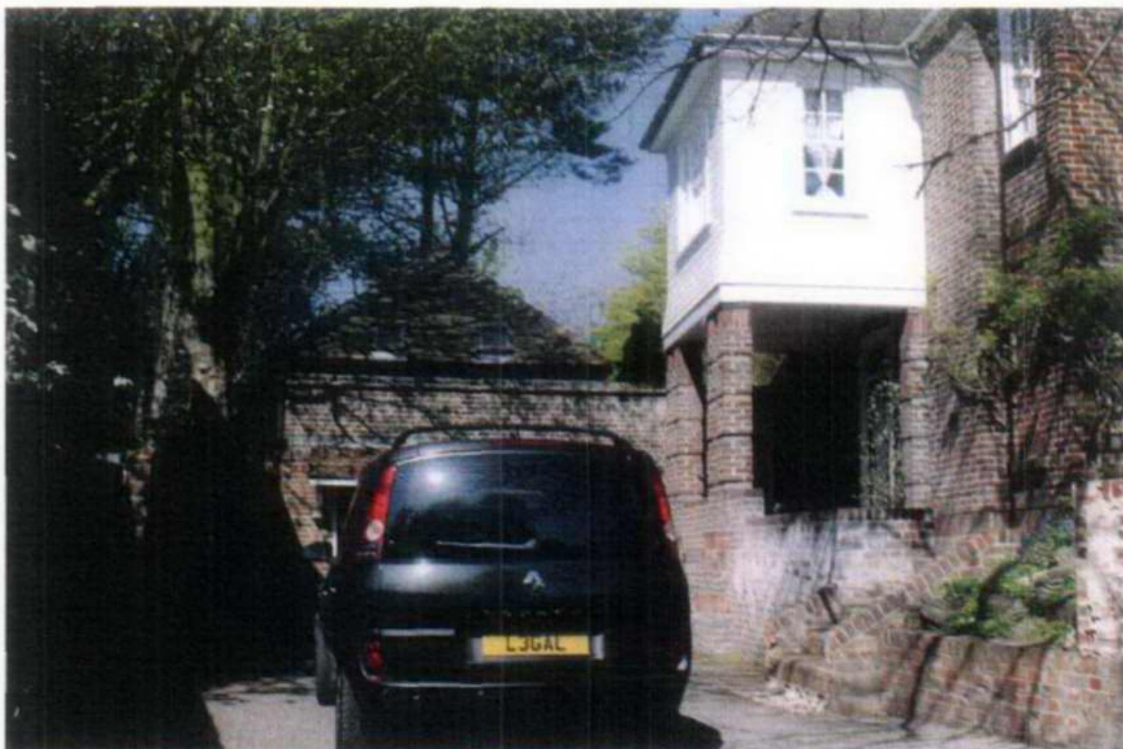
Existing Garage Annex (Front Elevation), showing also clad front entrance side outrigger to be rebuilt