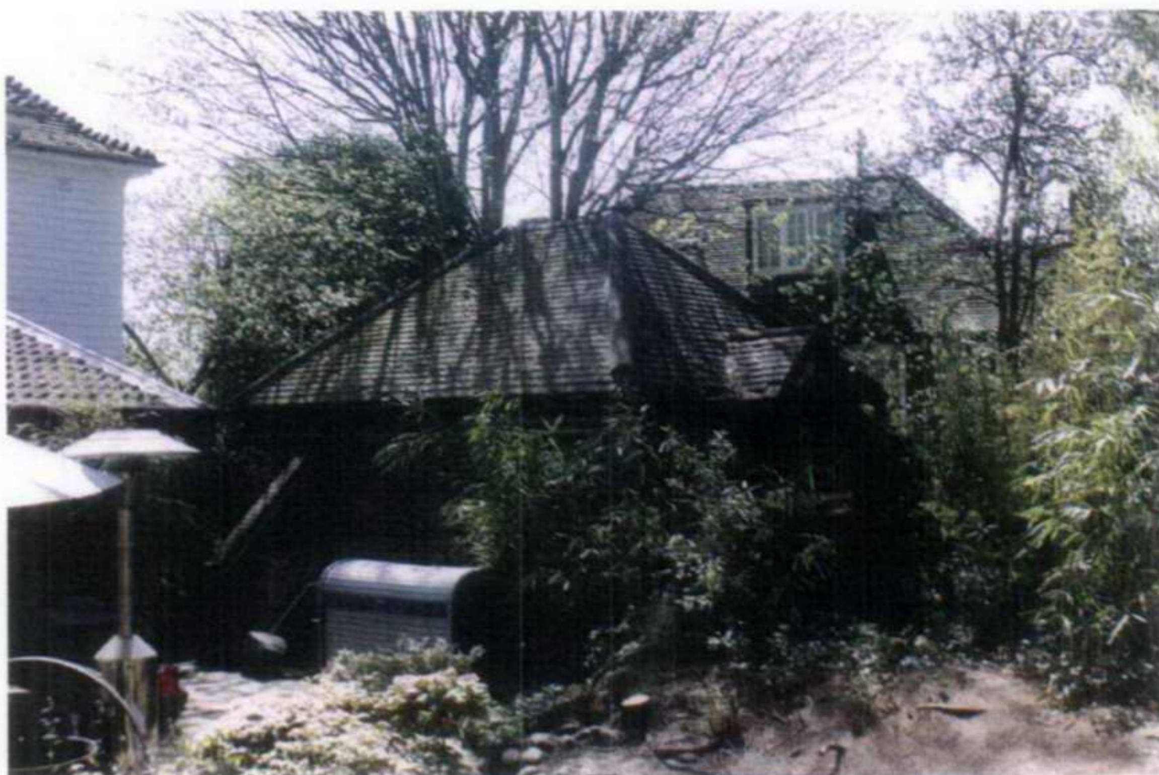
Existing Garage Annex (Rear & Side Elevation)