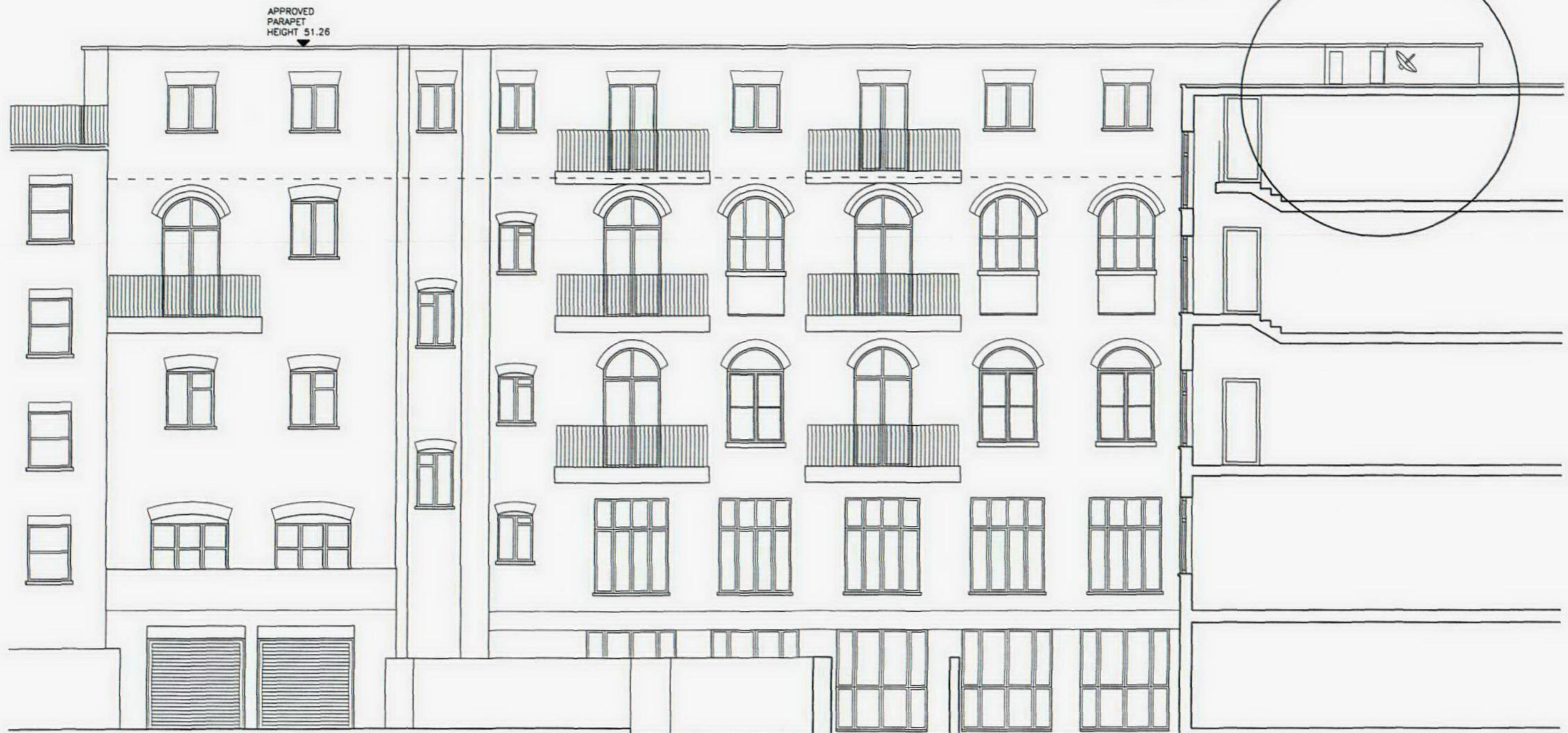
PROPOSED REAR ELEVATION SHOWING LOCATION OF A/C UNITS AND SATELITE DISH

©The copyright of this drawing belongs to neale & norden ltd. Do not reproduce or use this drawing without prior permission of neale & norden ltd.