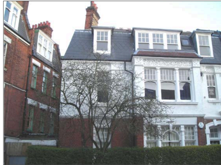
Front elevation (2 of 2)