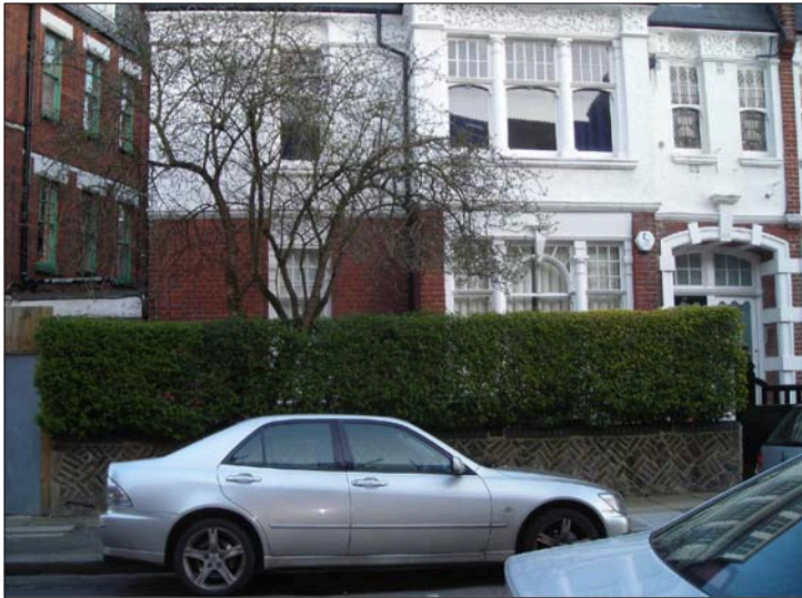
Front elevation (1 of 2)