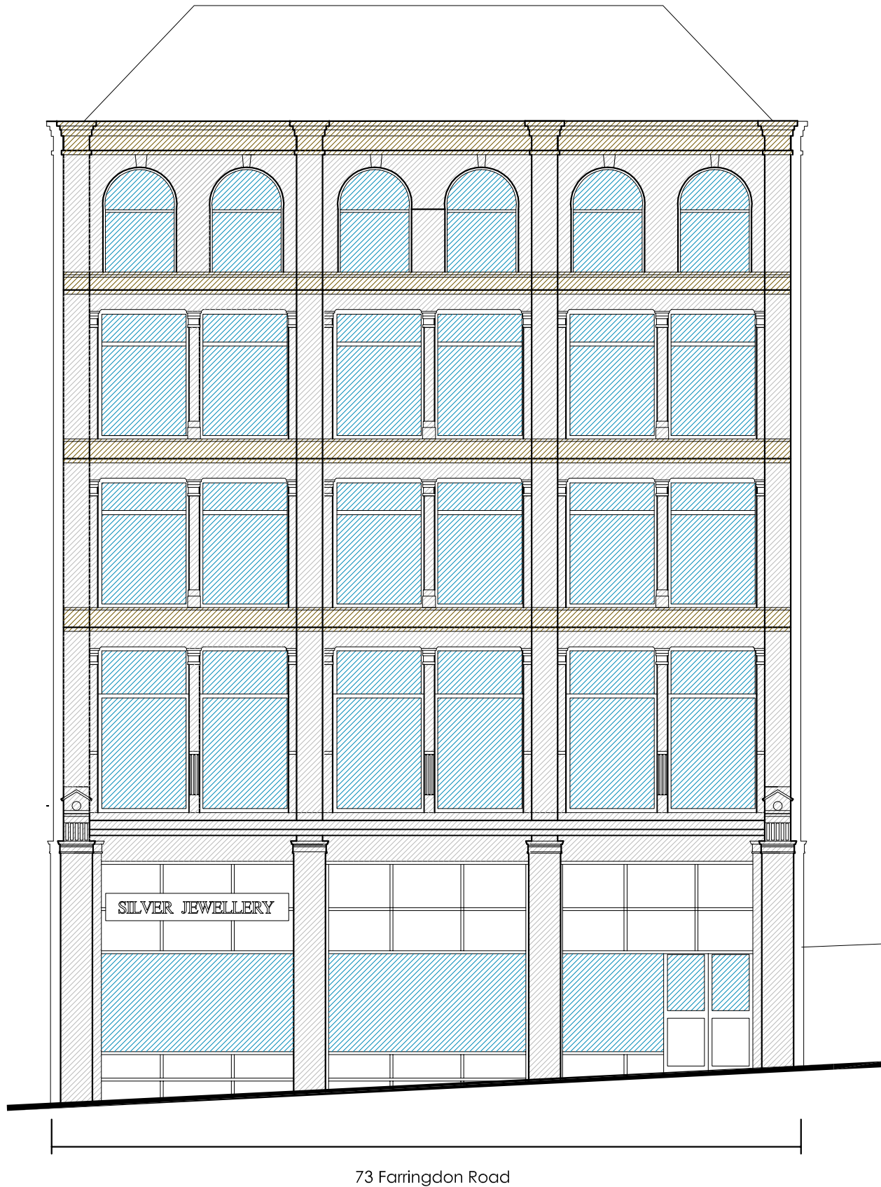
Existing North Elevation Scale 1:100

RBA grant licence to the intended recipient to employ the information as contained in this drawing for the purposes connected with the related project only. Copyright of this information remains solely the property of RBA unless otherwise assigned in writing. Any breach of the terms of this licence results in the termination of the licence and the medium and any resulting copies must be returned to RBA immediately.